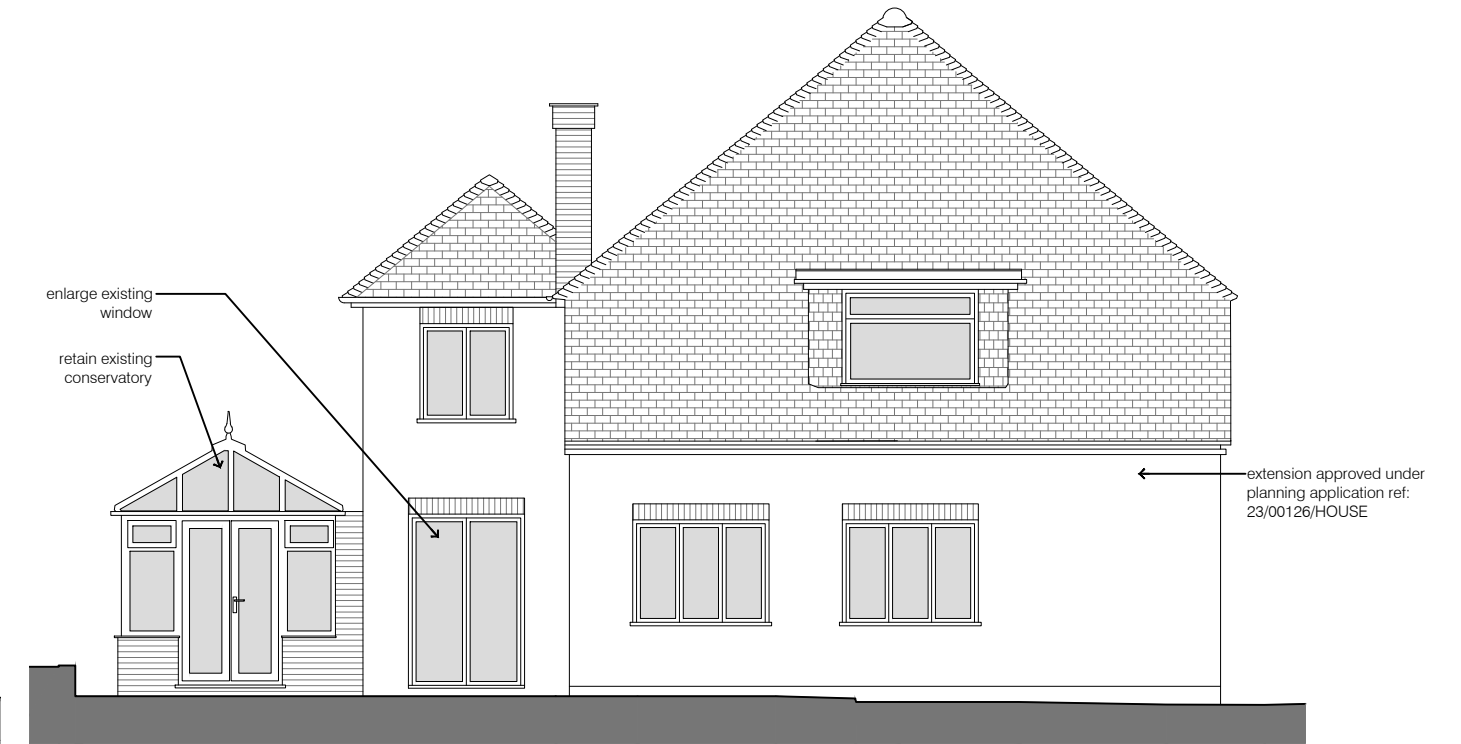
Side South West Facing Elevation