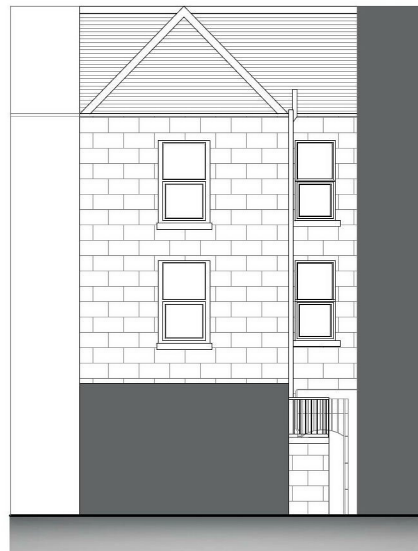
Existing West Elevation