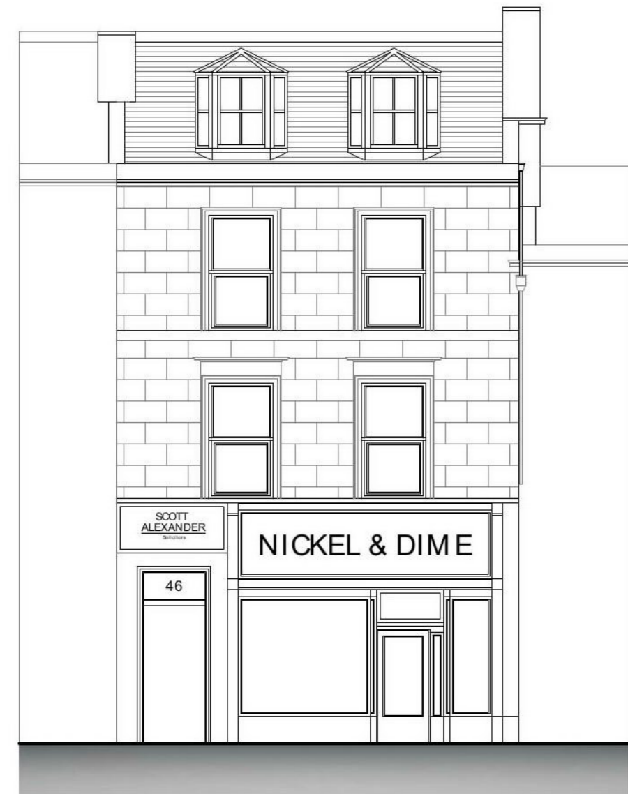
Existing East Elevation