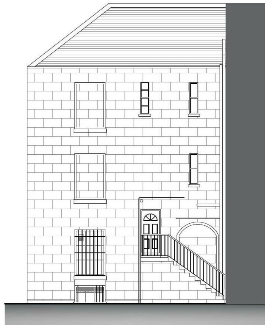
Existing South Elevation