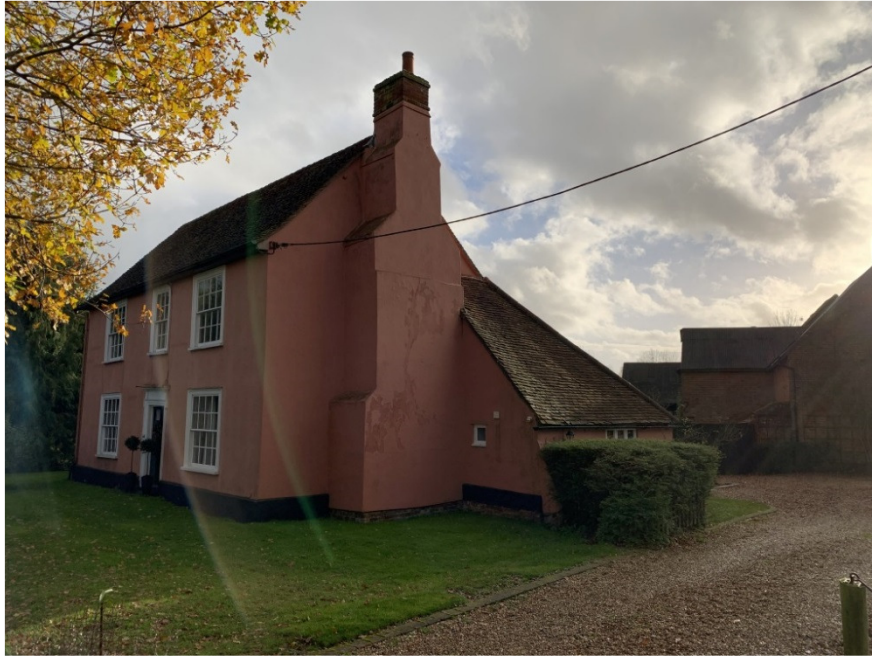
Figure 1: Front view looking at Dillacks Farm from the road entrance gate. Dillacks farm is a 2-storey main house (road frontage side) with one and a half storey rear extensions. The house walls are rendered and has plain tiled roofs with painted/red brick chimneys.

Dillacks Farm is an 18 th century Grade 2 listed building (list ID 1351737). It is the main house that is listed whilst the surrounding barns and outbuildings come within it's curtilage but are not listed themselves. The proposed work is to the old stable block outbuilding. The site sits within agricultural land, does not lie within a conservation area or AONB and is not at risk of flooding (flood zone 1 - see flood map)