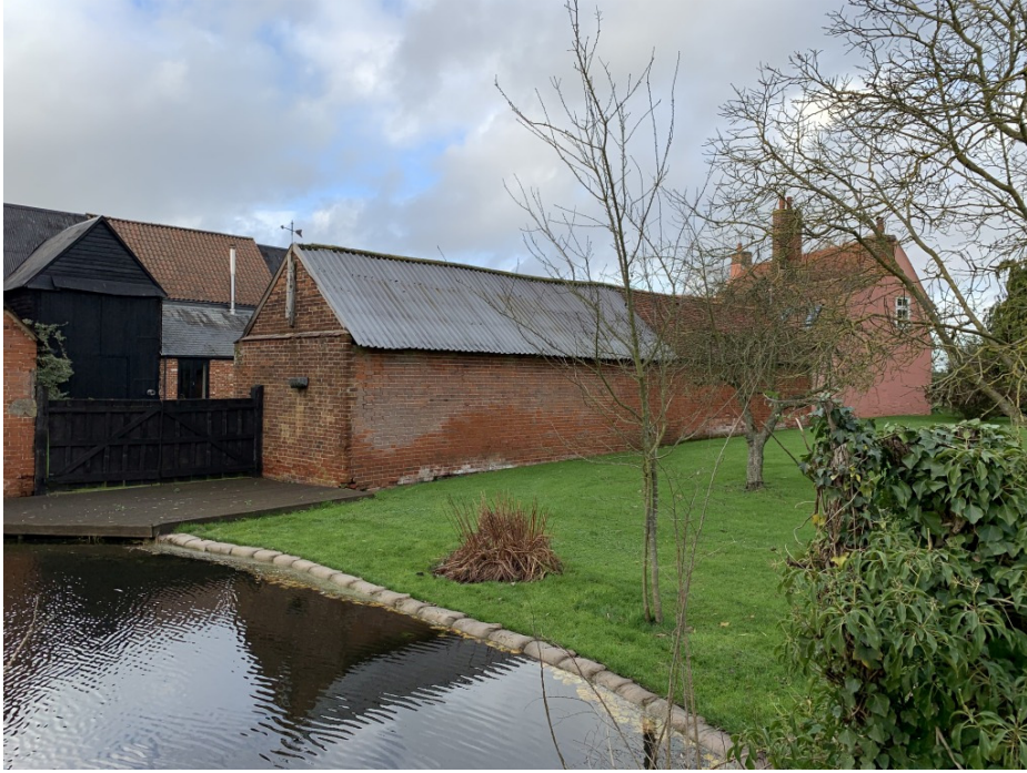
Figure 9: The log store and workshop looking northwest with entrance gates to the left of the picture