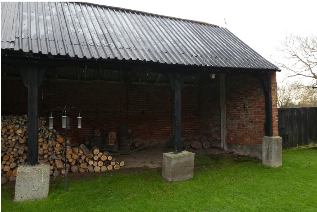
Figure 8: The 3-bay open shelter-shed, now used as a log store, will form the new living and kitchen/dining area. The timber posts will be refurbished and will sit on new stone saddle blocks. The roof is structurally unsound with it's rafters listing to the north, resulting in serious deflection to the brick gables and needs urgent repair. The sheet metal roofing will be replaced with a more traditional plain tile.