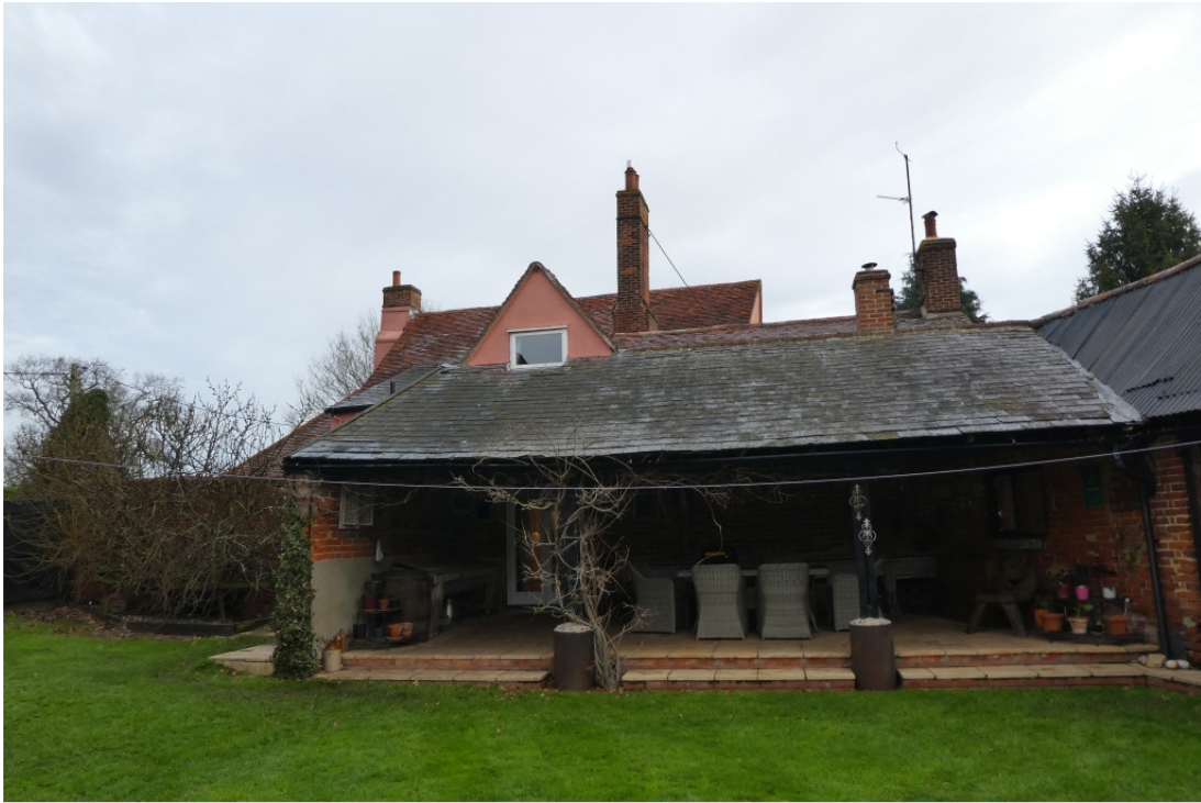
Figure 7: Adjoining the rear part of the house is an open-fronted slate roof covered patio seating area. This will remain as it is. It used to be an open shelter for the cow yard.