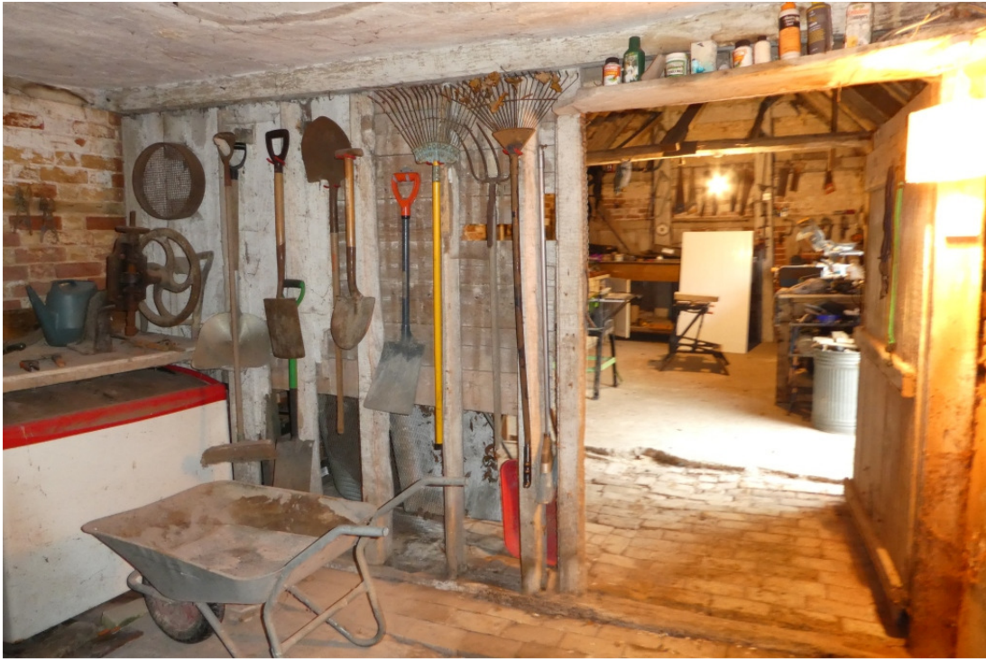
Figure 13: The existing timber stud partition and ceiling is proven to be of historic interest and will be retained and made good. This used to be the feed mixing shed with a cow shed through the door