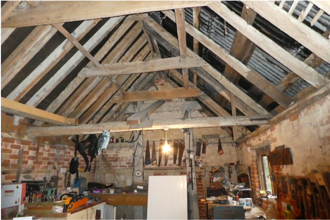
Figure 15: The existing timber roof. A timber strut can be seen supporting the listing brick gable and being fixed to the tie beam and collar.