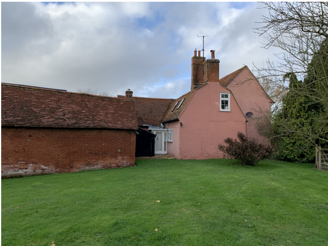
Figure 10: The workshop store and main house as seen from the field