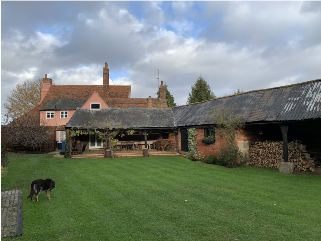
Figure 5: The old cow shed and 3-bay open shelter-shed runs off south from the old cow yard open shelter (now a covered patio area) and looks over the courtyard garden. The proposal is to make the old cow shed and 3-bay open shelter into an annexe.