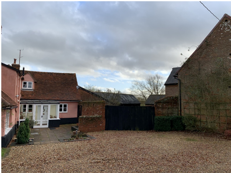
Figure 2: House entrance to the left and entrance gates to the courtyard garden from the drive