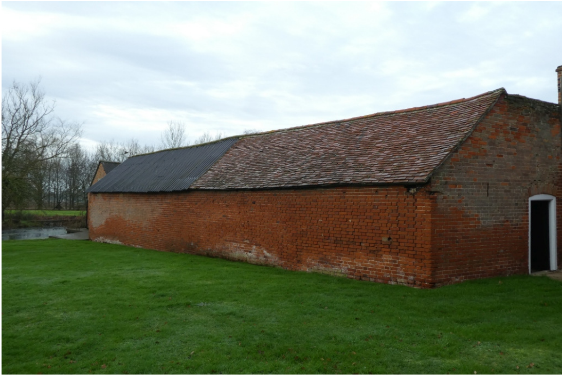
Figure 11: The brick outbuilding (now log store and workshop) looking southwest from the field with the pond in the background. The proposal will replace the profiled metal roof with traditional plain tile. The brickwork is to be repointed and made good. A new high-level small timber casement window will be introduced along this wall for the bedroom.