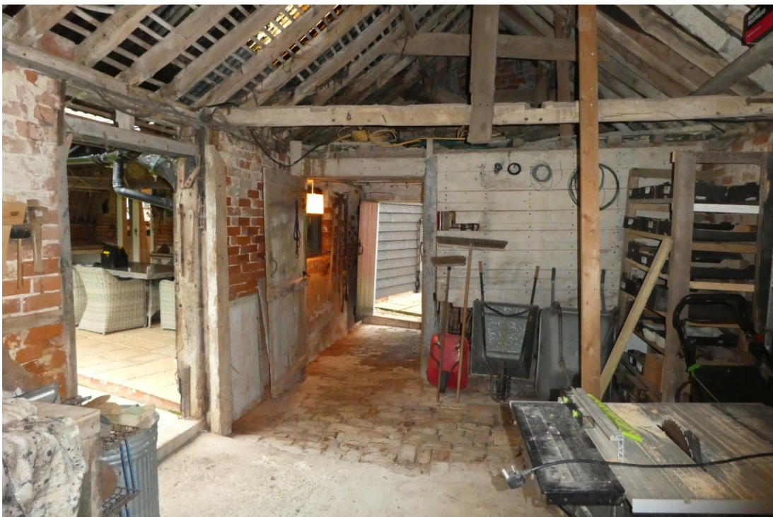
Figure 14: The existing timber stud partition wall is to be retained and is seen from the workshop side here. The existing plank and batten door is to be refurbished and rehung opening the other way. The floor, walls and roof will be thermally upgraded. The stable doors will be replaced with a new timber boarded door and the windows replaced with new double glazed timber flush casements. The roof will be structurally made good, retaining the existing roof members where possible. New conservation roof light (garden side) will provide light to the new bathroom.