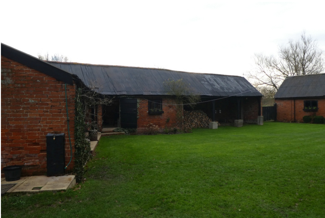
Figure 6: The old cow house and 3-bay open shelter-shed looking east from the garden. The shelter is currently used as a log store and the old cow house is used as a workshop.