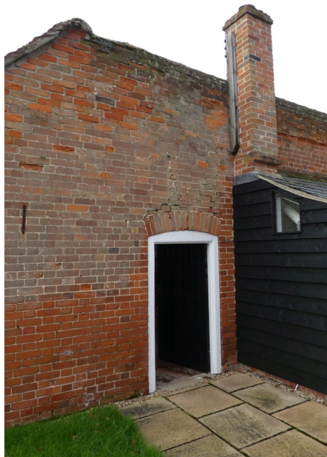
Figure 12: The side entrance door to the workshop store. This will have a new half-glazed door.