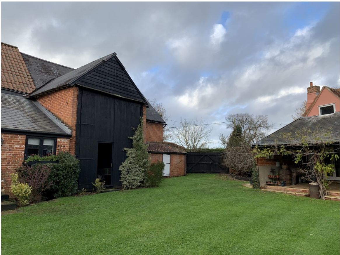
Figure 4: Courtyard garden looking northwest to the entrance gates. The barn to the left has been converted to a dwelling.