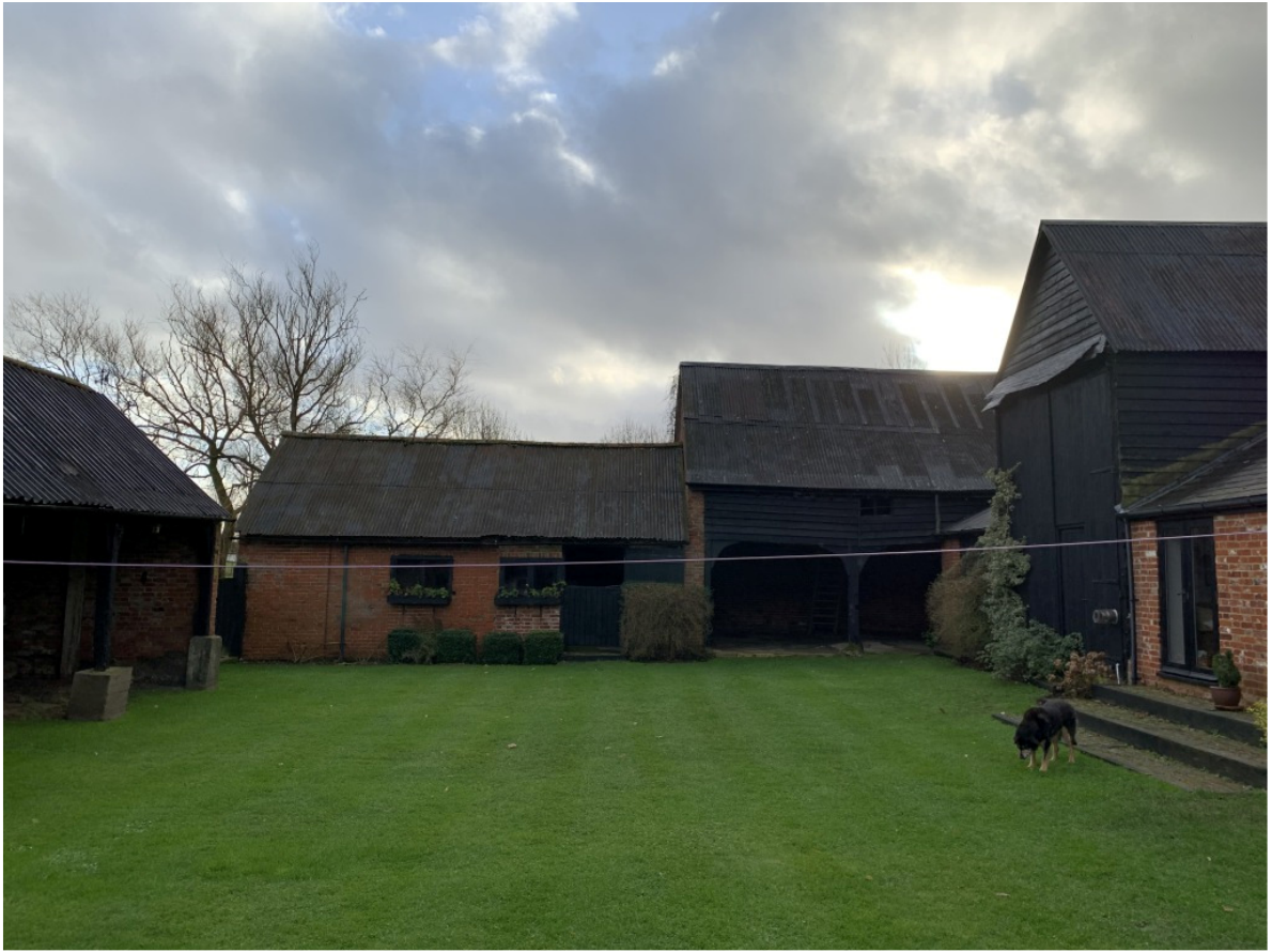
Figure 3: Courtyard garden looking south to the barns which are used for storage