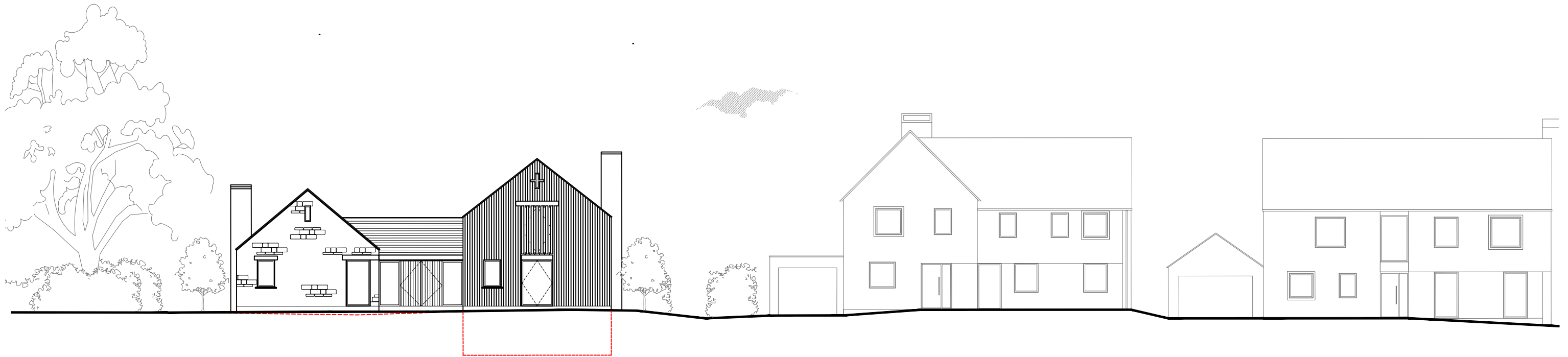
NORTH SITE SECTION