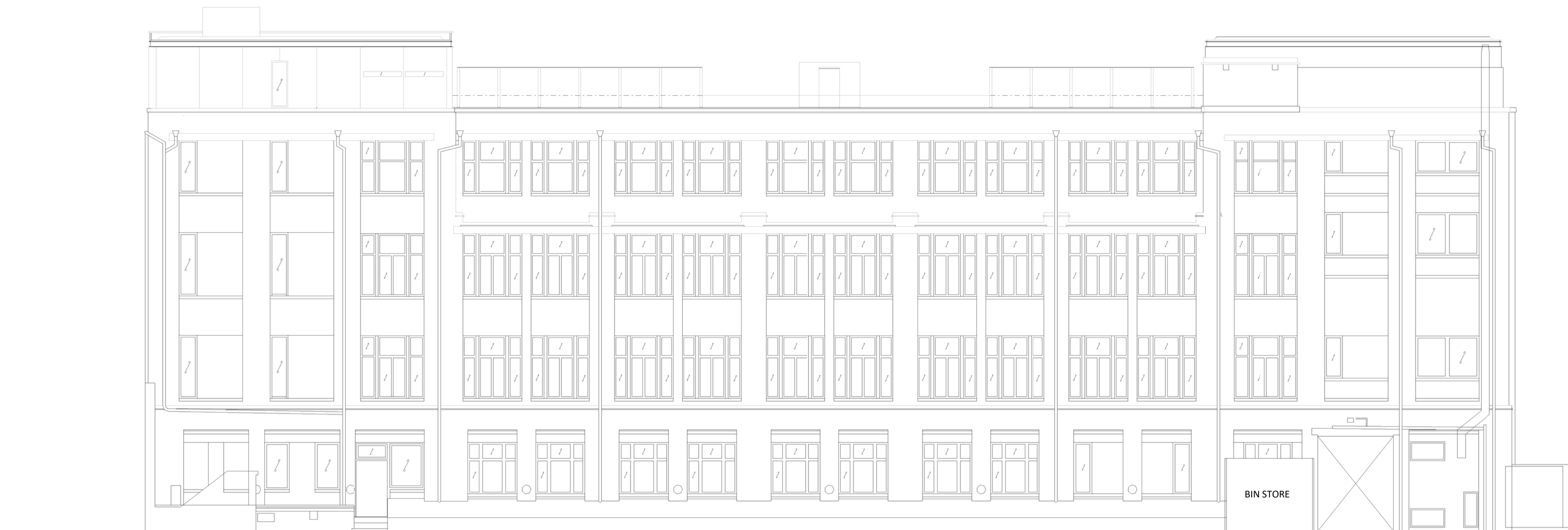
1 Existing North West Elevation 1 : 100

NOTES CONSULTANTS - Refer to highways consultant's drawings for details - Refer to landscape consultant's drawings for details - Landscaping layout is indicative only AREAS - Refer to area schedule © Copyright Reserved. ColladoCollins Partners LLP