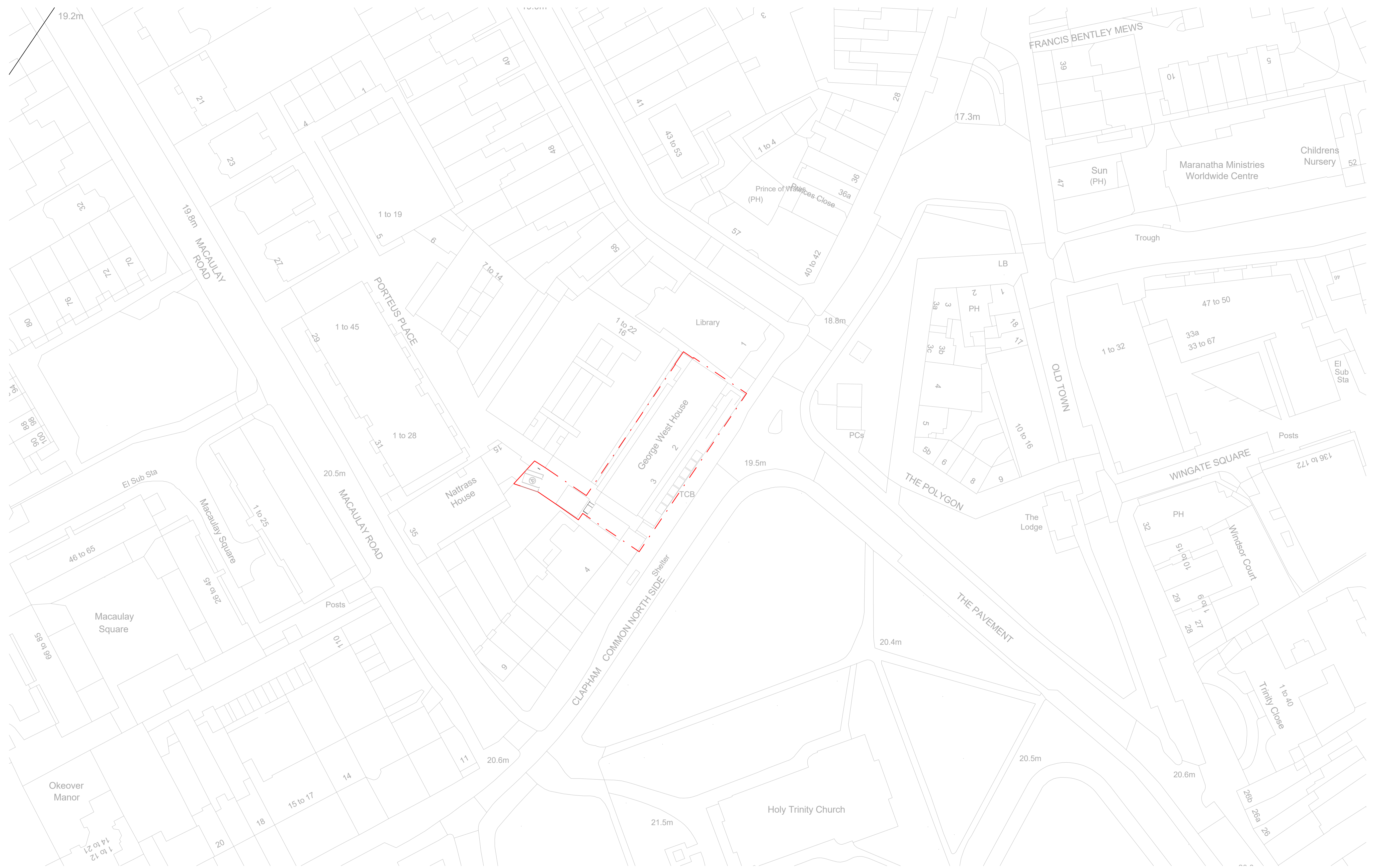
1 Site Plan 1 : 500