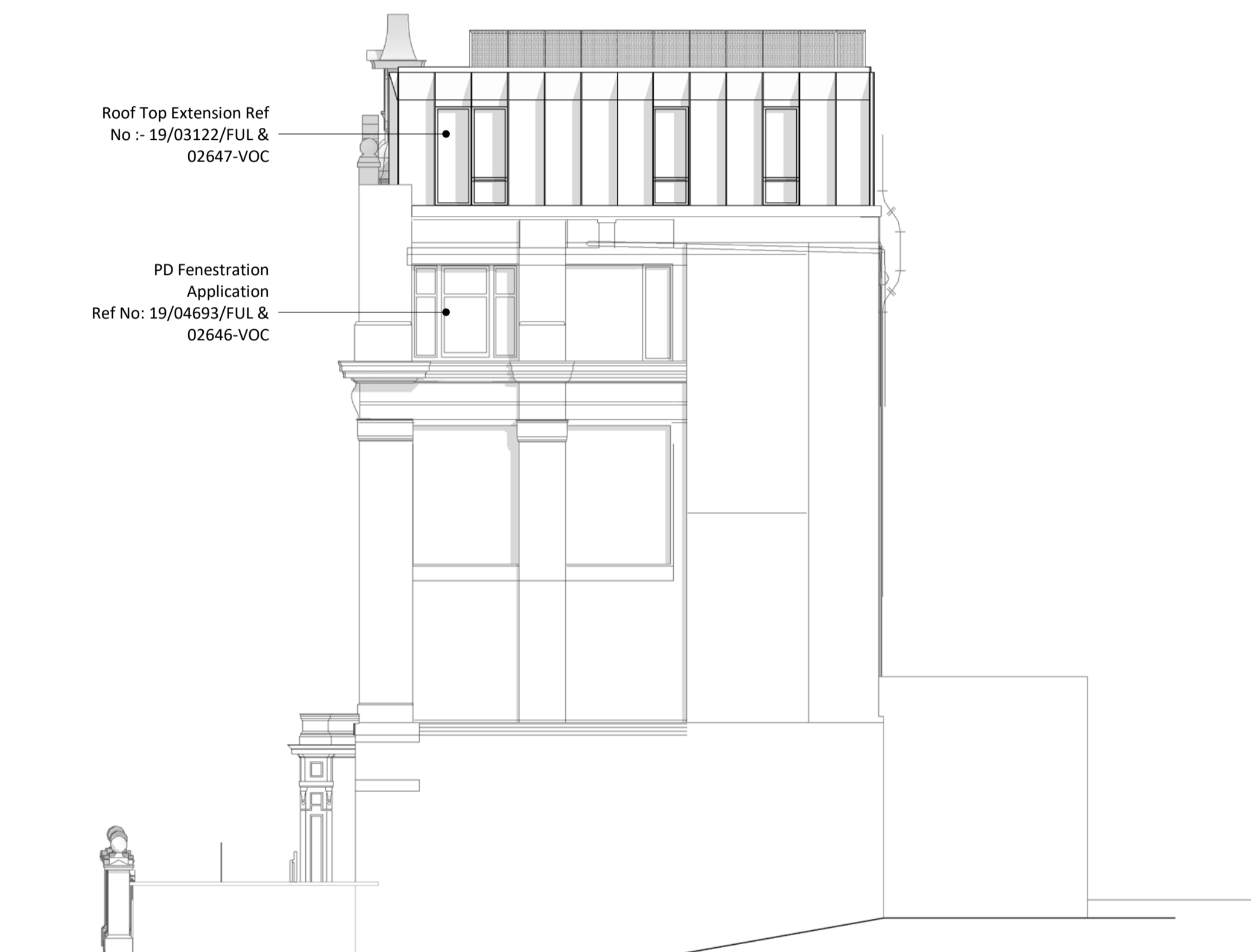
2 Proposed North East Elevation 1 : 100

NOTES CONSULTANTS - Refer to highways consultant's drawings for details - Refer to landscape consultant's drawings for details - Landscaping layout is indicative only AREAS - Refer to area schedule © Copyright Reserved. ColladoCollins Partners LLP