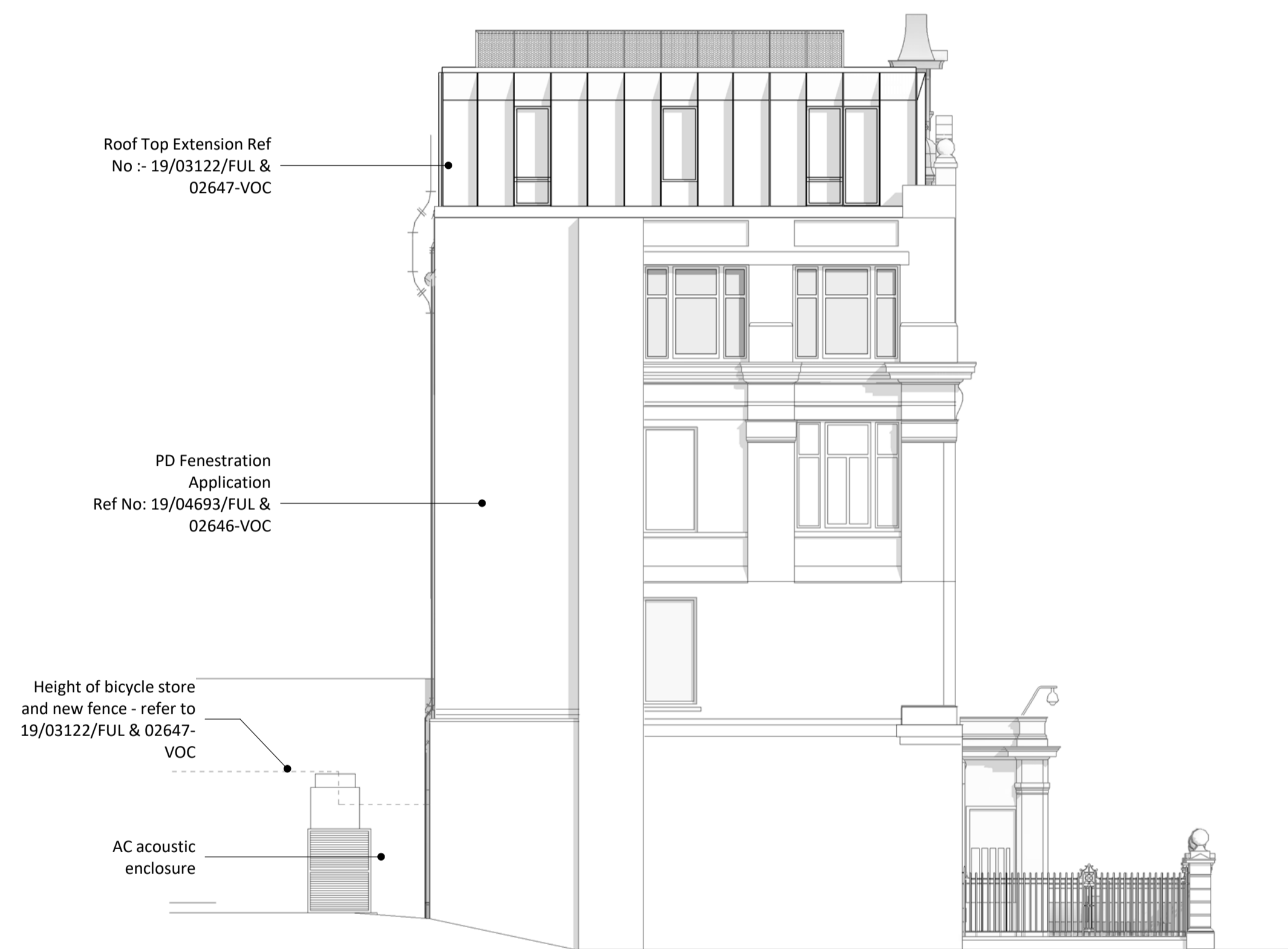
1 Proposed South West Elevation 1 : 100