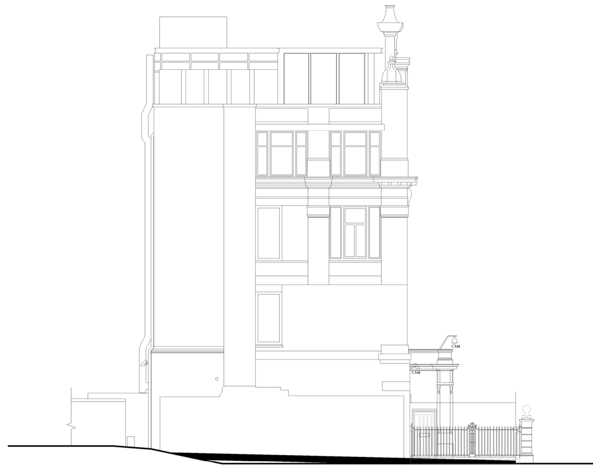
2 Existing South West Elevation 1 : 100