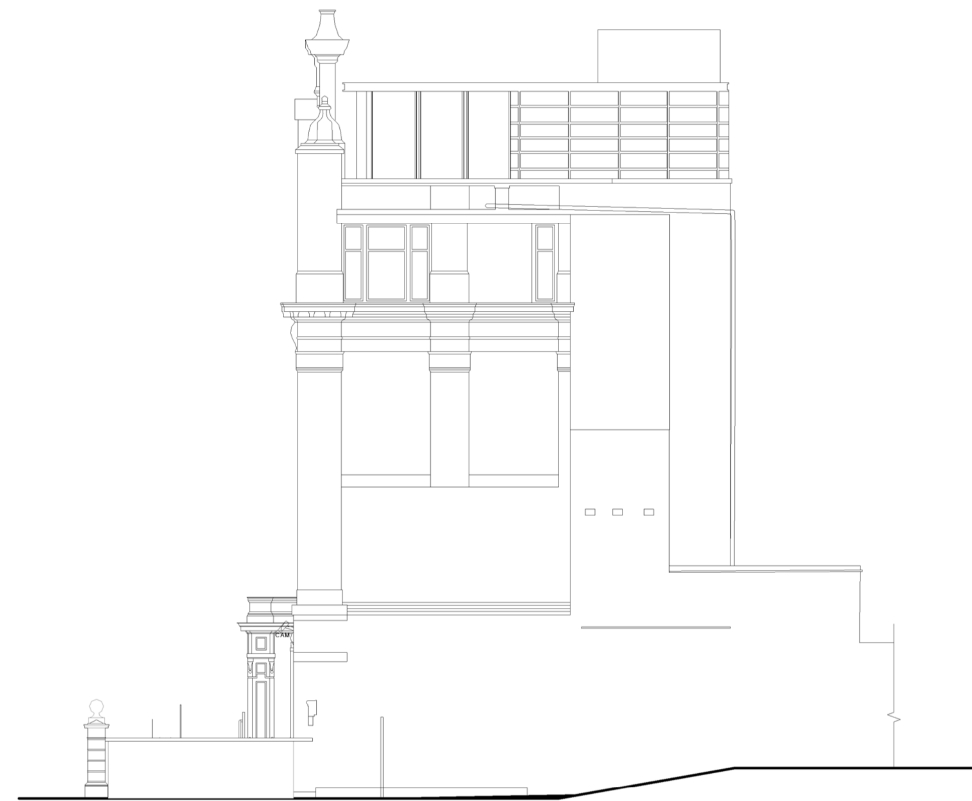
1 Existing North East Elevation 1 : 100

NOTES CONSULTANTS - Refer to highways consultant's drawings for details - Refer to landscape consultant's drawings for details - Landscaping layout is indicative only AREAS - Refer to area schedule © Copyright Reserved. ColladoCollins Partners LLP