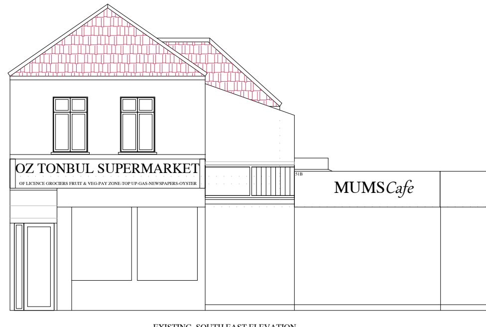
EXISTING SOUTH EAST ELEVATION NO ALTERATION