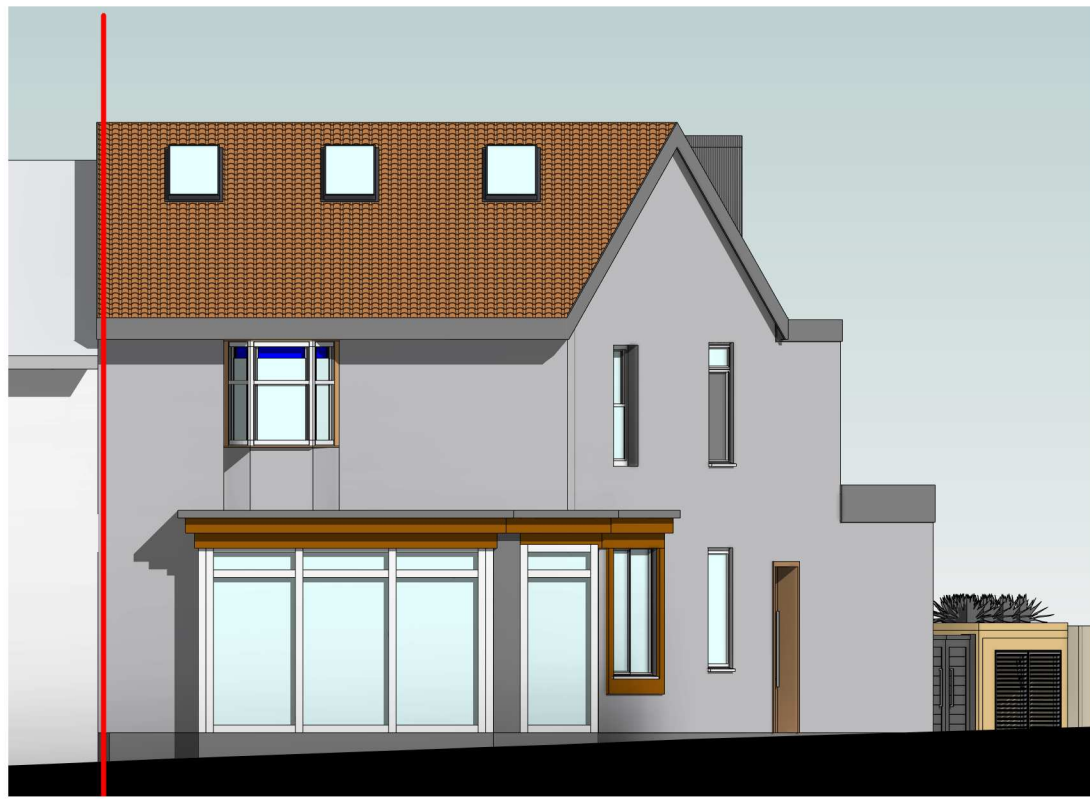
1 | PROPOSED FRONT ELEVATION 1 : 100