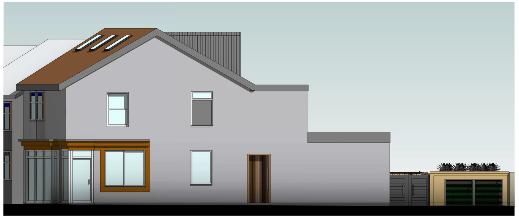
2 | PROPOSED SIDE ELEVATION 1 : 100