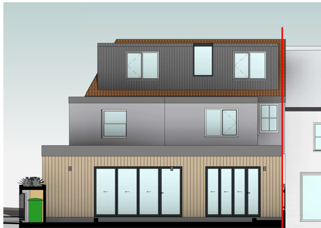
3 | PROPOSED REAR ELEVATION 1 : 100