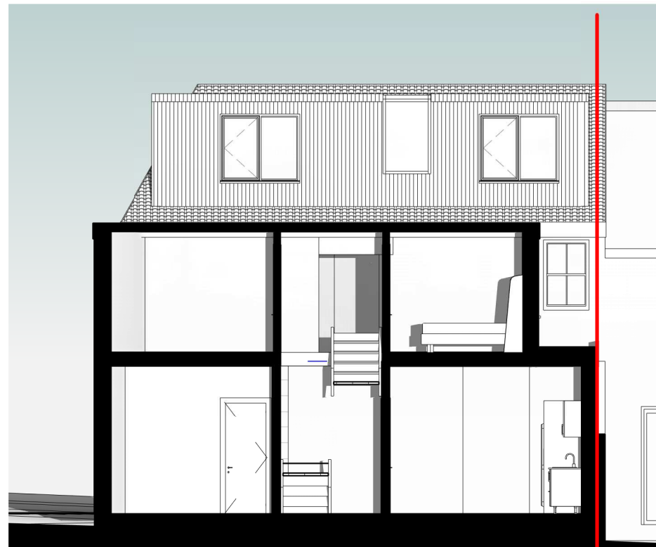
2 | PROPOSED A-A SECTION 1 : 100