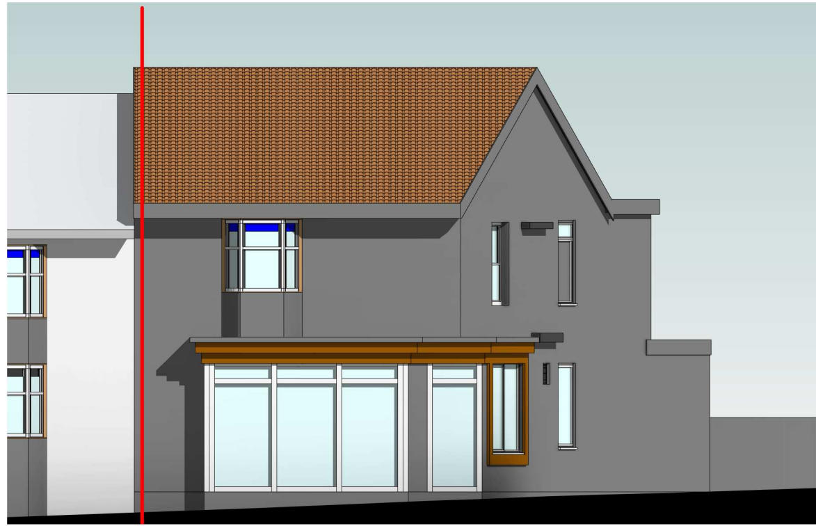
1 | EXISTING FRONT ELEVATION 1 : 100