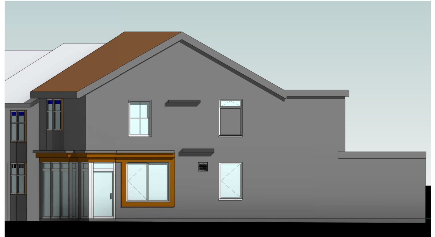
2 | EXISTING SIDE ELEVATION 1 : 100