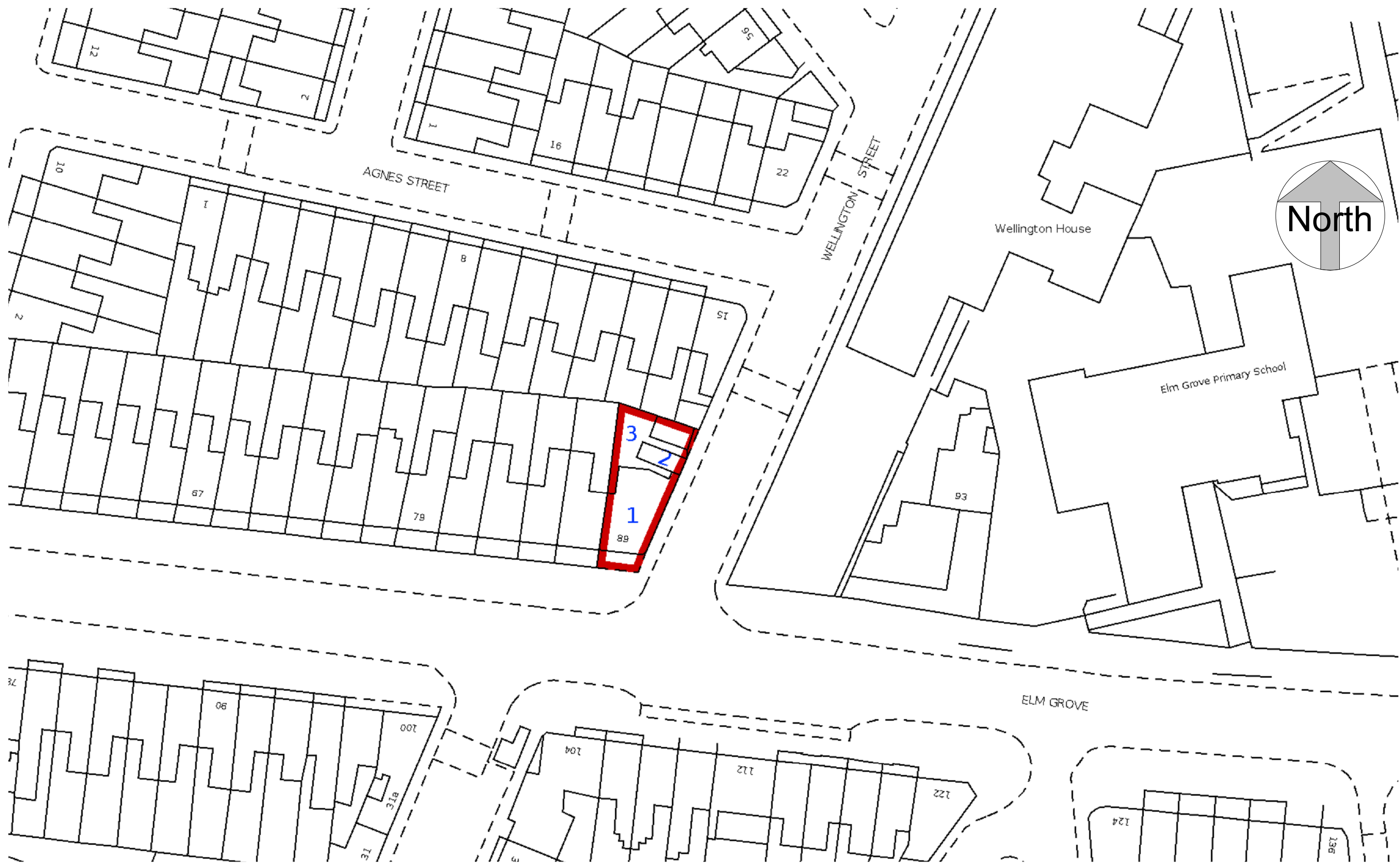
1 BLOCK PLAN 1 : 500

PLEASE NOTE 1. All dimensions to be verified on site. 2. All dimensions are in millimeters. 3. No work shall commence until all approvals and agreements have been obtained. These include, Planning, Building Regulations, Thames Water and party Wall. 4. The Copyright of this drawing belong to Phaaraspa Design Studio Limited.