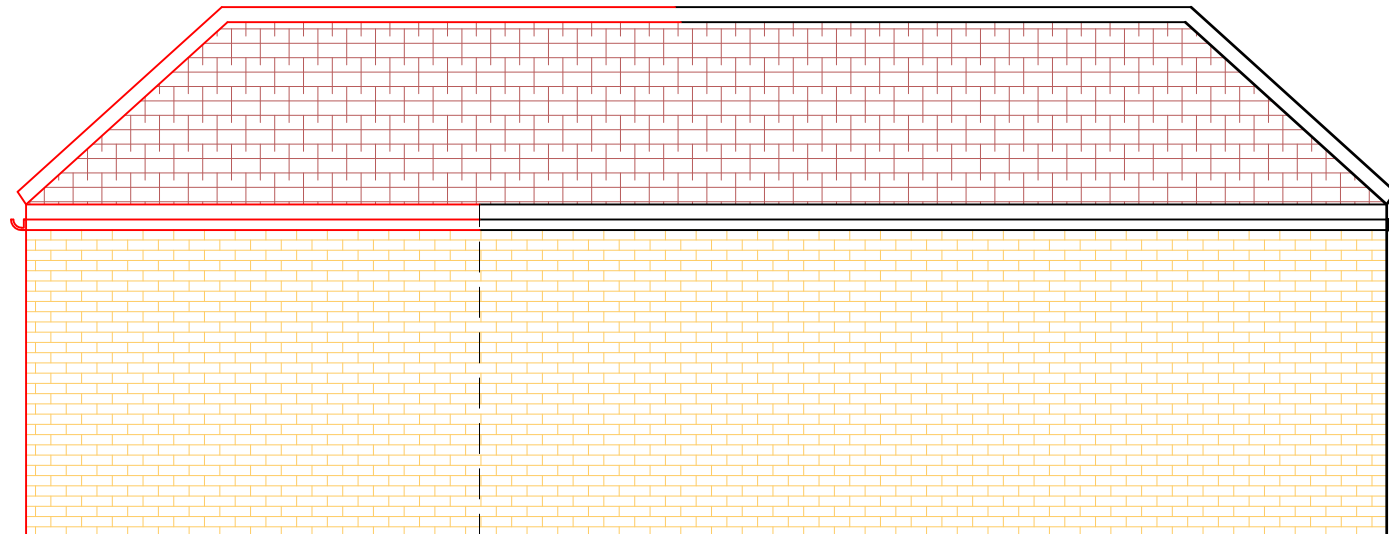
Proposed Side Elevation - B