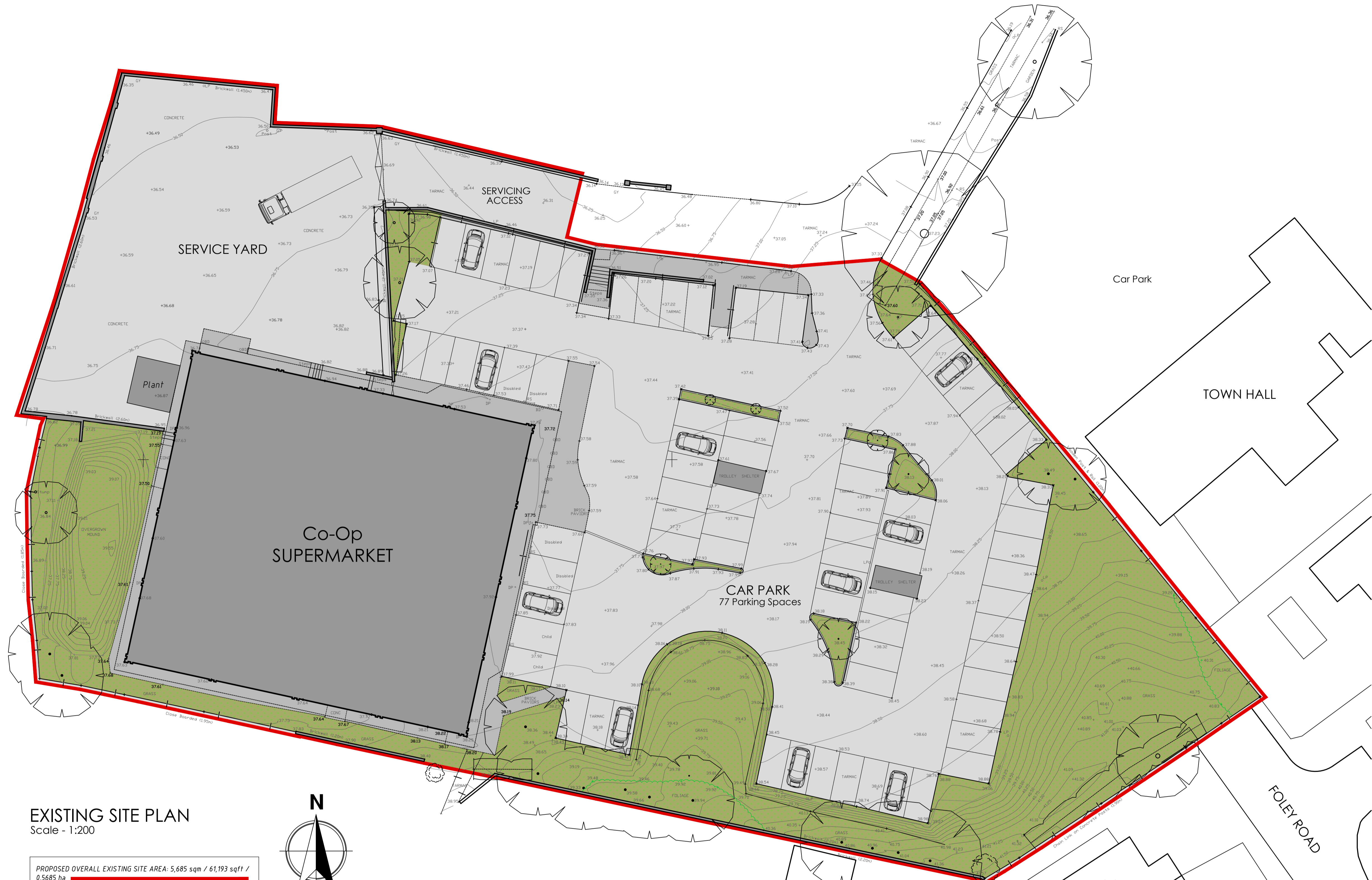
EXISTING SITE PLAN Scale - 1:200

PROPOSED OVERALL EXISTING SITE AREA: 5,685 sqm / 61,193 sqft / 0.5685 ha