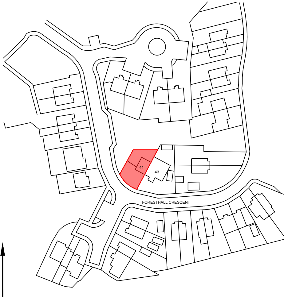
1 SITE LOCATION PLAN SCALE 1:1250 @ A4