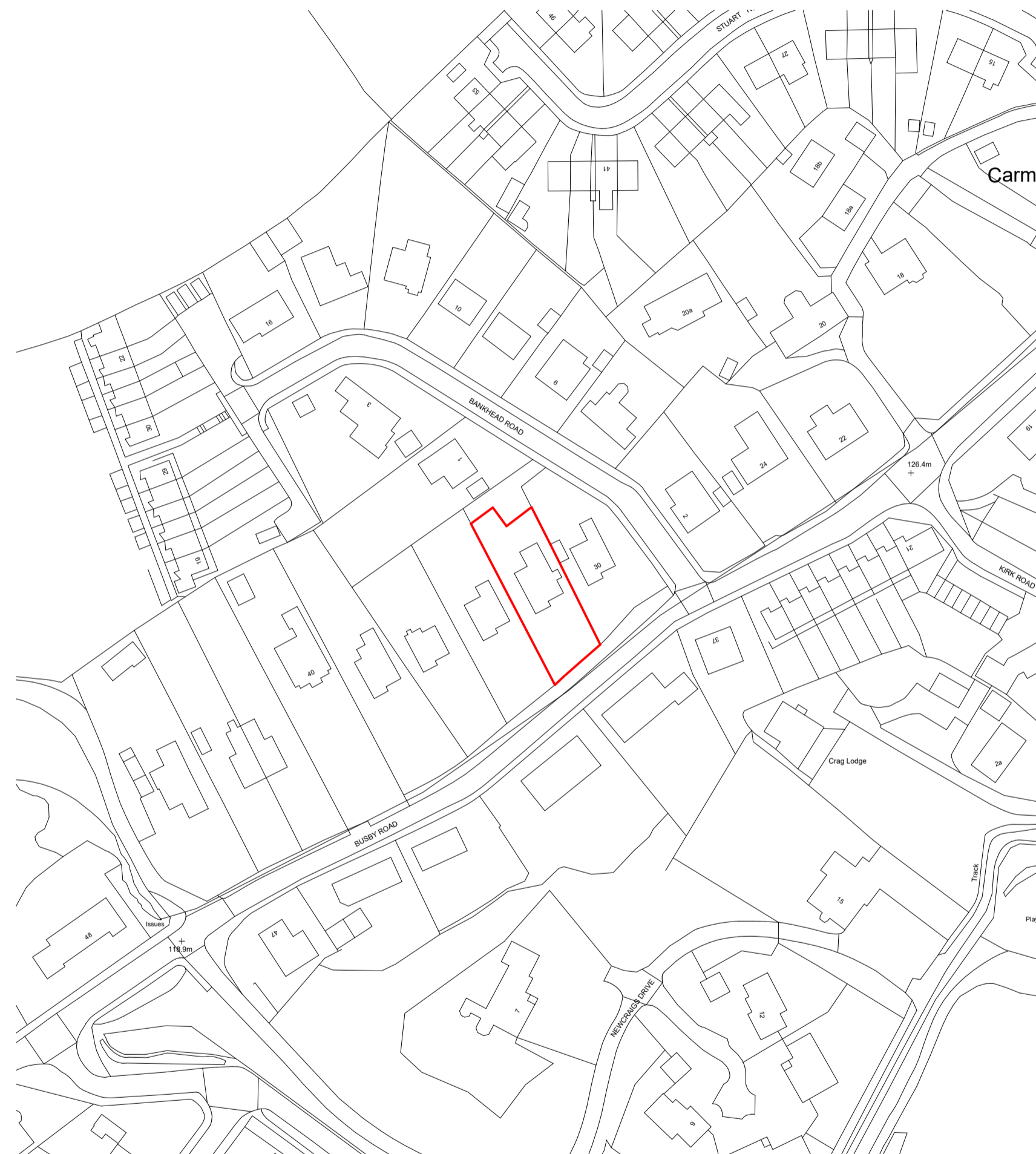
2 SITE PLAN - AS EXISTING 1:1250