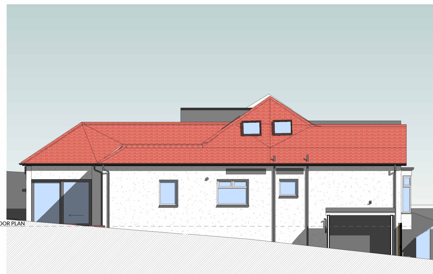
D ELEVATION D - AS EXISTING 1:100