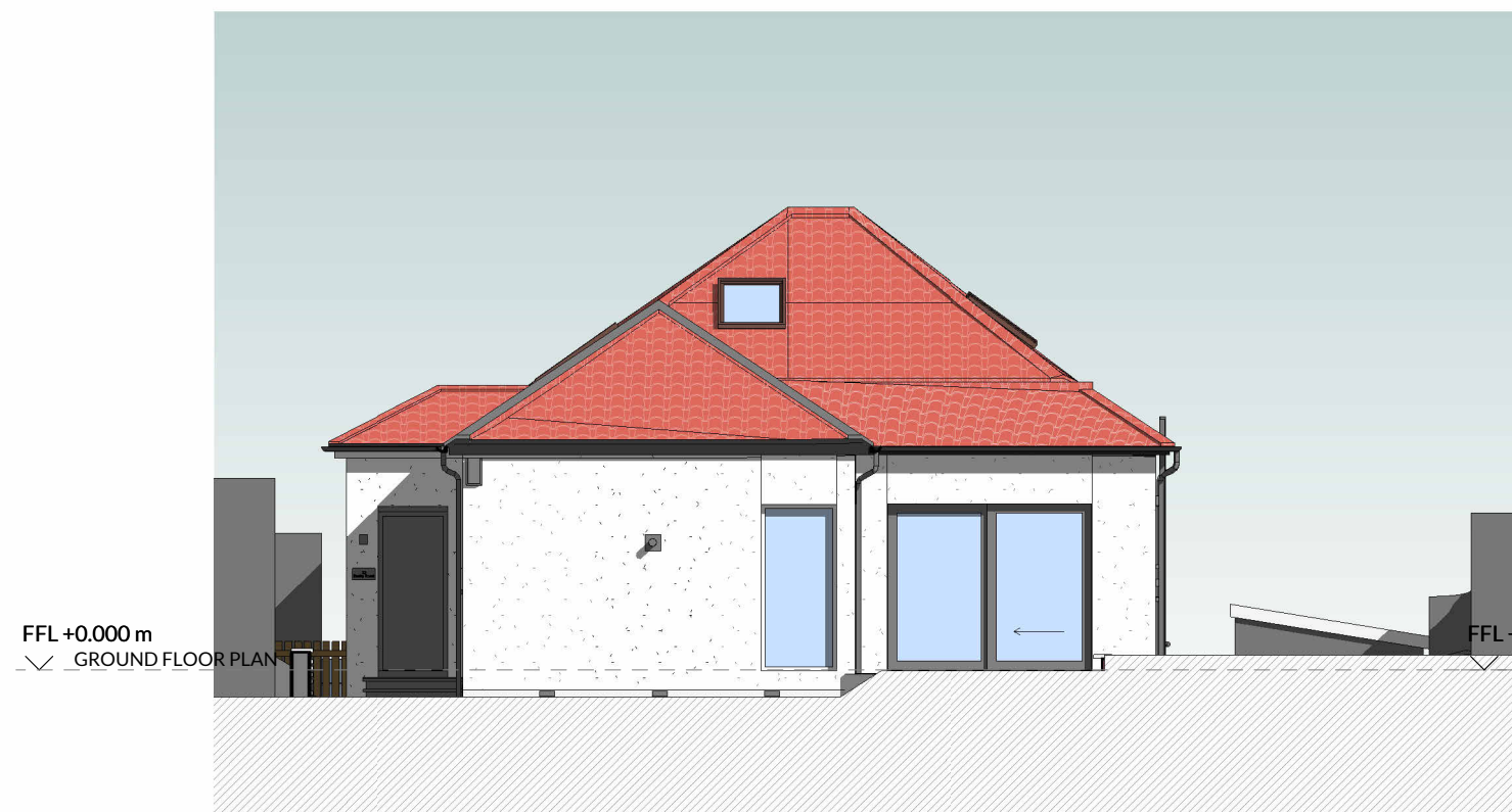
A ELEVATION A - AS EXISTING 1:100