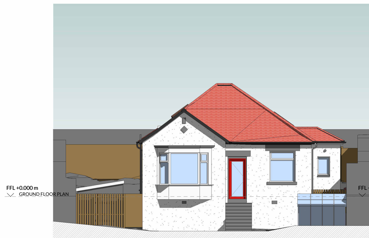
C ELEVATION C - AS EXISTING 1:100