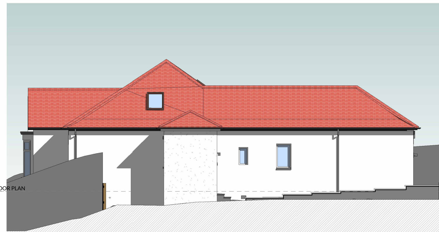
B ELEVATION B - AS EXISTING 1:100