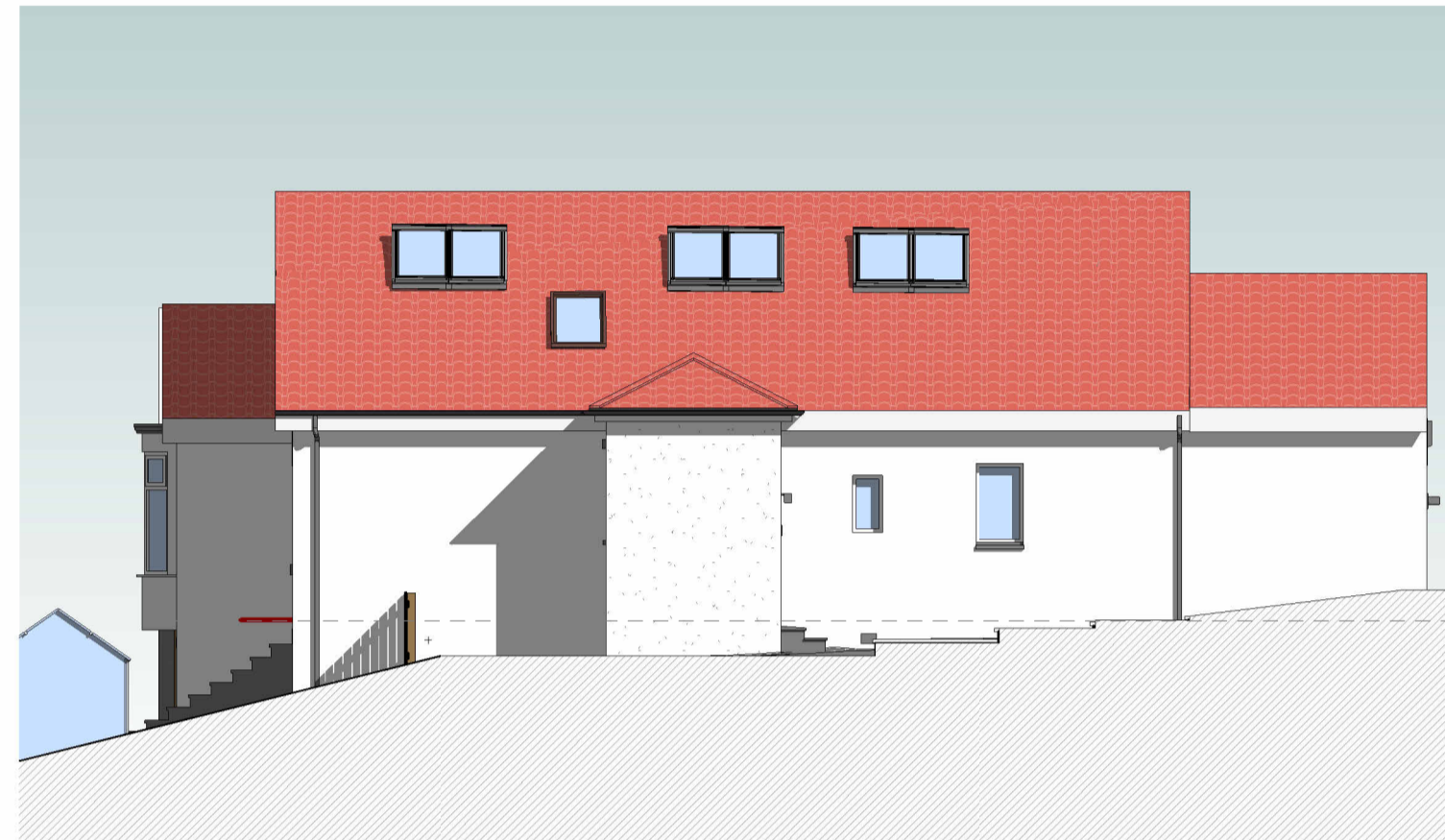
B ELEVATION B 1:100