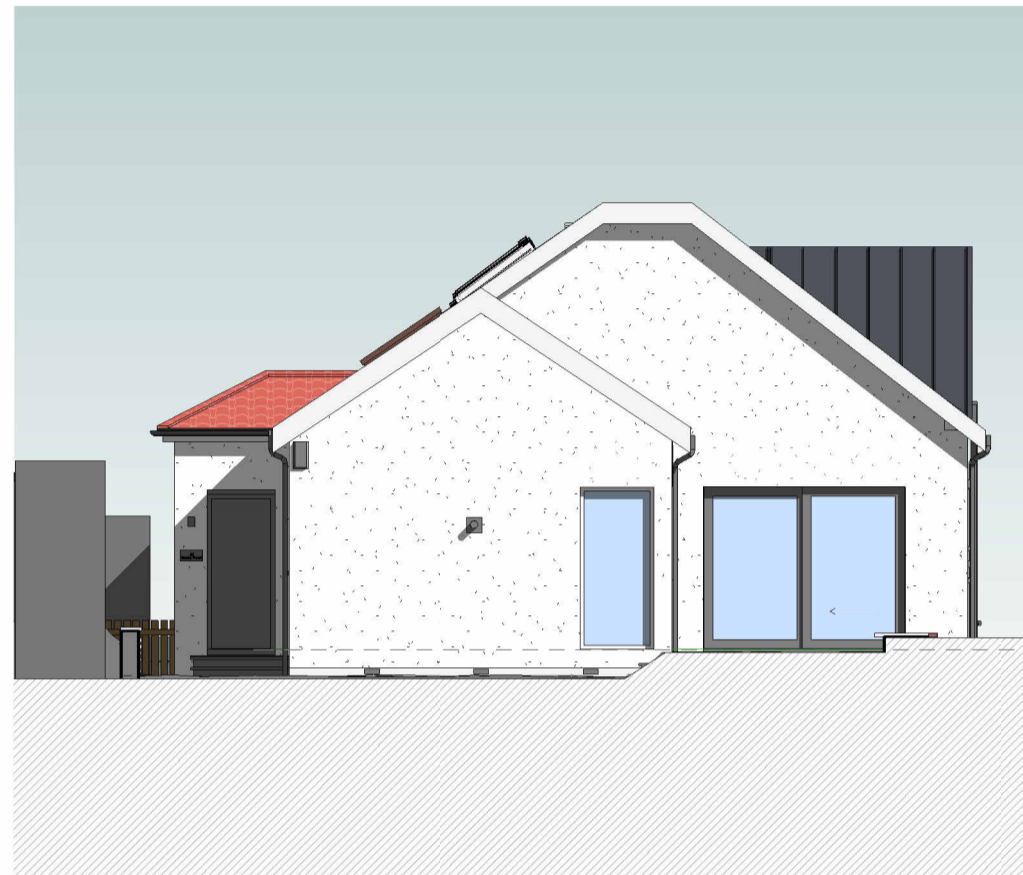
A ELEVATION A 1:100