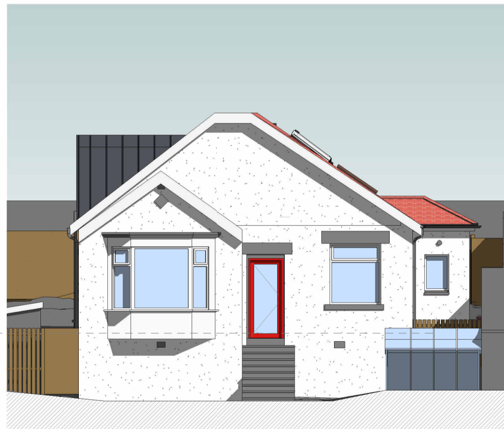
C ELEVATION C 1:100