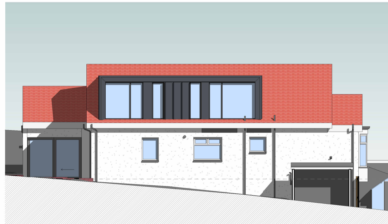
D ELEVATION D 1:100