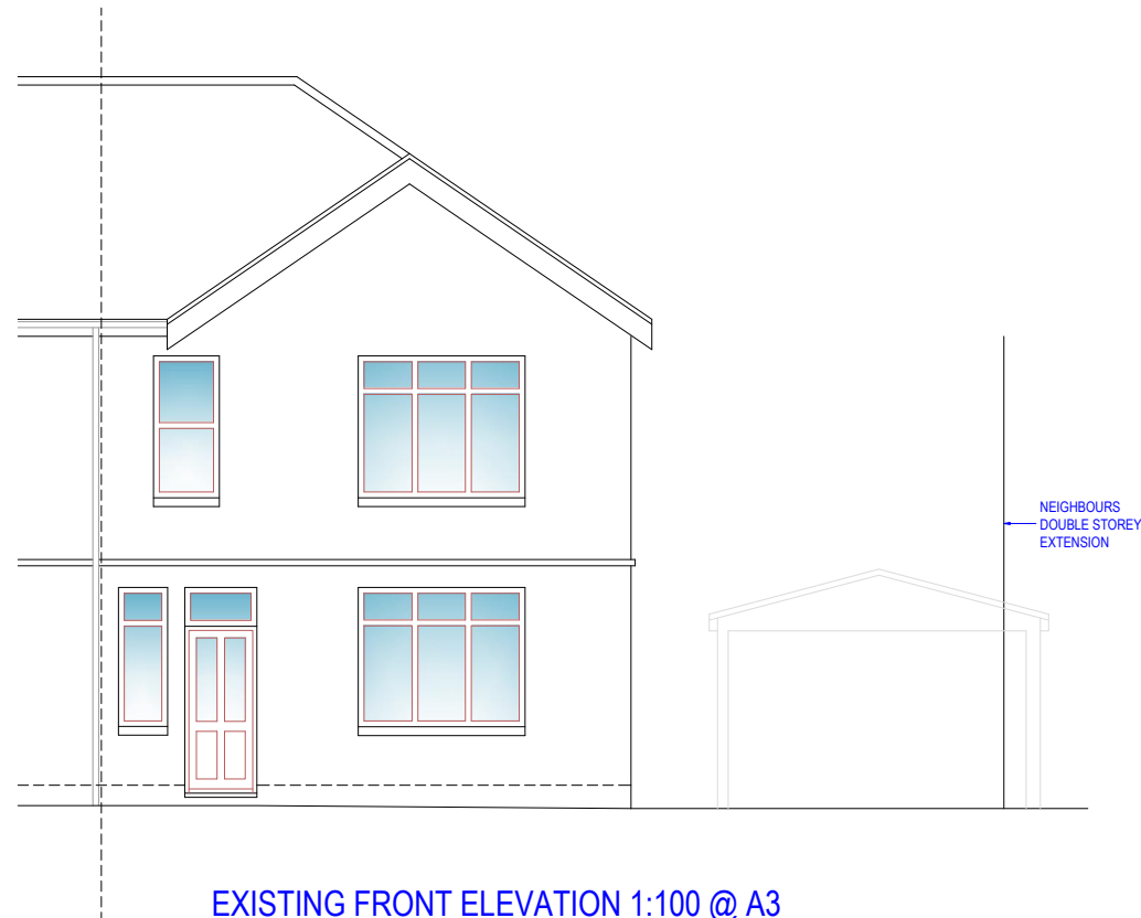
EXISTING FRONT ELEVATION 1:100 @ A3