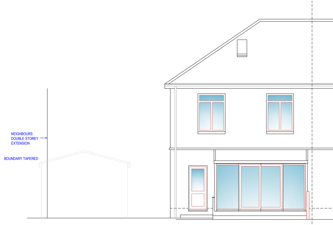
EXISTING REAR ELEVATION 1:100 @ A3