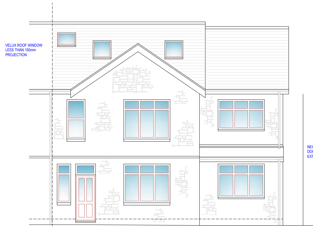
PROPOSED FRONT ELEVATION 1:100 @ A3