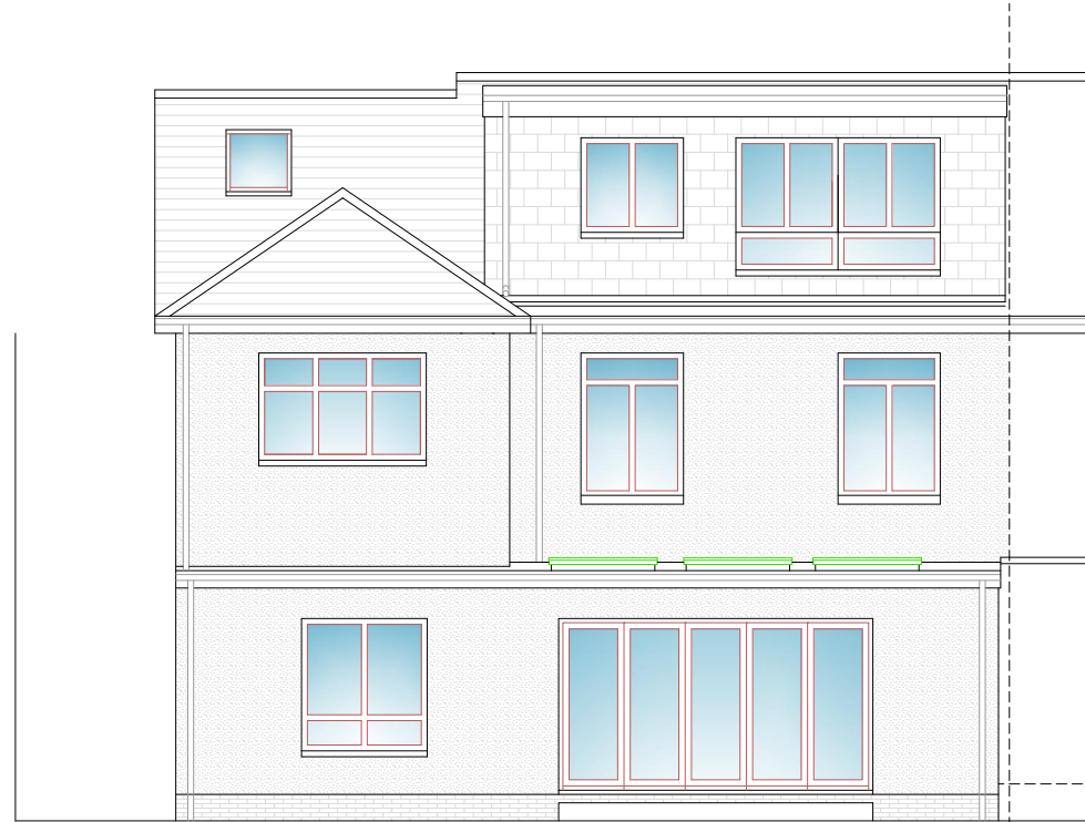
PROPOSED REAR ELEVATION 1:100 @ A3