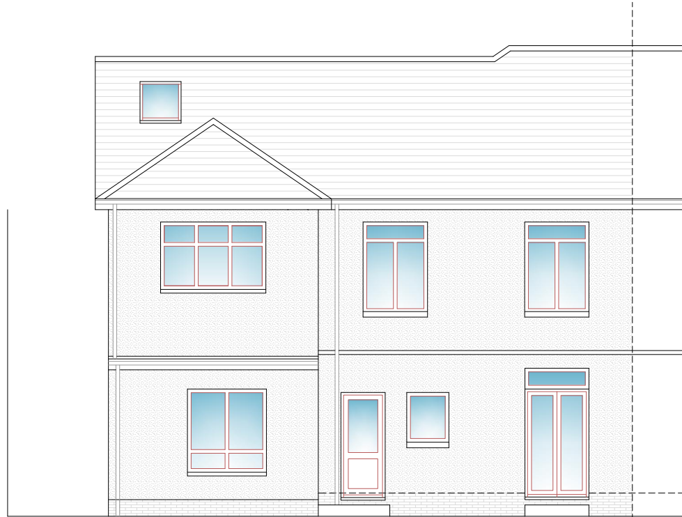
PROPOSED REAR ELEVATION 1:100 @ A3