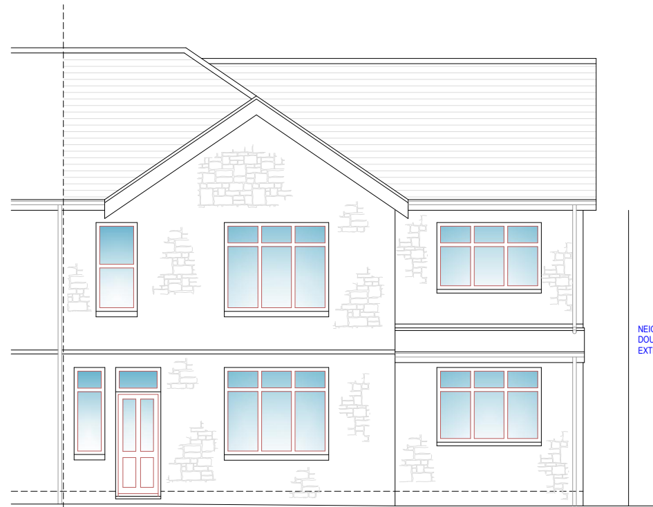
PROPOSED FRONT ELEVATION 1:100 @ A3