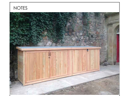
Figure A. Image illustrating that individual storage units can be connected together using a panel. All storages Manufactured by the BikeShedCo.

The BikeShedCompany Bike store 2000 x 1000 x 1335 mm for shared use, suitable for storing 3 adult bikes.