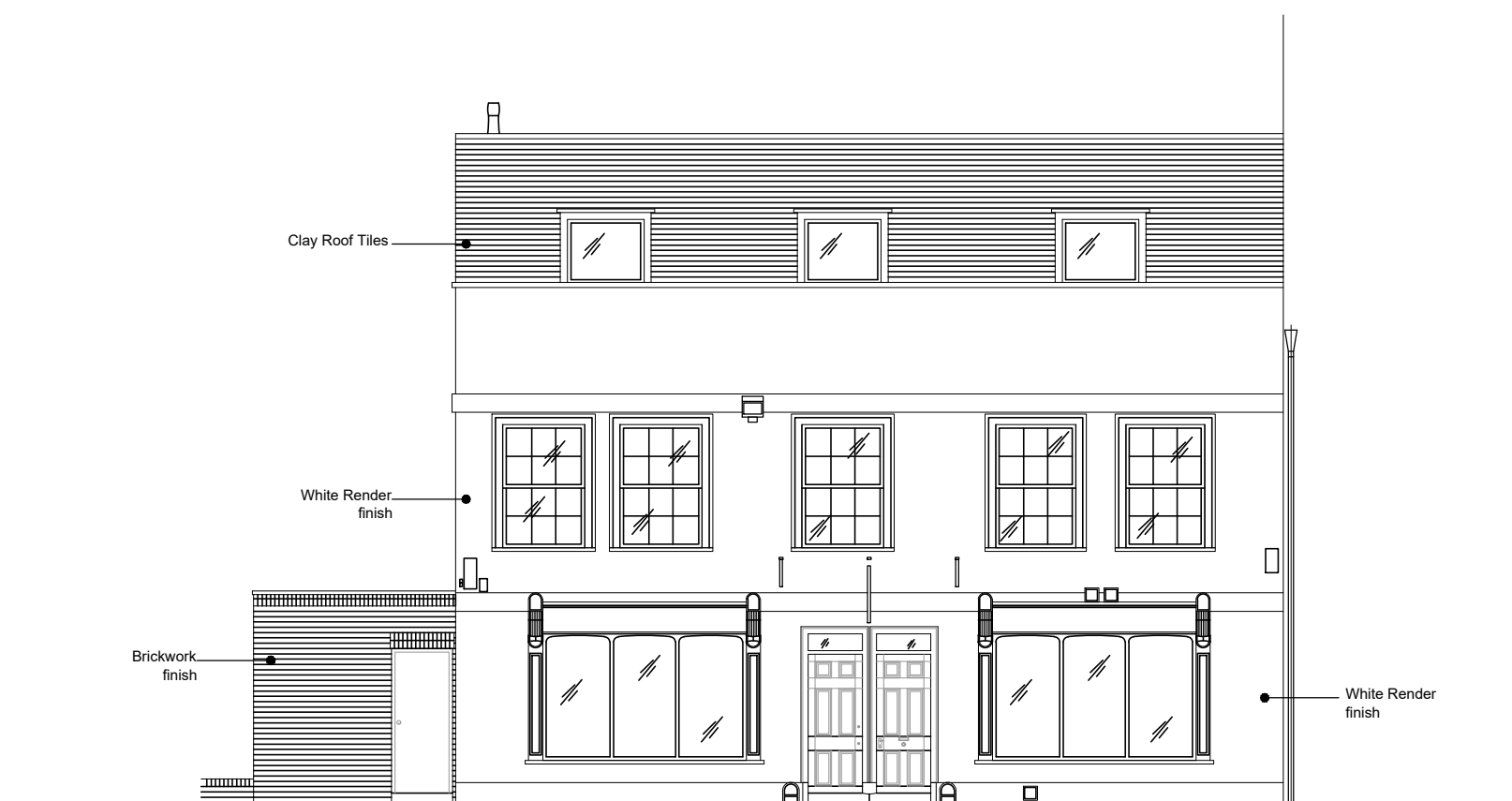
FRONT ELEVATION (EAST ELEVATION)