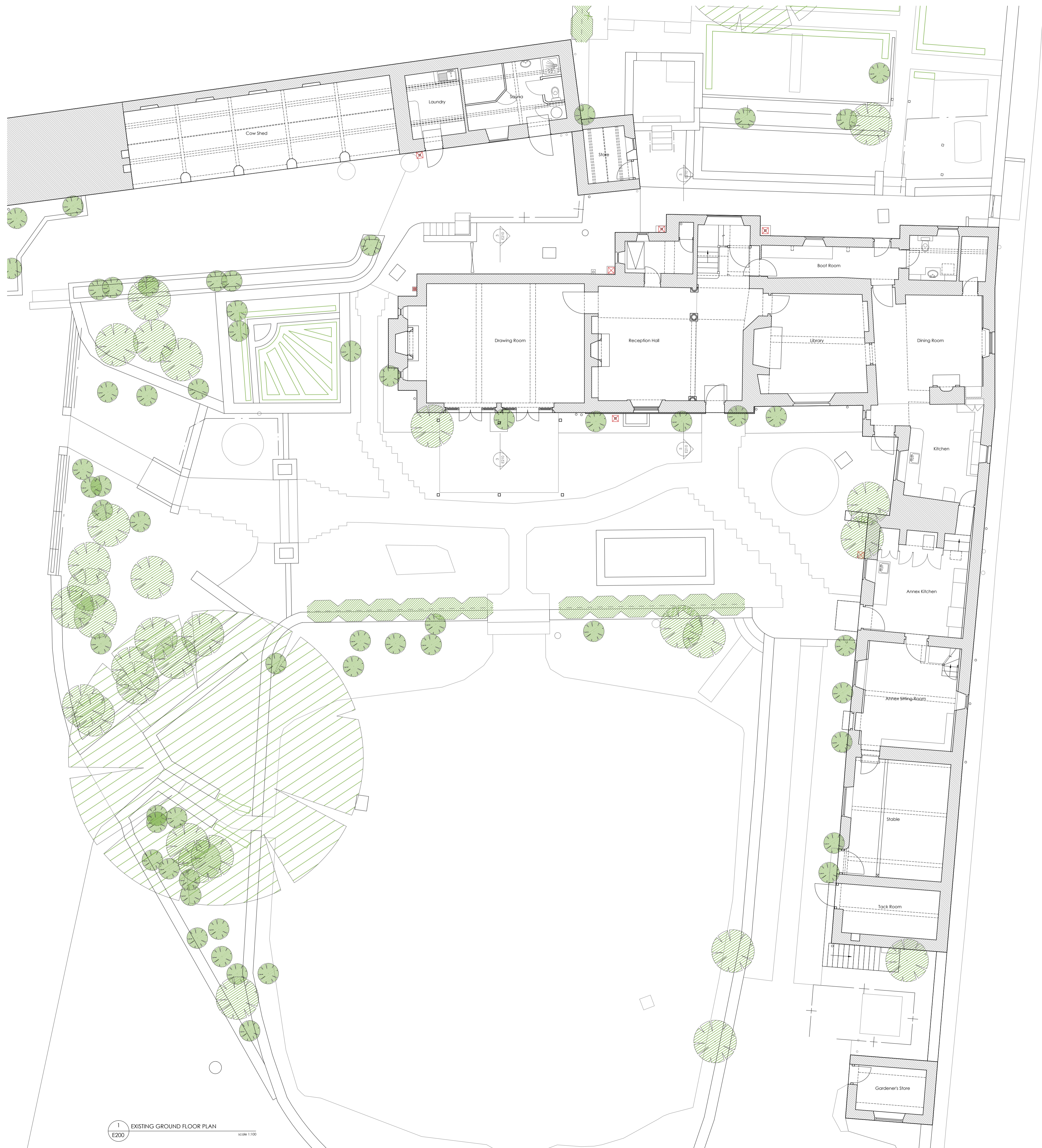
1 EXISTING GROUND FLOOR PLAN E200 scale 1:100