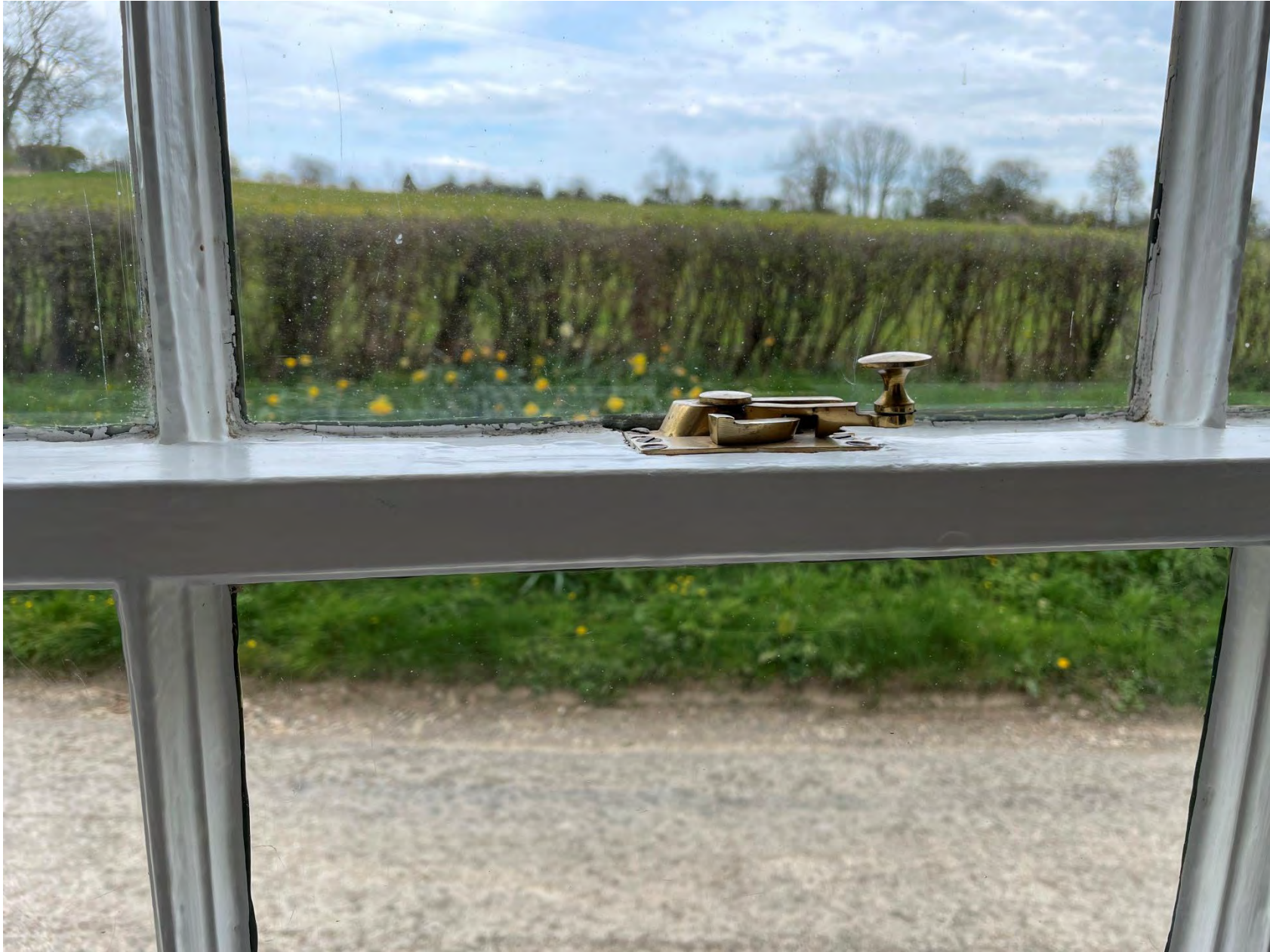
P22-0597 | JT | September 2023