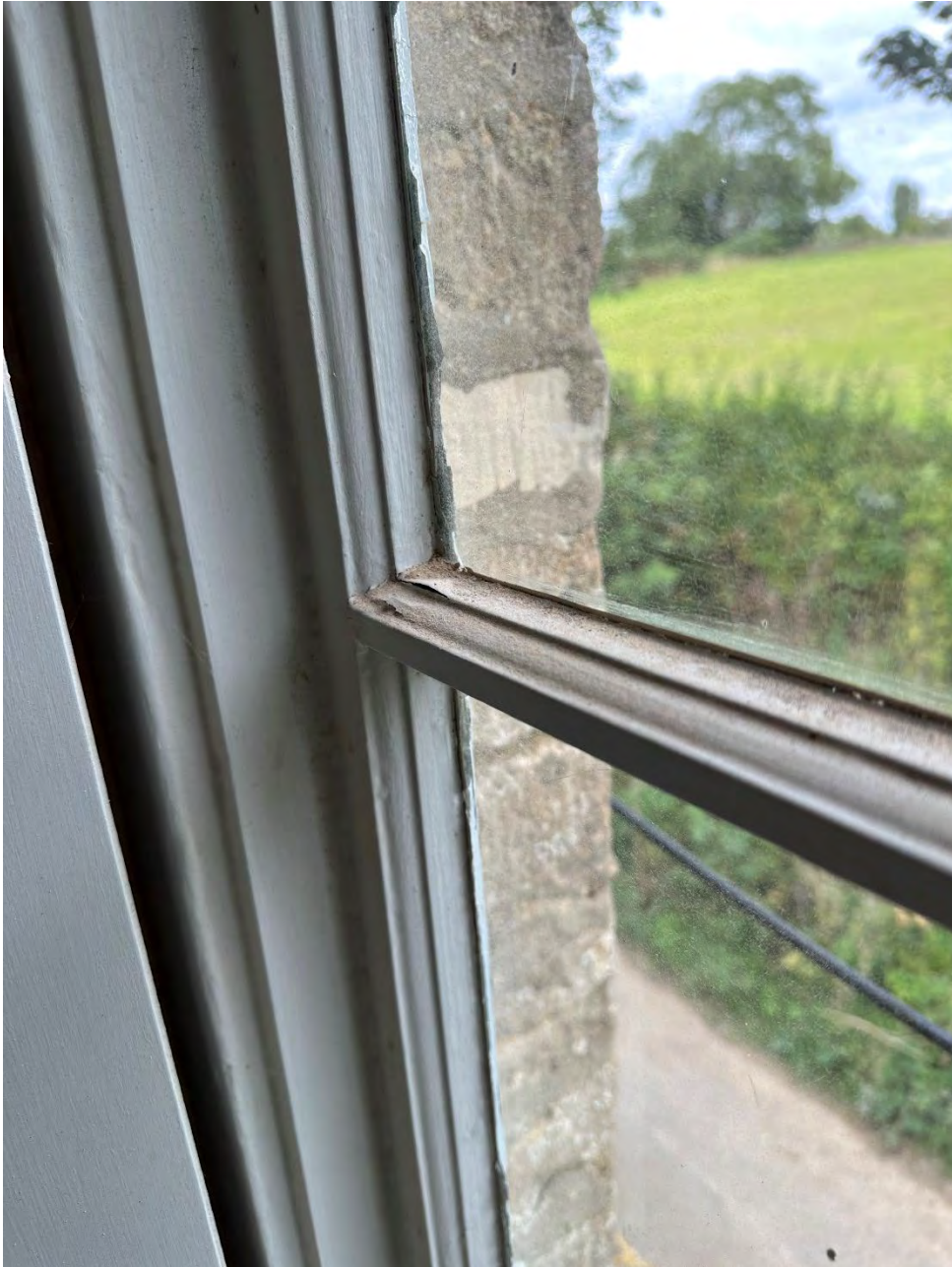
P22-0597 | JT | September 2023