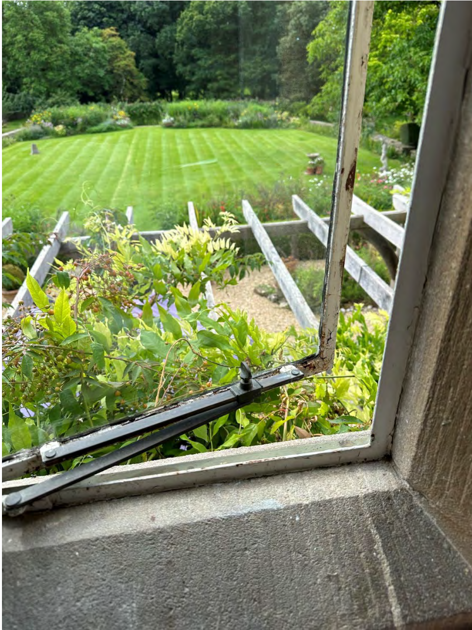
P22-0597 | JT | September 2023