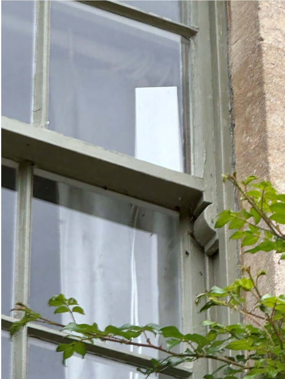
P22-0597 | JT | September 2023