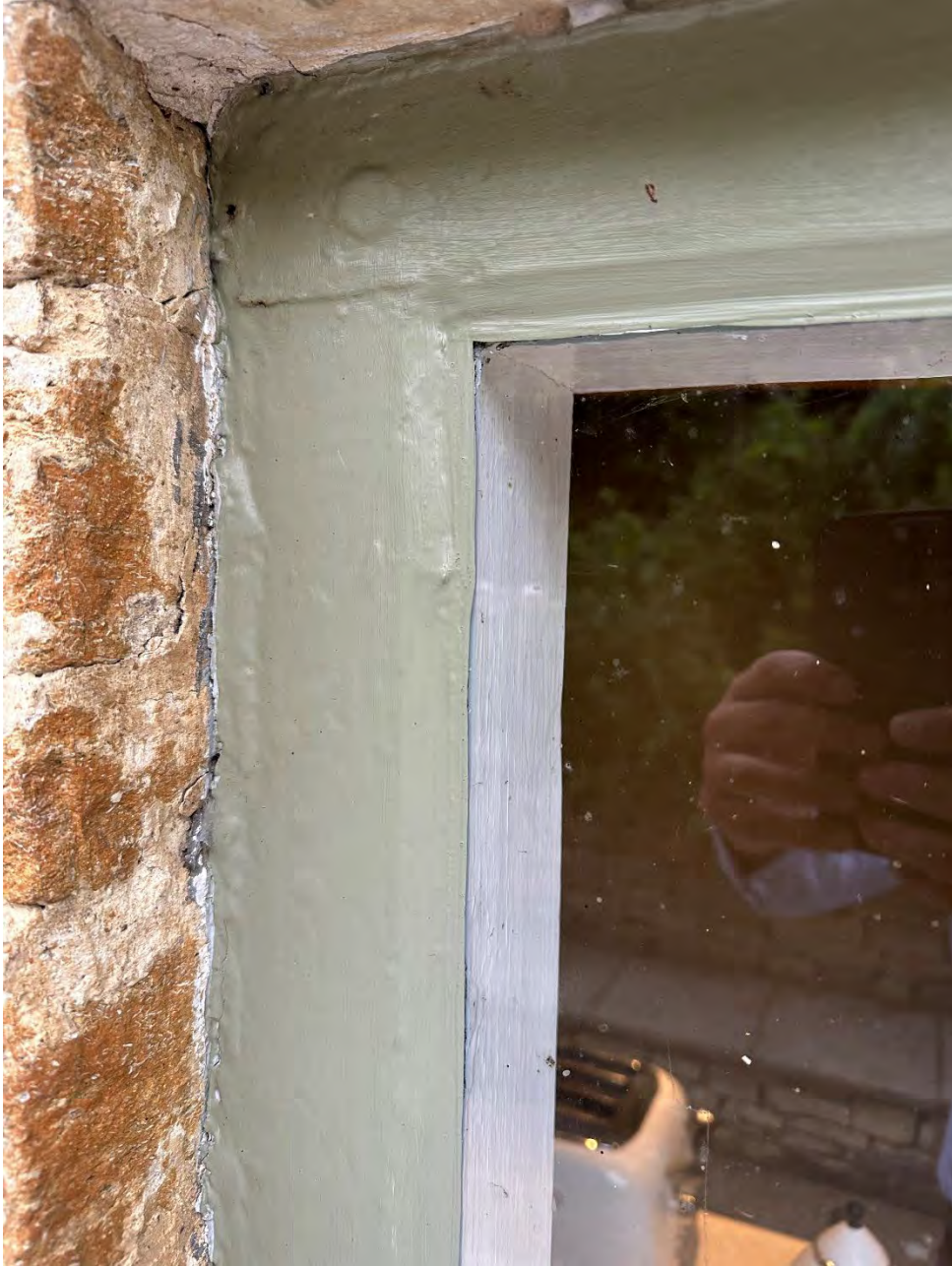
P22-0597 | JT | September 2023