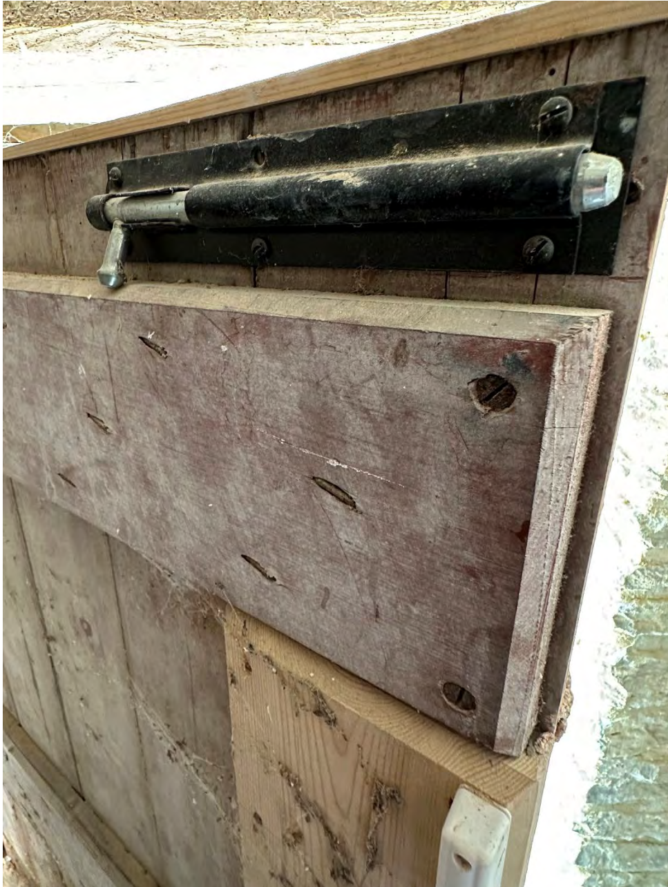
P22-0597 | JT | September 2023