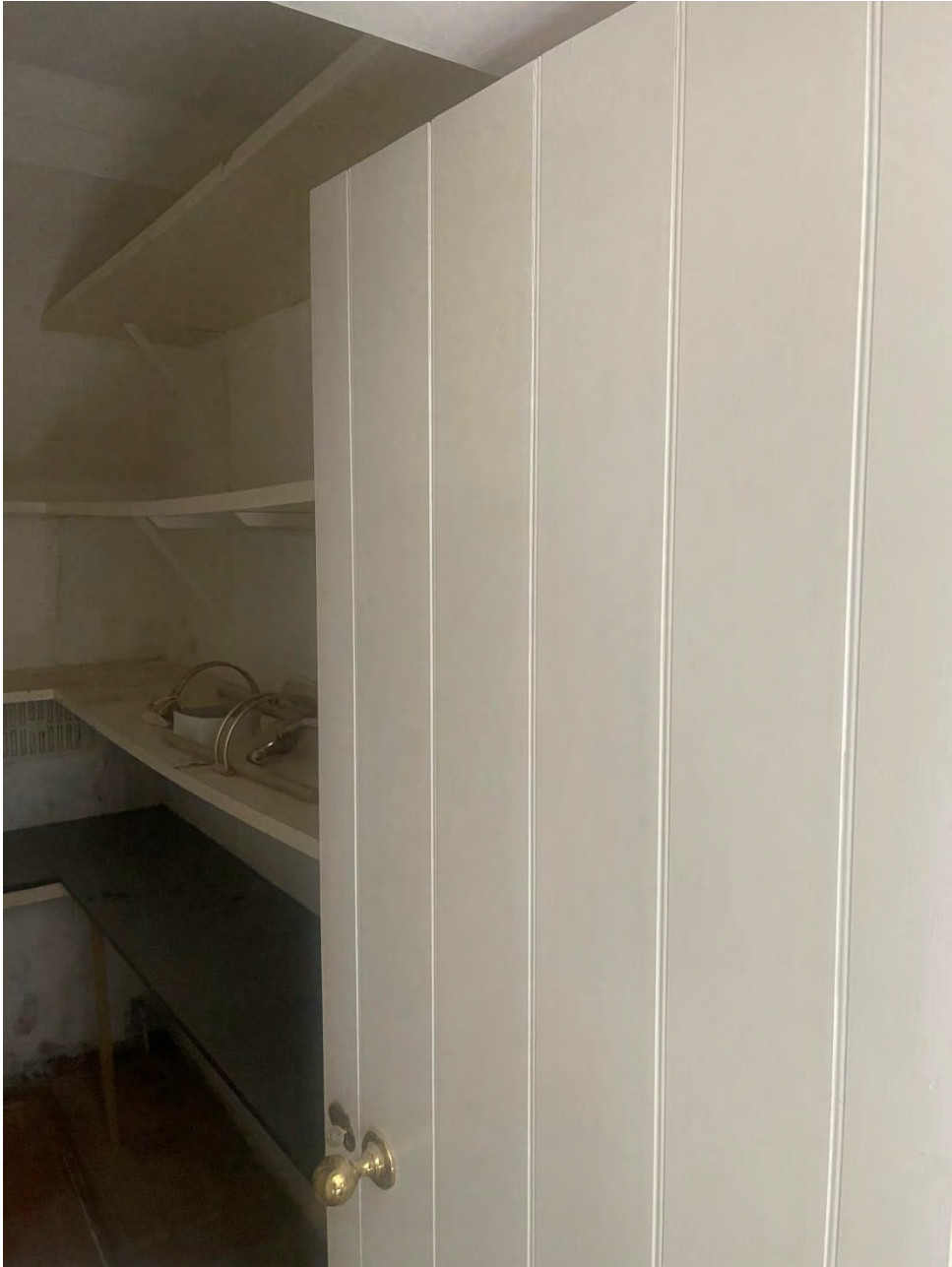
P22-0597 | JT | September 2023