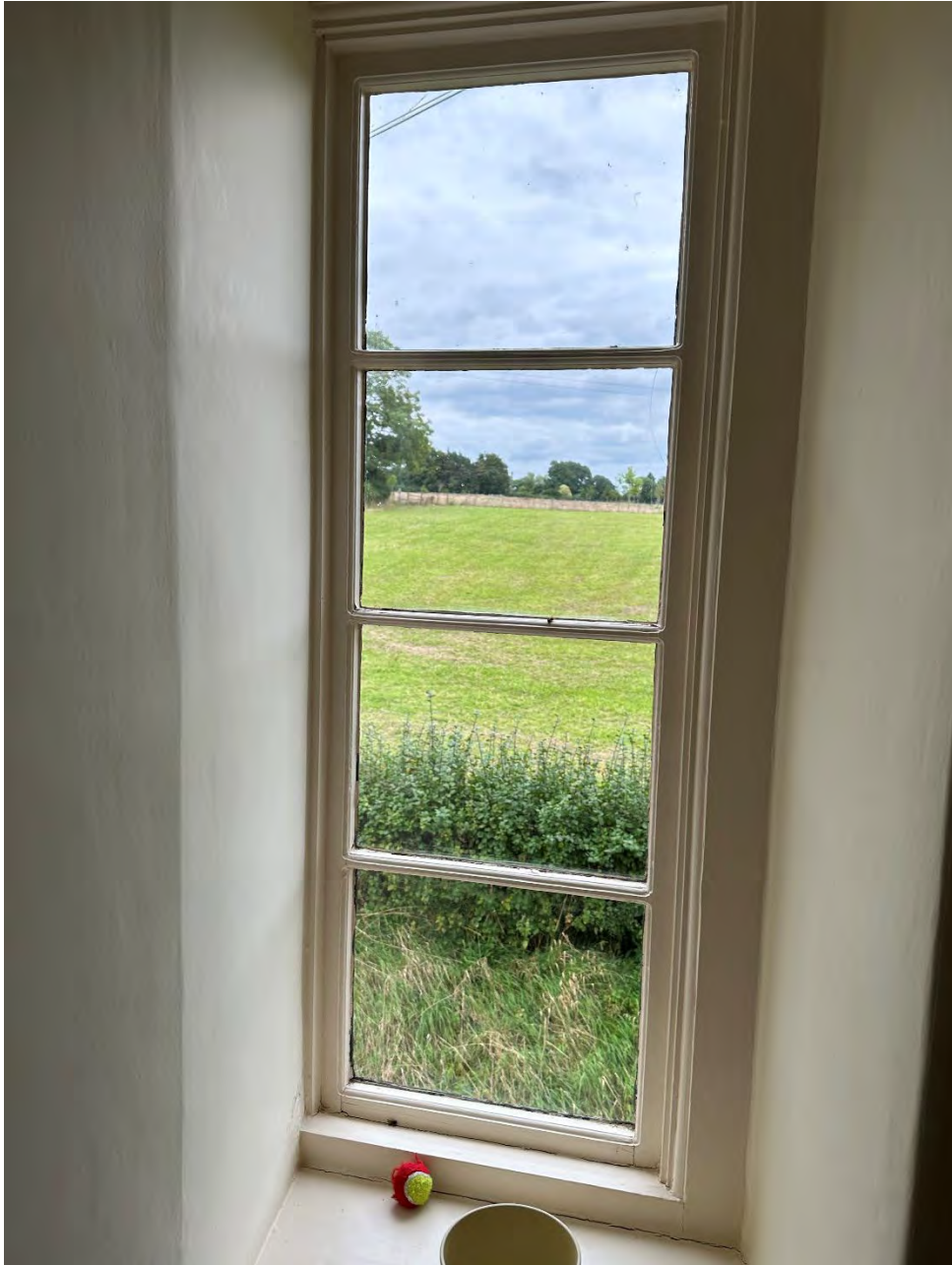
P22-0597 | JT | September 2023