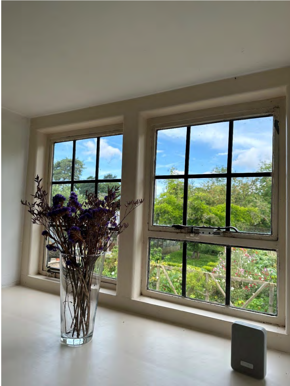
P22-0597 | JT | September 2023