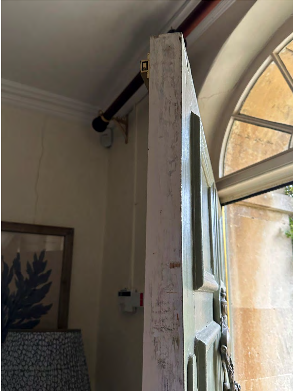
P22-0597 | JT | September 2023