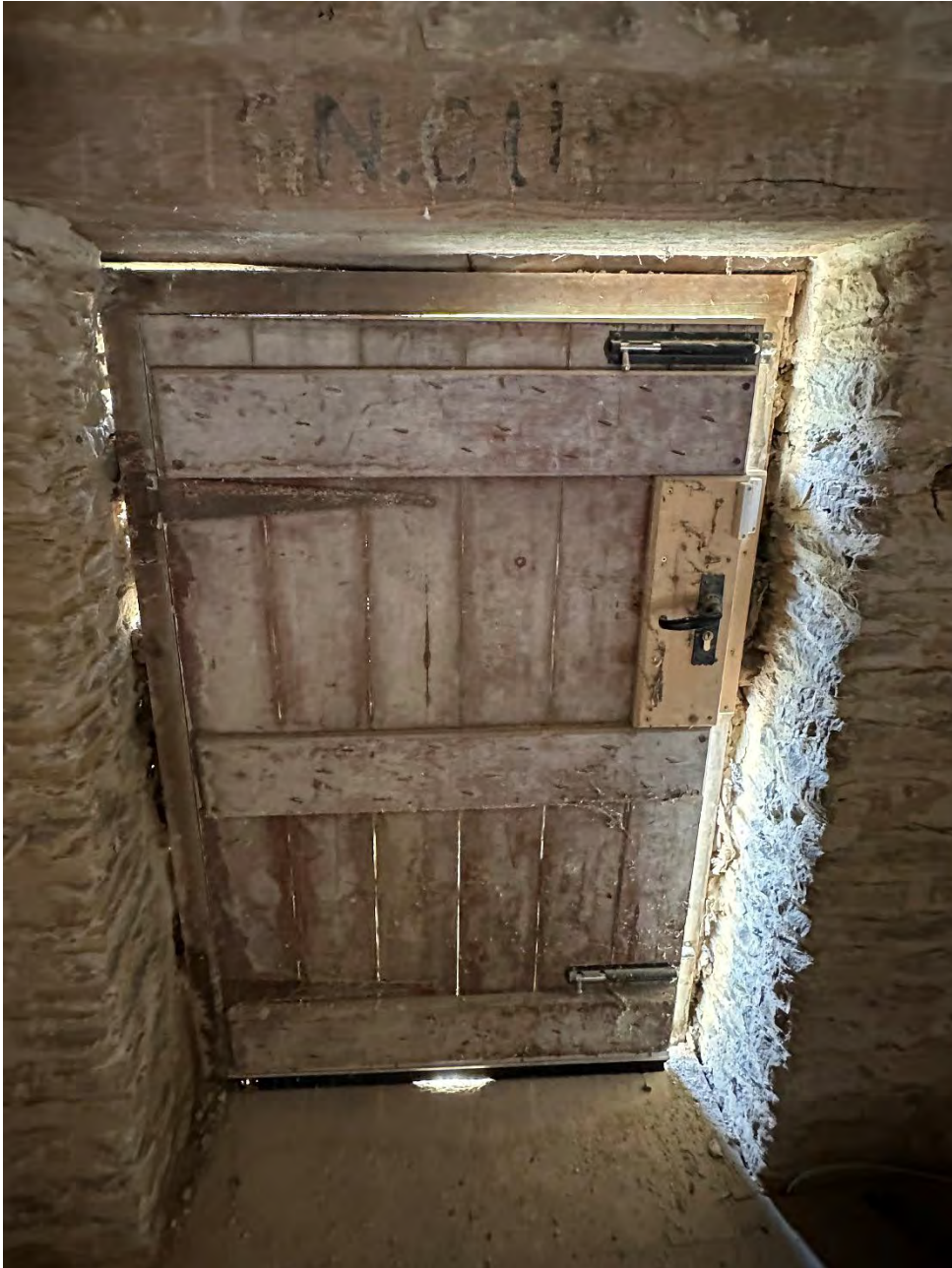
P22-0597 | JT | September 2023