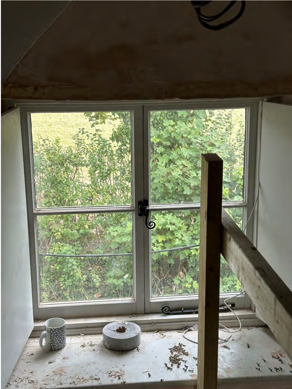
P22-0597 | JT | September 2023