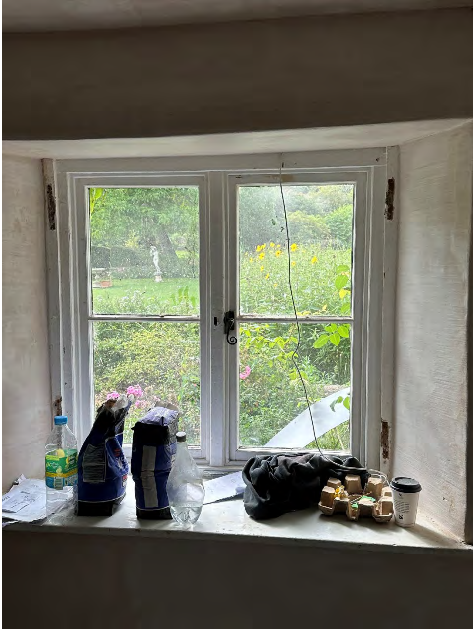
P22-0597 | JT | September 2023