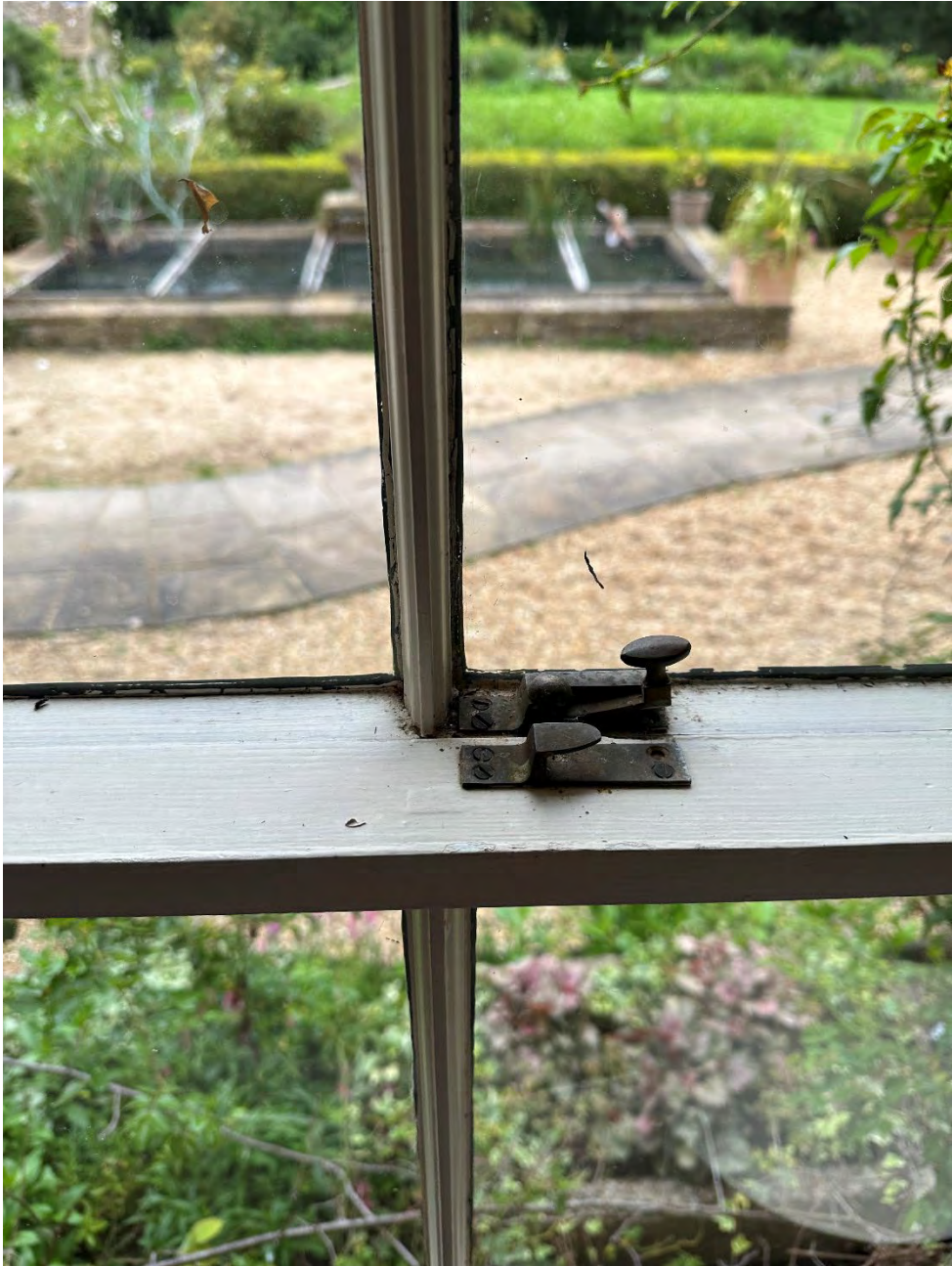
P22-0597 | JT | September 2023