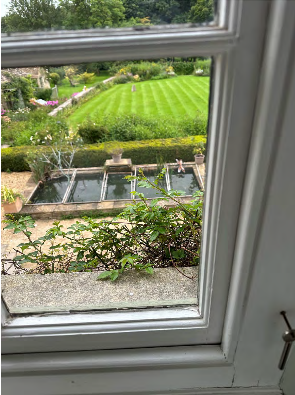
P22-0597 | JT | September 2023