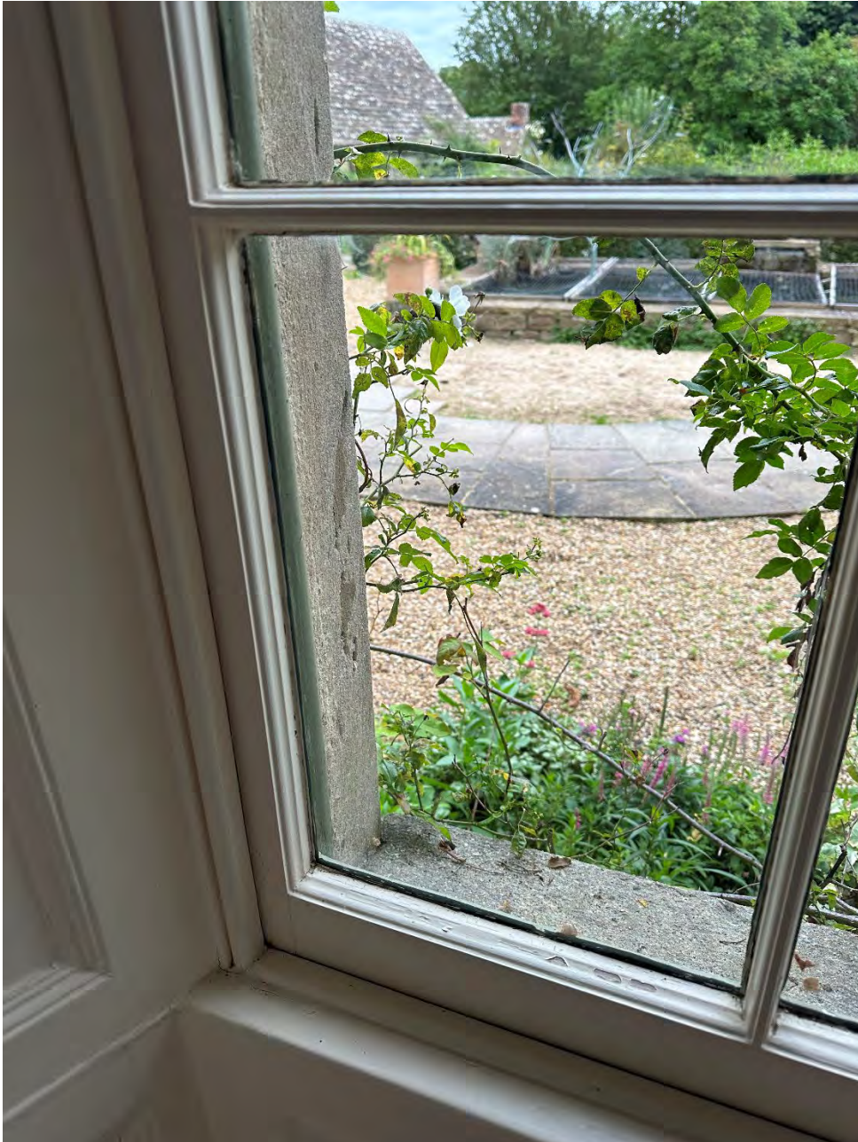
P22-0597 | JT | September 2023