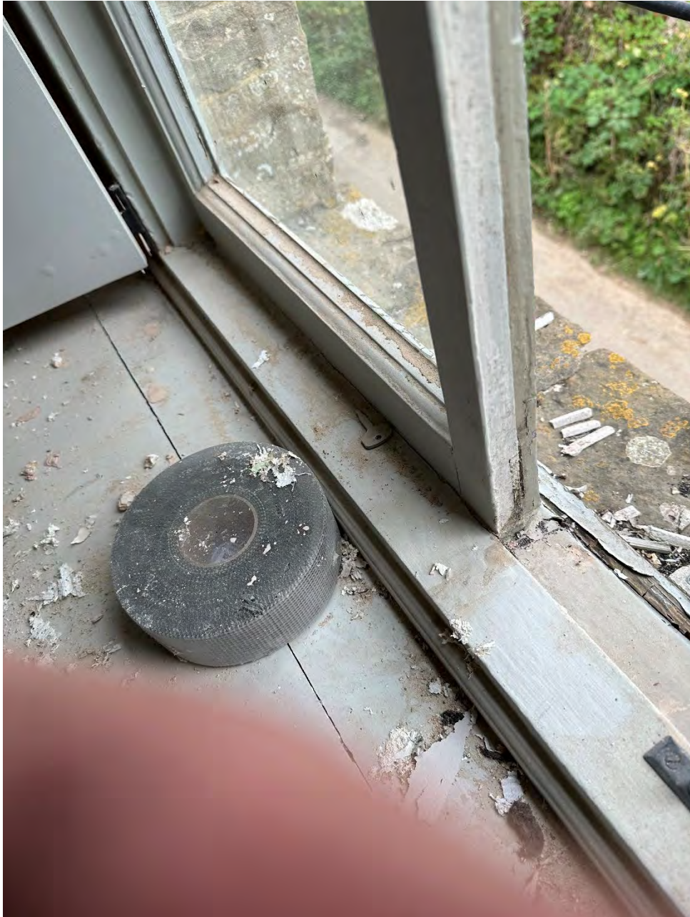
P22-0597 | JT | September 2023