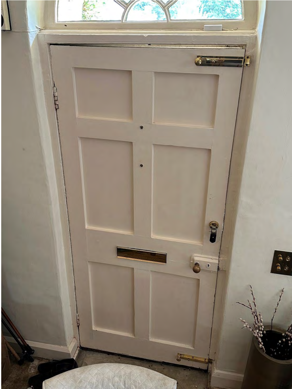
P22-0597 | JT | September 2023