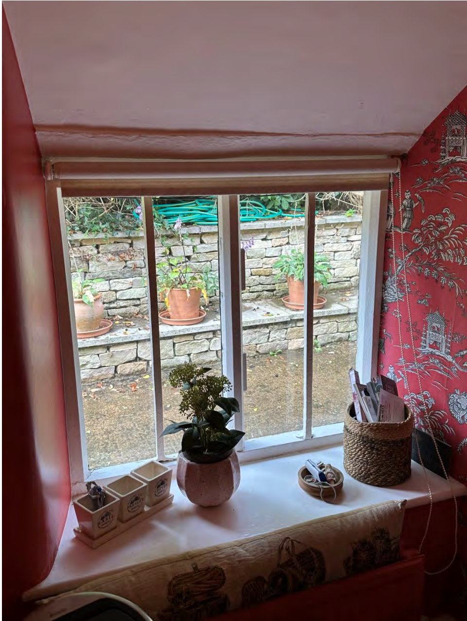
P22-0597 | JT | September 2023