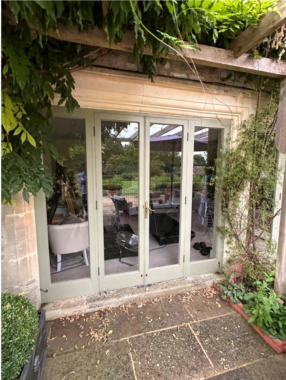
P22-0597 | JT | September 2023