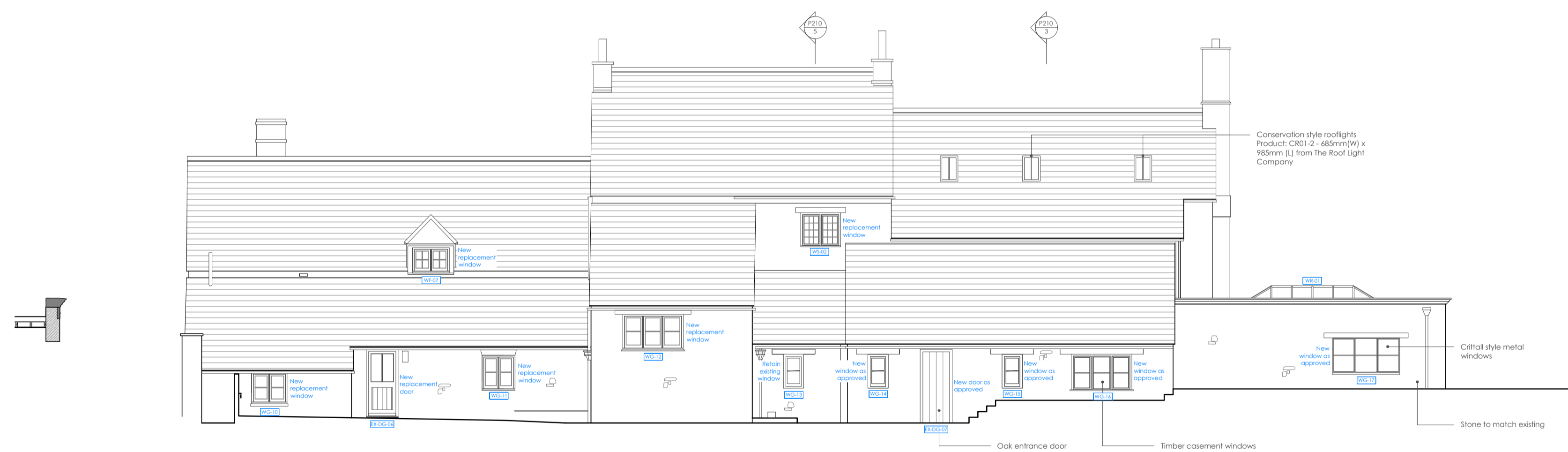
2 PROPOSED NORTH ELEVATION P211 scale 1:100