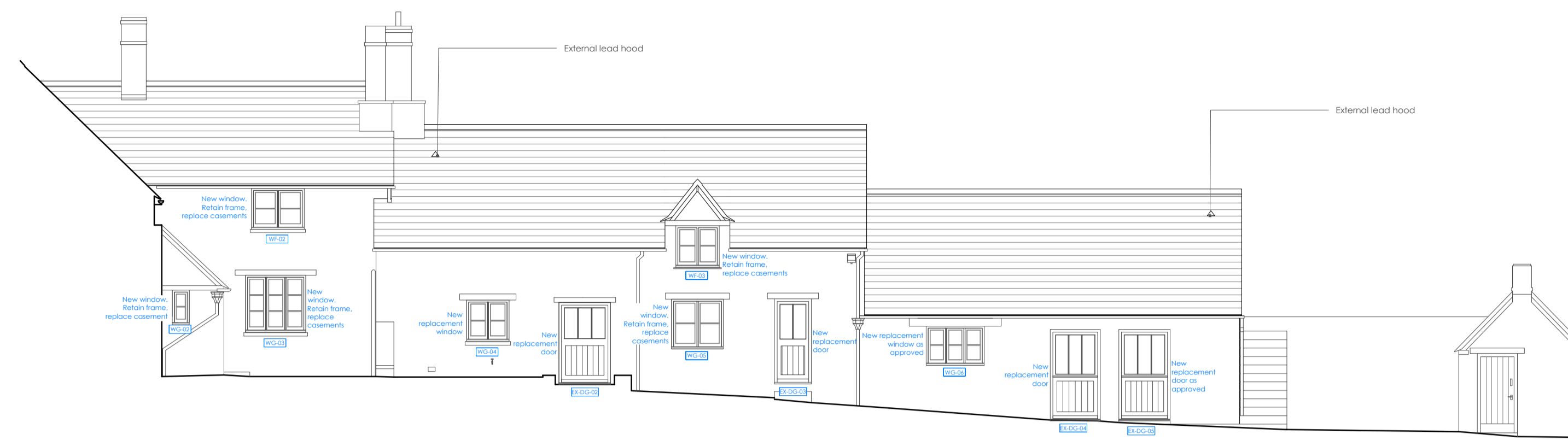
3 PROPOSED WEST ELEVATION P211 scale 1:100

PLEASE NOTE THE INFORMATION IS BASED UPON THE INDEPENDANT SURVEY INFORMATION PROVIDED. THE CONTRACTOR IS TO REPORT ANY DISCREPANCIES BETWEEN THE DRAWINGS AND THE SITE CONFIGURATIONS.