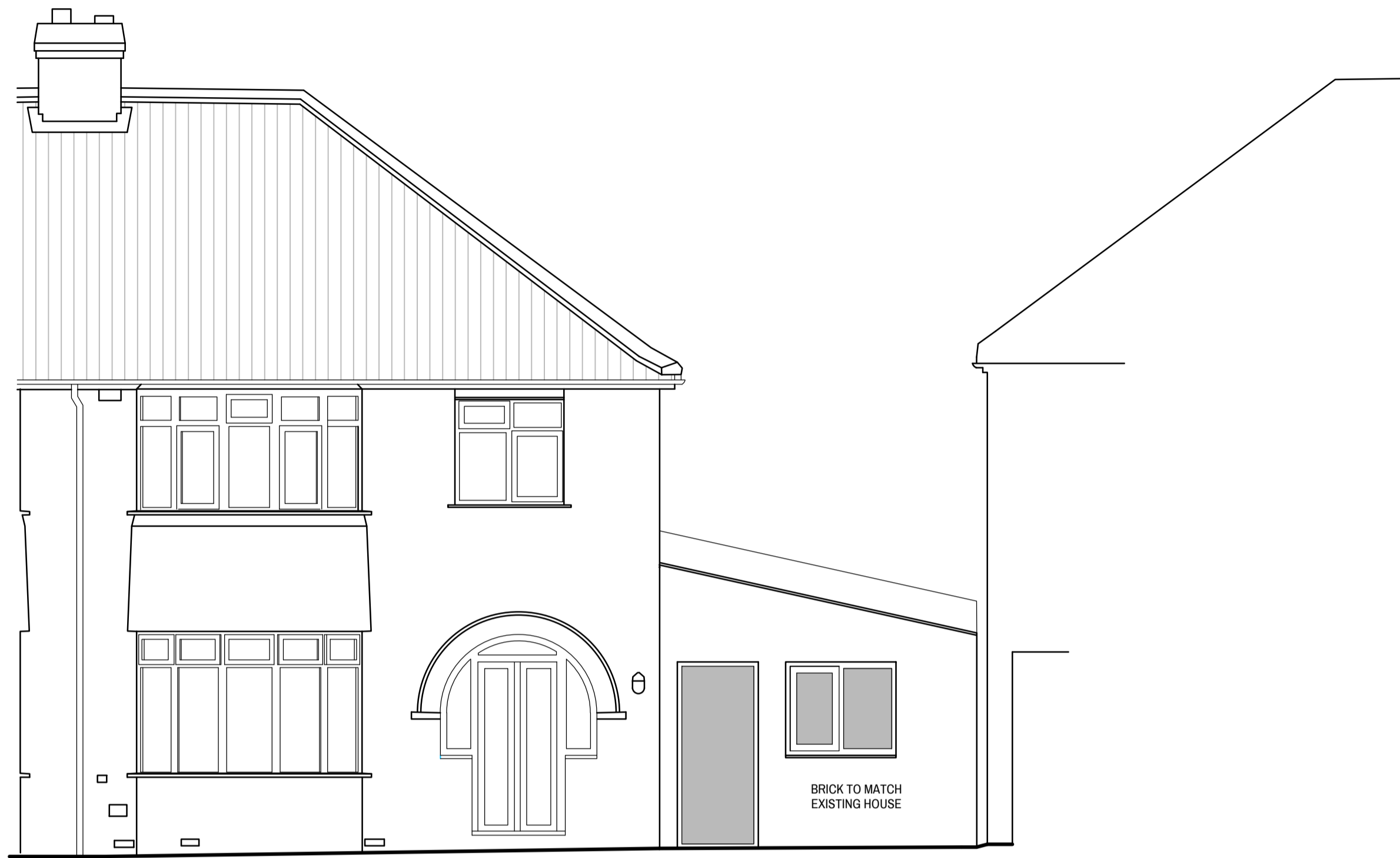
North elevation as proposed

COPYRIGHT OF STEAD & CO (UK) LTD DO NOT SCALE OFF THIS DRAWING. WORK TO FIGURED DIMENSIONS. ANY DISCREPANCY SHOULD BE REPORTED TO THE ARCHITECT