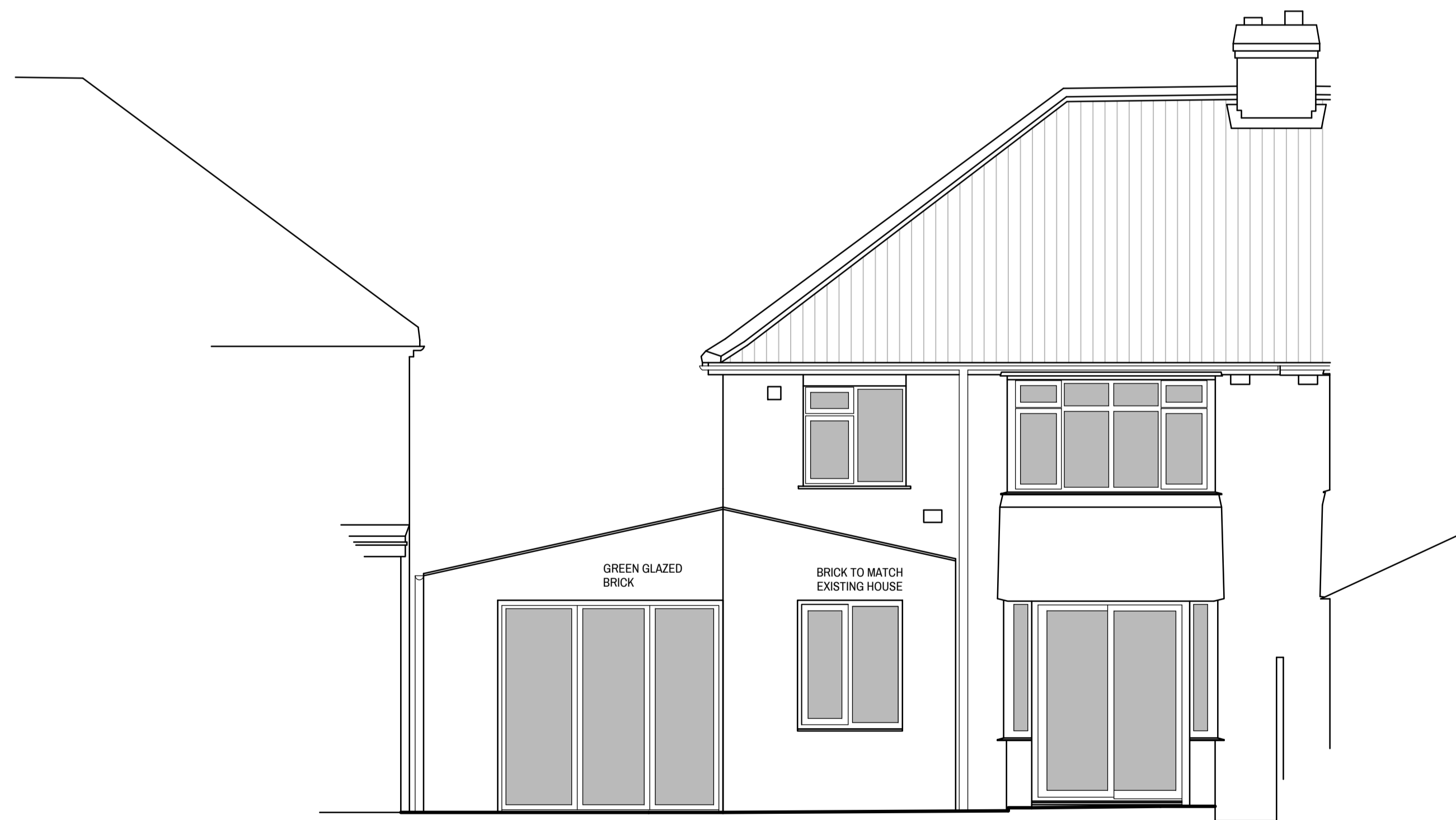
South elevation as proposed