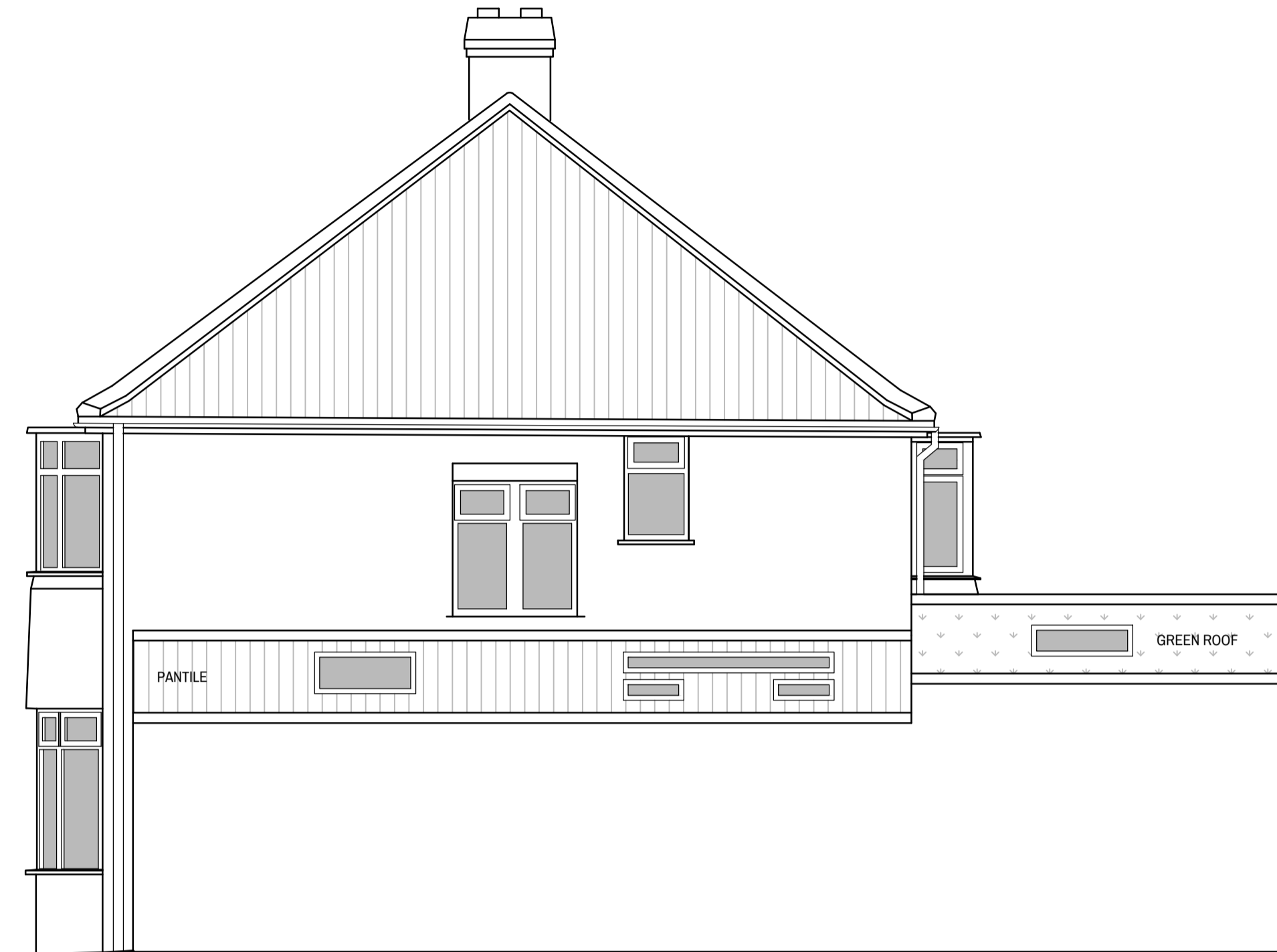
West elevation as Proposed