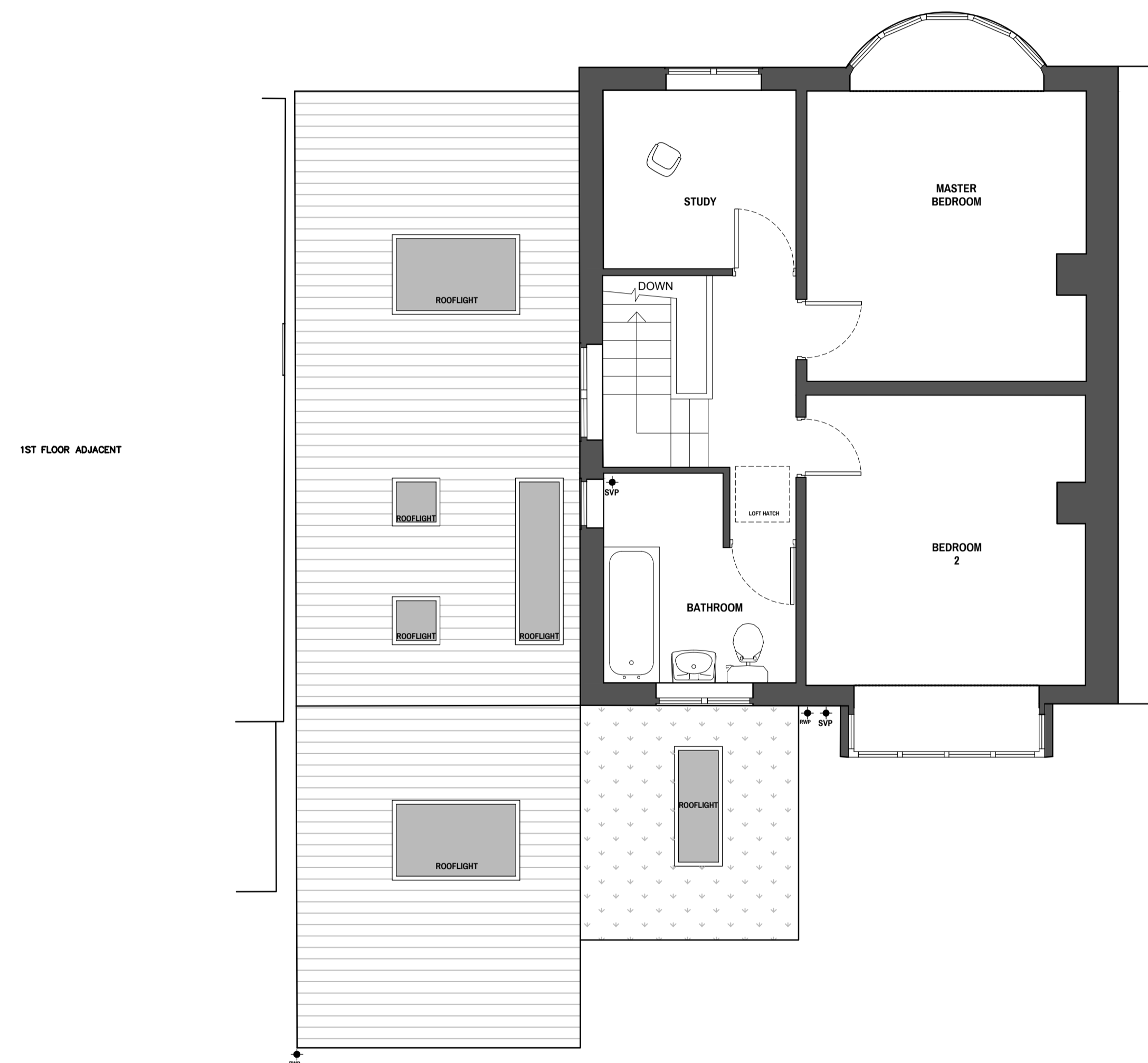
First floor as proposed 1:50