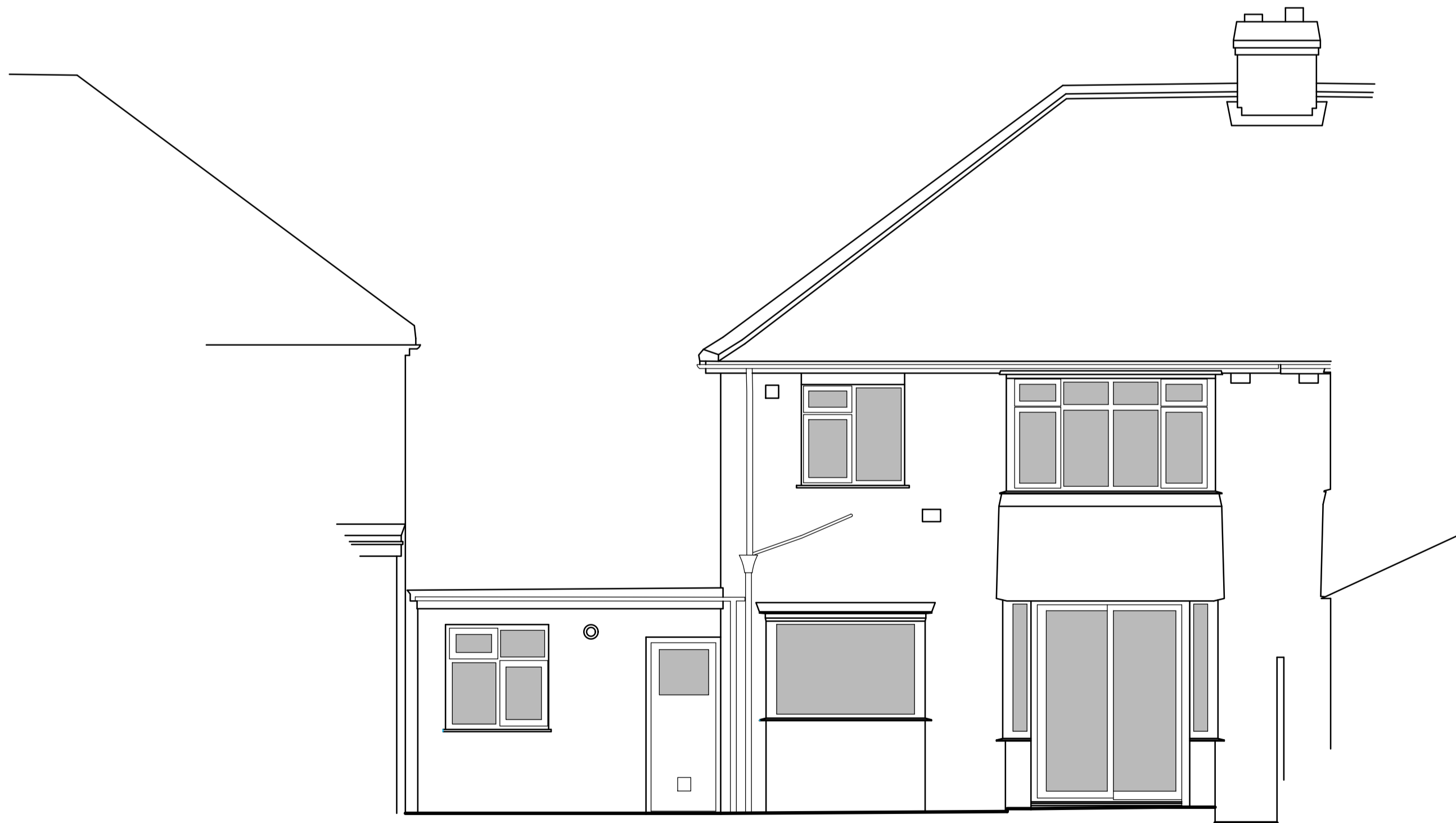
South elevation as existing 1:50