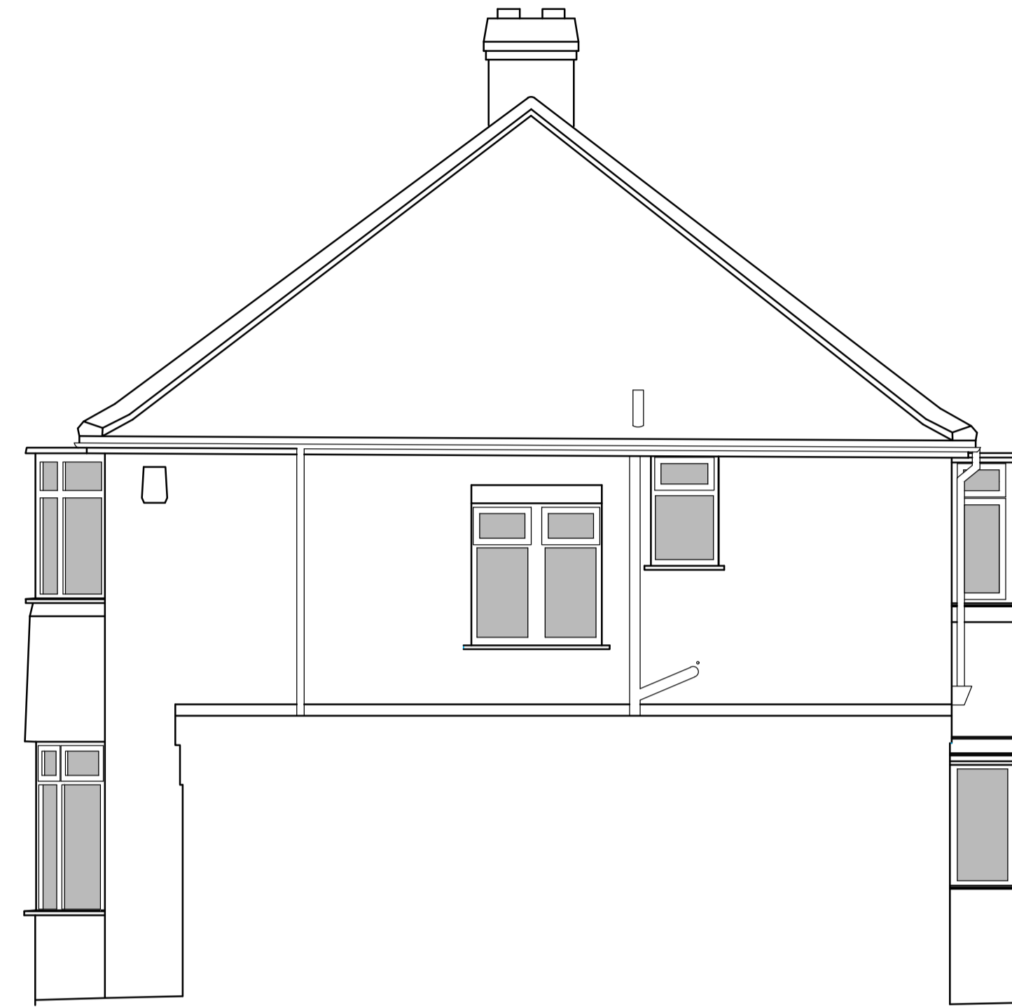
West elevation as existing 1:50