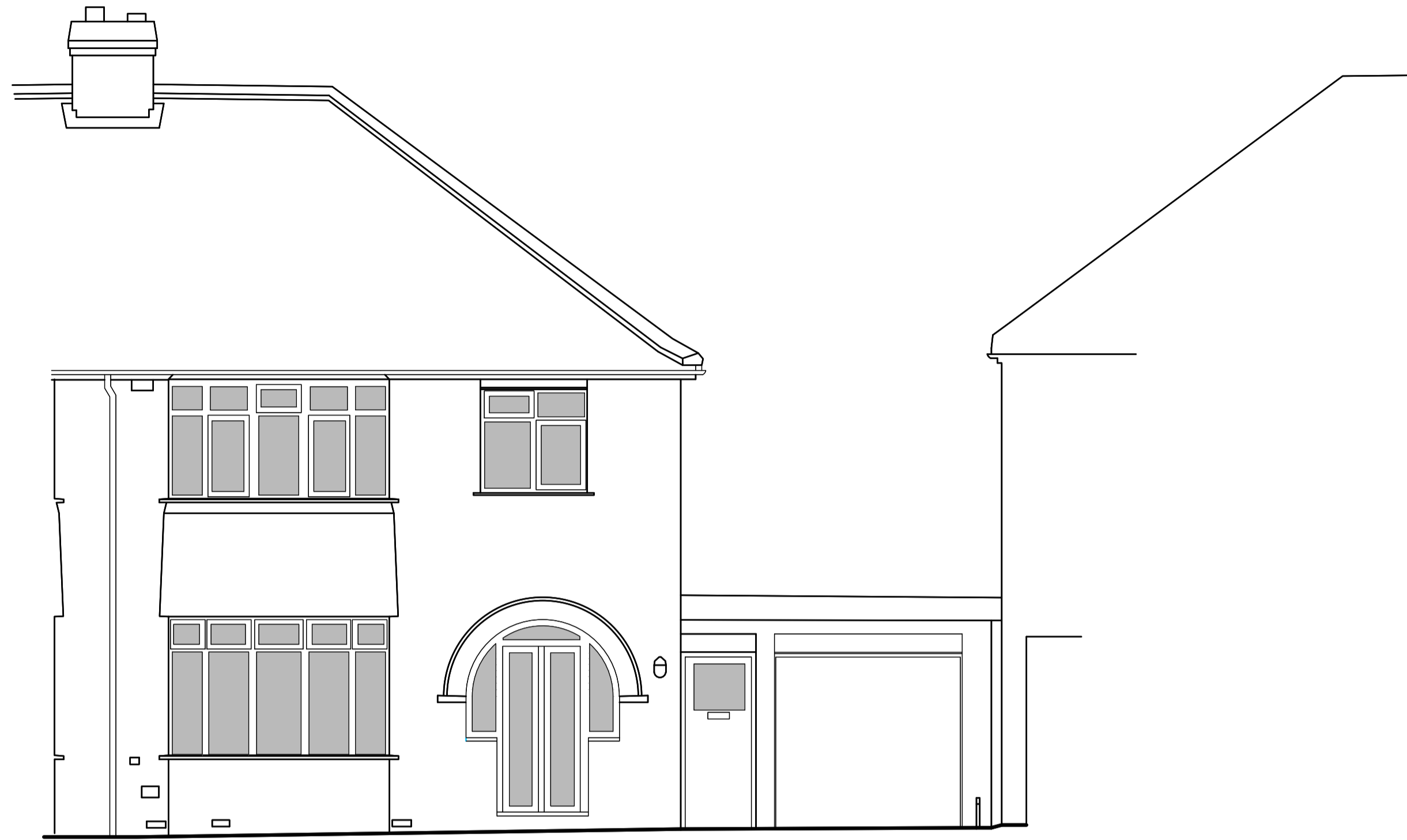
North elevation as existing 1:50

COPYRIGHT OF STEAD & CO (UK) LTD DO NOT SCALE OFF THIS DRAWING. WORK TO FIGURED DIMENSIONS. ANY DISCREPANCY SHOULD BE REPORTED TO THE ARCHITECT