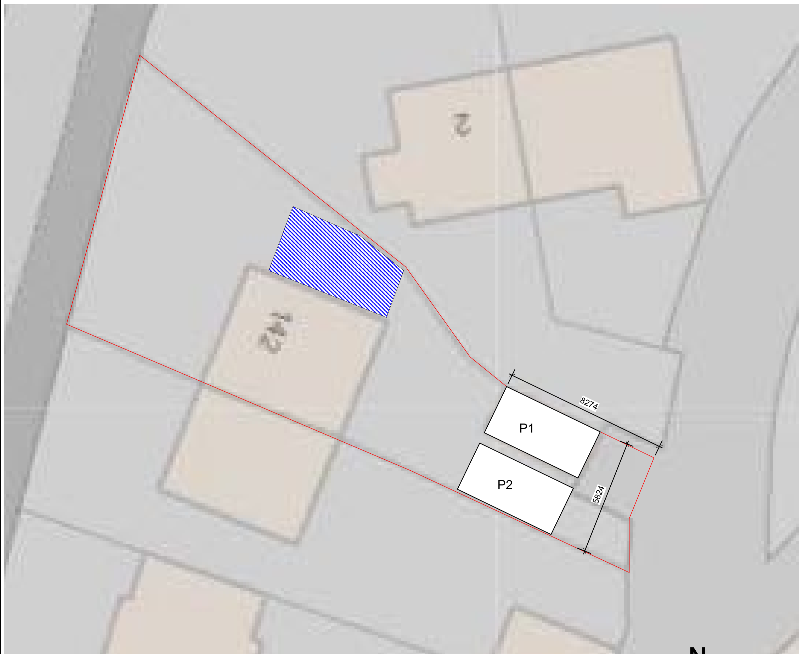
18 Proposed OS Extract Scale: 1:100