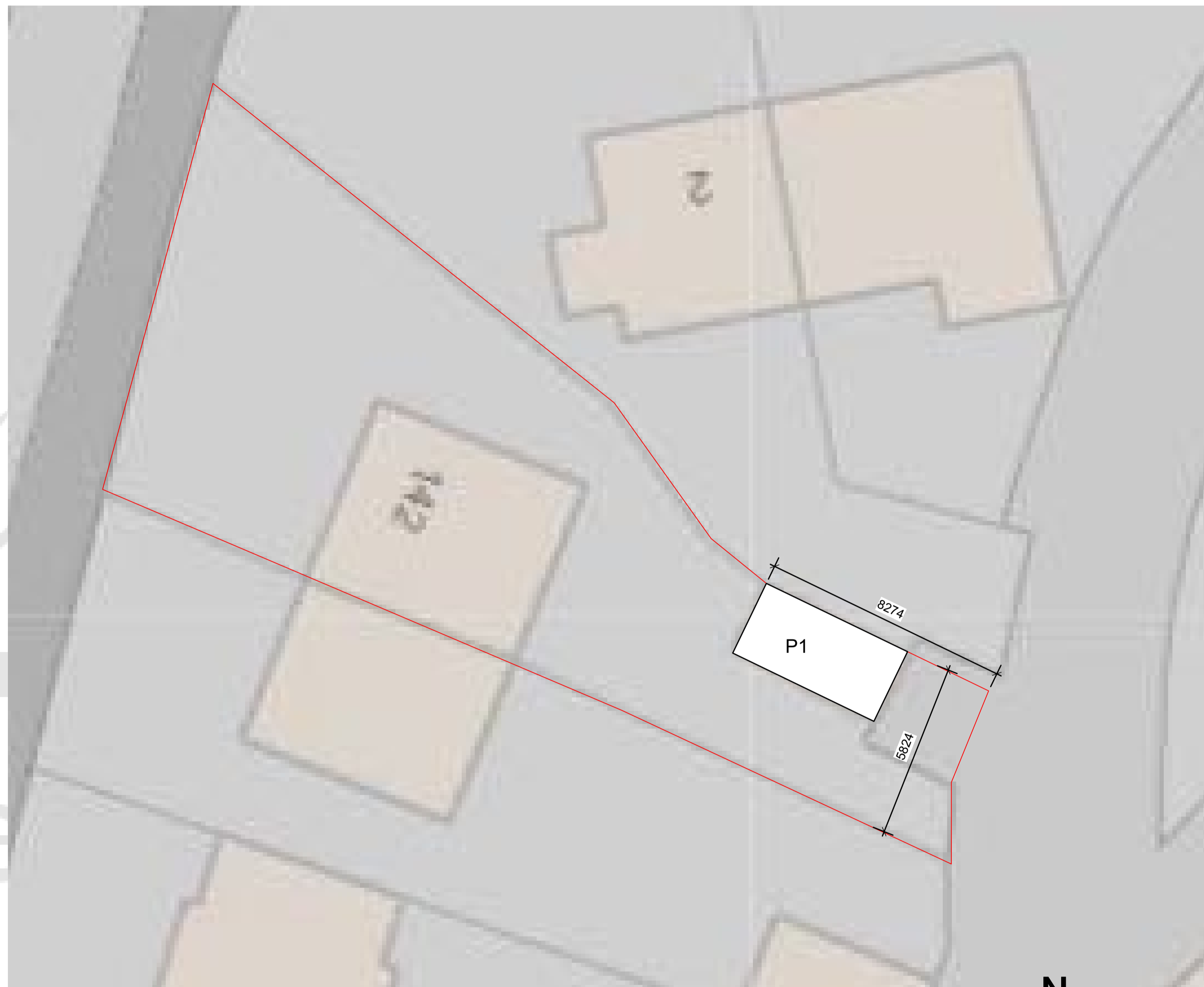
1 Existing OS Extract Scale: 1:100