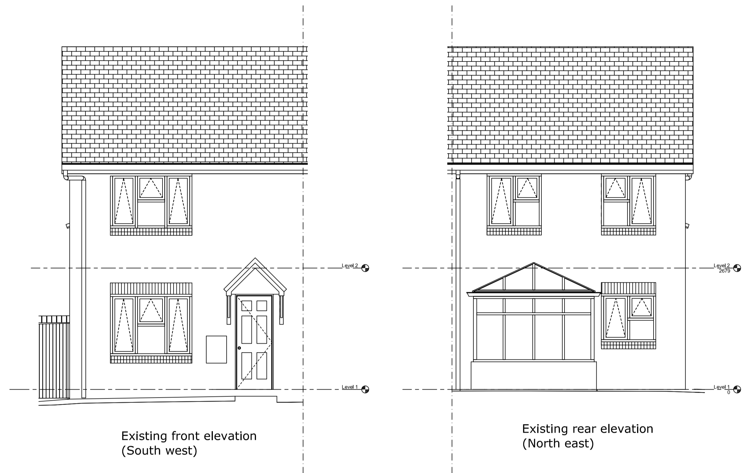
Existing front elevation (South west)