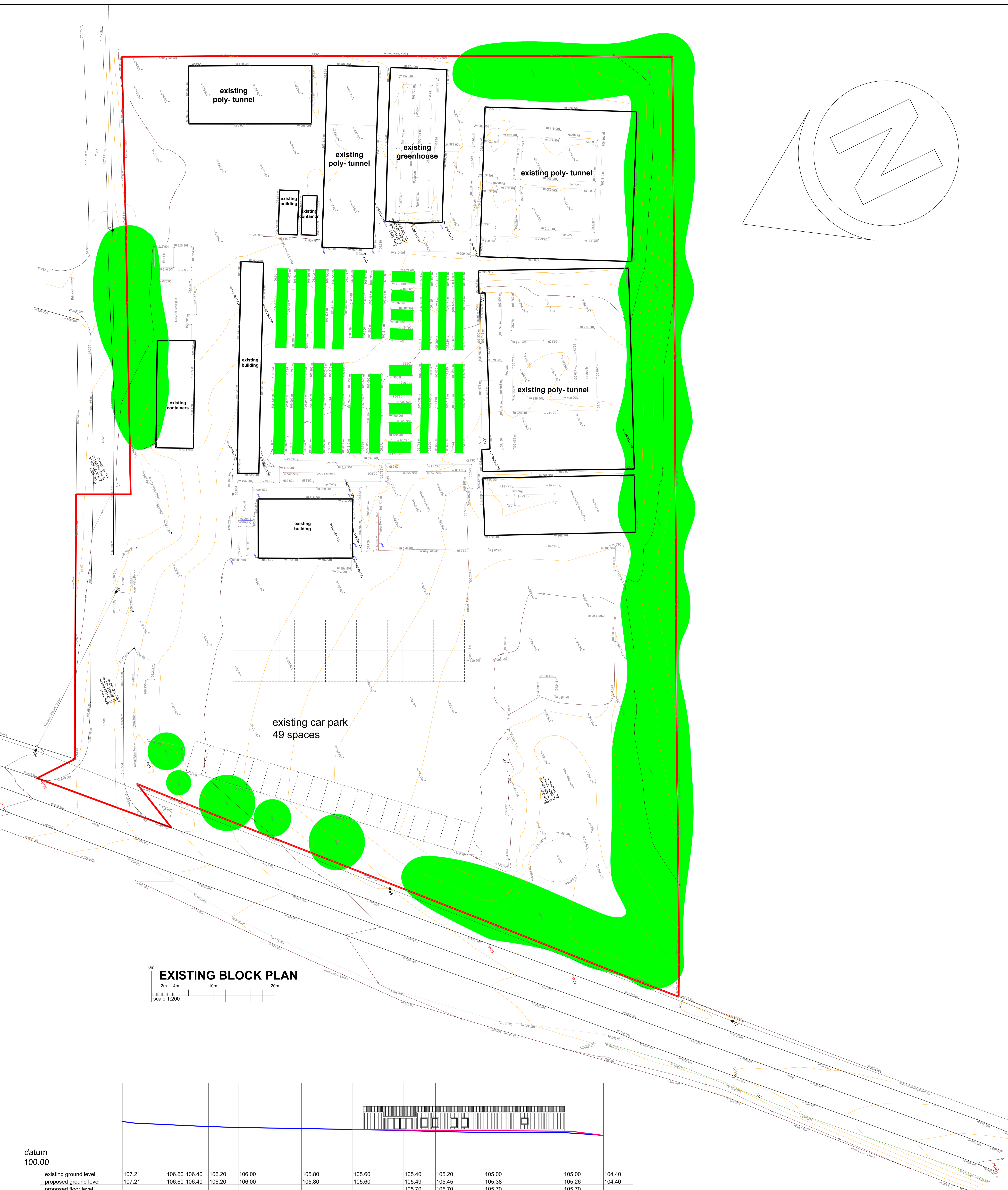
EXISTING BLOCK PLAN 0m 2m 4m 10m 20m scale 1:200