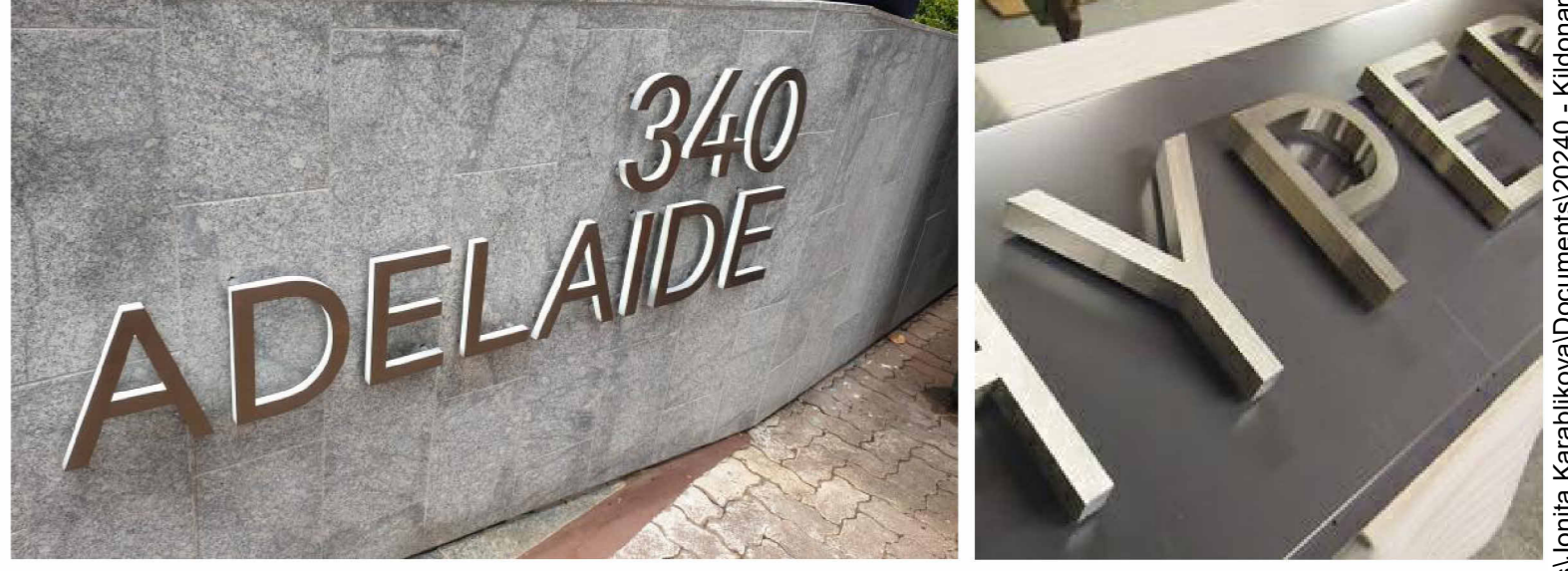
Examples of projected signage (REFERENCE)