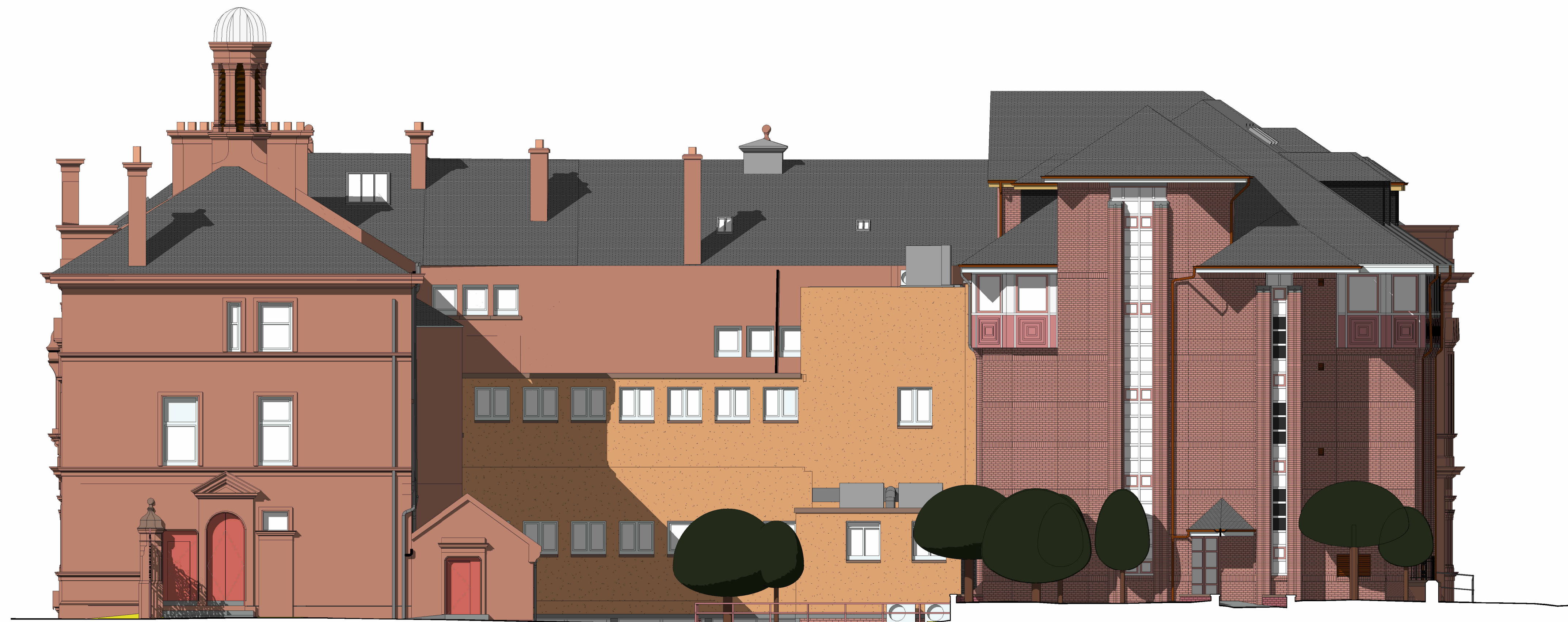
East Elevation - Existing 1 : 100