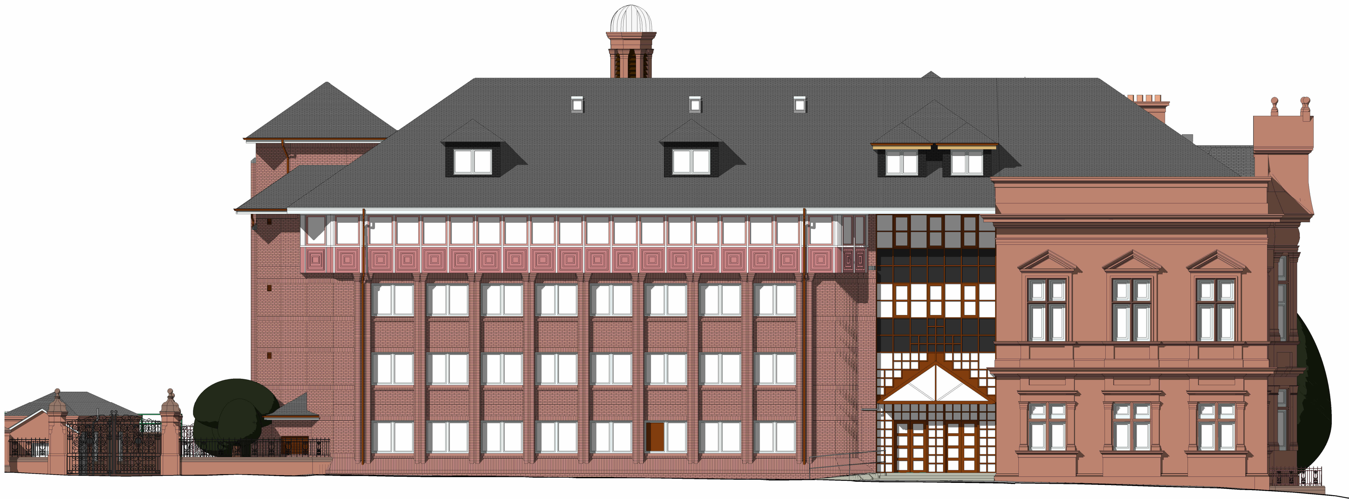
North Elevation - Existing 1 : 100