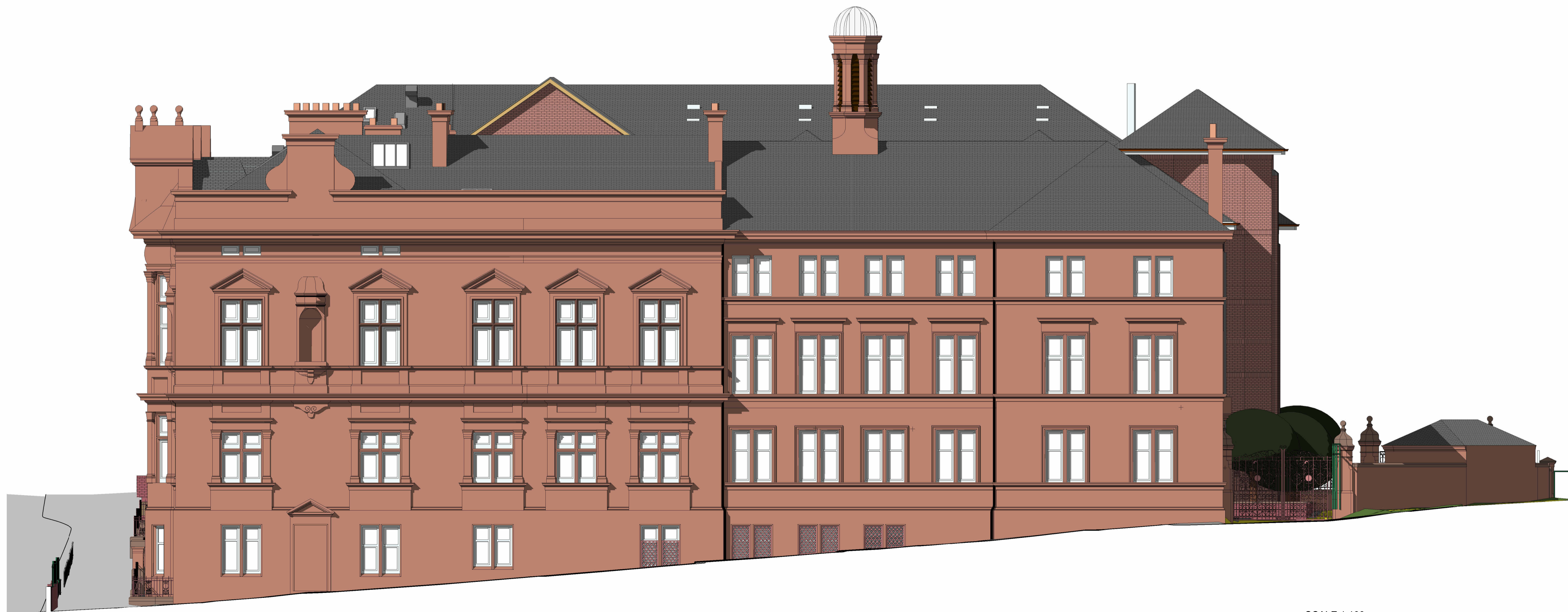
South Elevation - Existing 1 : 100