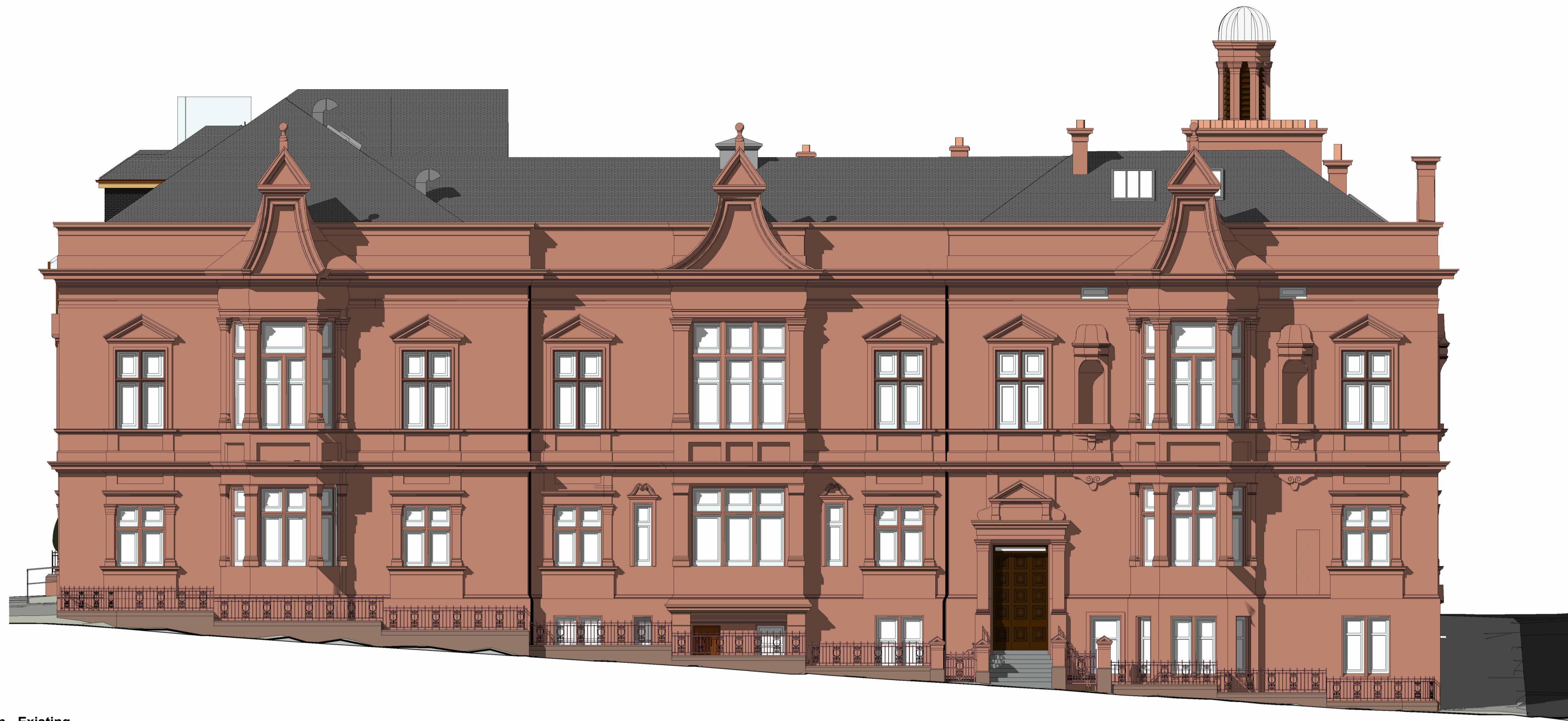
West Elevation - Existing 1 : 100