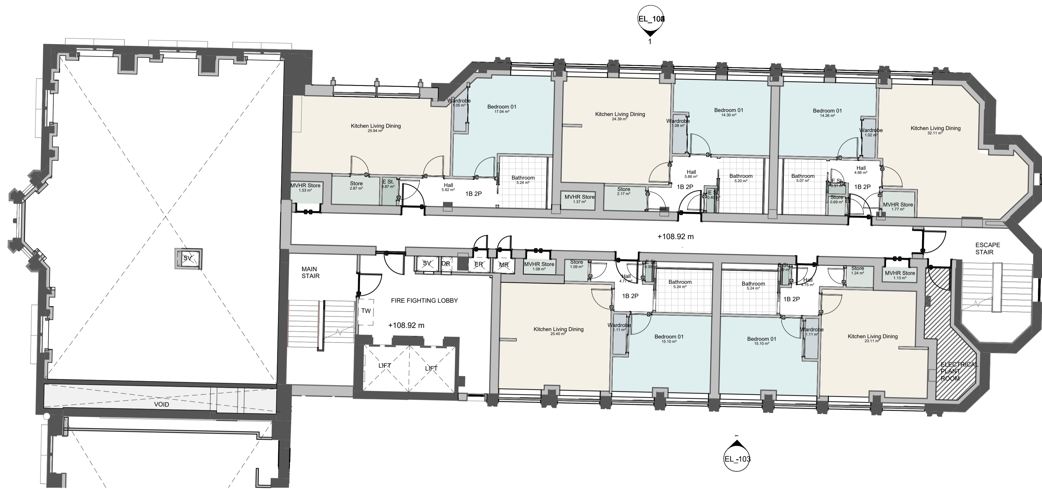
GA_02_Second Floor Plan_Intermediate Level (Extension) 1 : 100