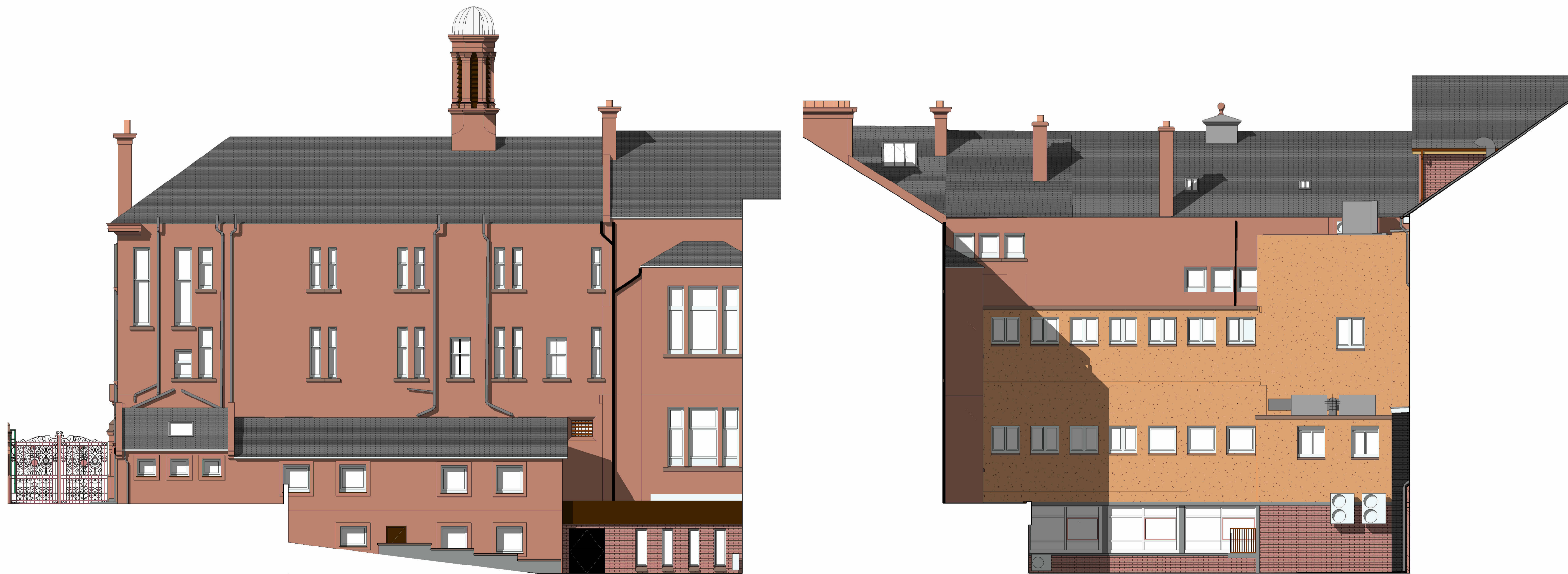
EL_Courtyard_South Existing 1 : 100