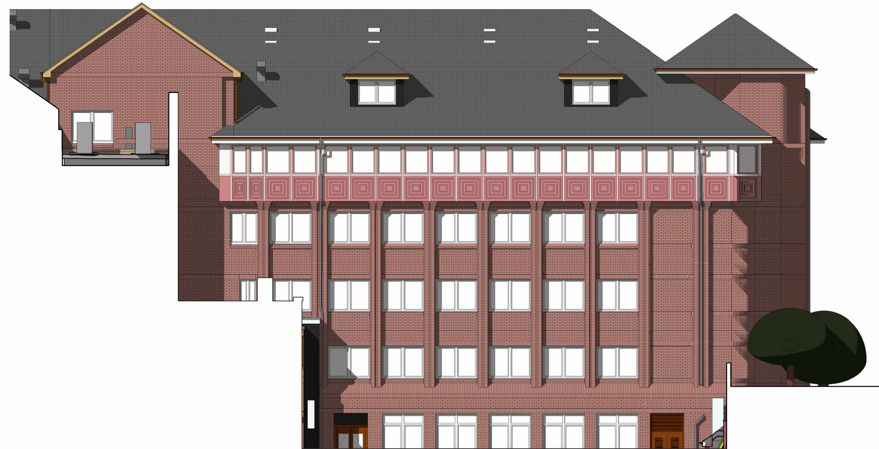
EL_Courtyard_North Existing 1 : 100