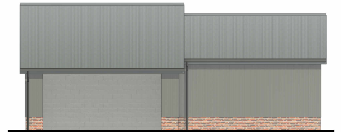
Proposed South East Elevation 1 : 100