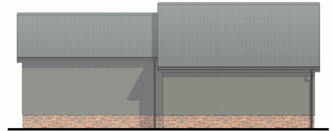
Proposed North West Elevation 1 : 100