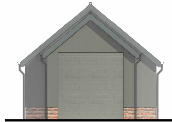
Proposed North East Elevation 1 : 100