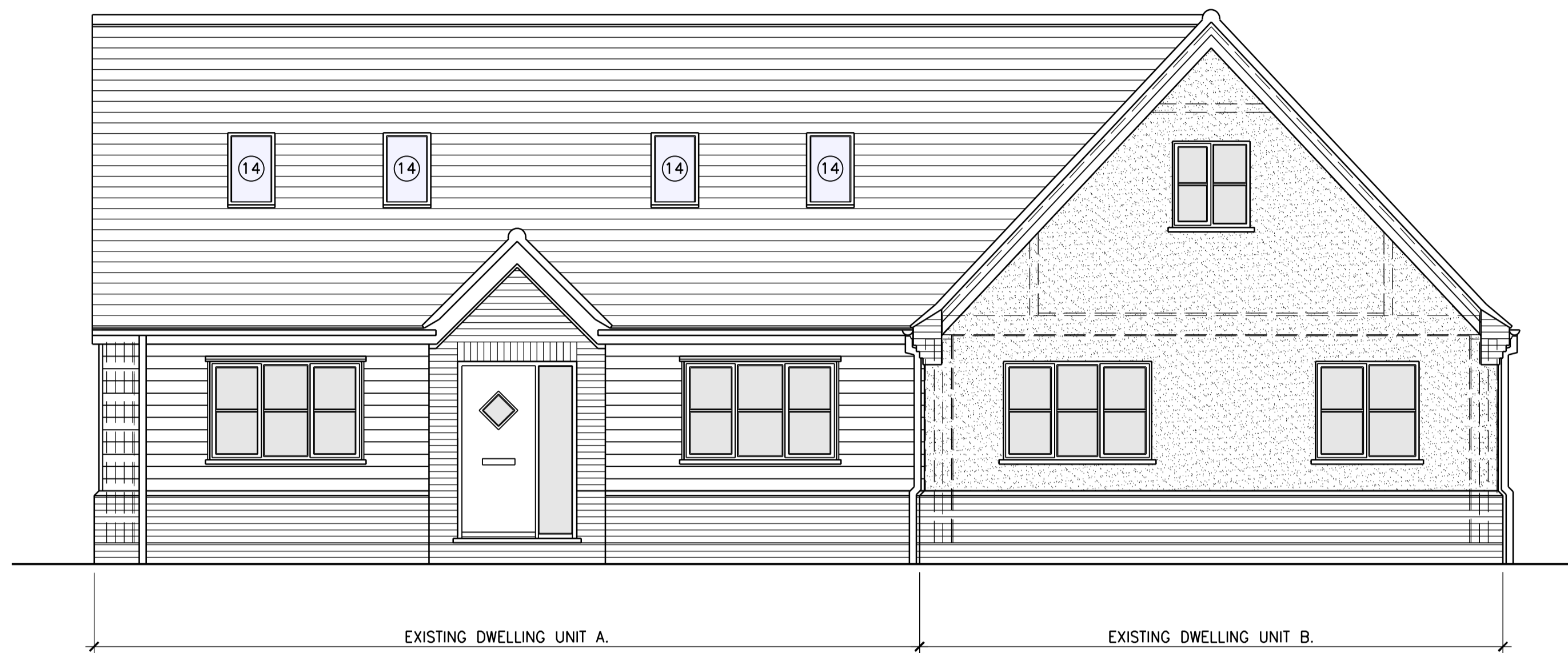
EXISTING FRONT ELEVATION SCALE 1:50

⑭ INSTALL NEW UPVC GRAPHITE GREY DOUBLE GLAZED ROOFLIGHTS IN ACCORDANCE WITH NOTE-14.