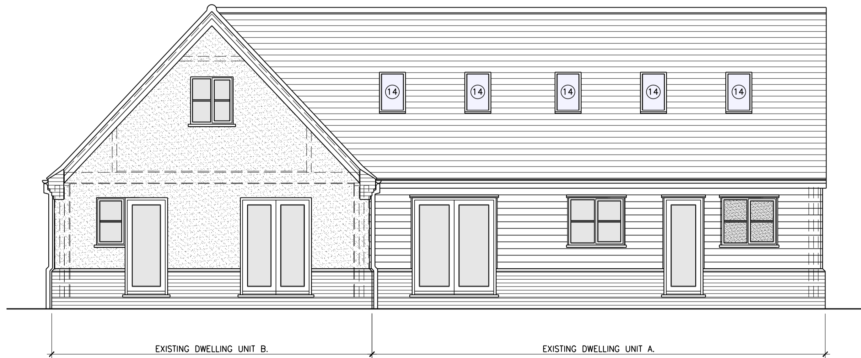
EXISTING REAR ELEVATION SCALE 1:50

⑭ INSTALL NEW UPVC GRAPHITE GREY DOUBLE GLAZED ROOFLIGHTS IN ACCORDANCE WITH NOTE-14.