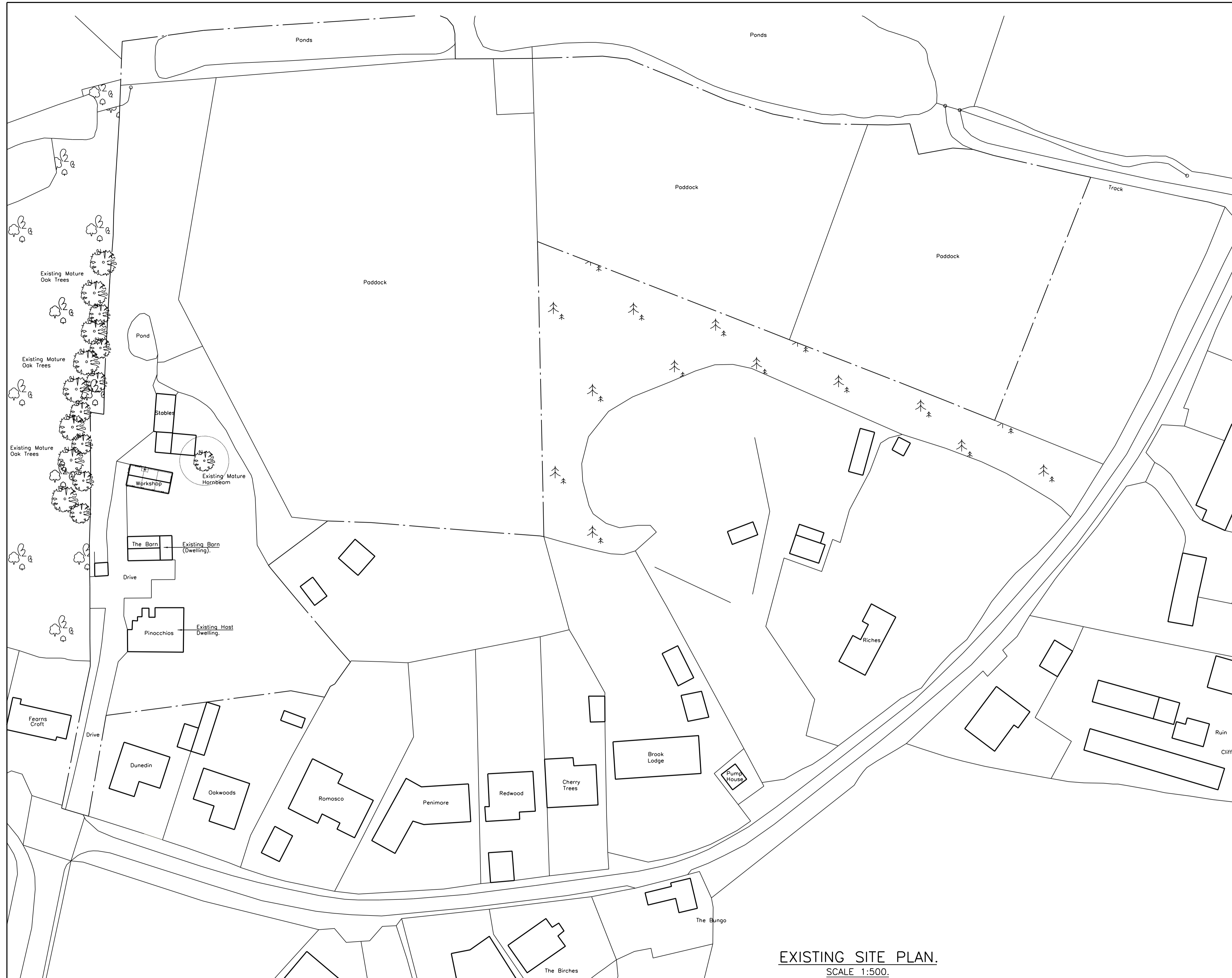
EXISTING SITE PLAN. SCALE 1:500.