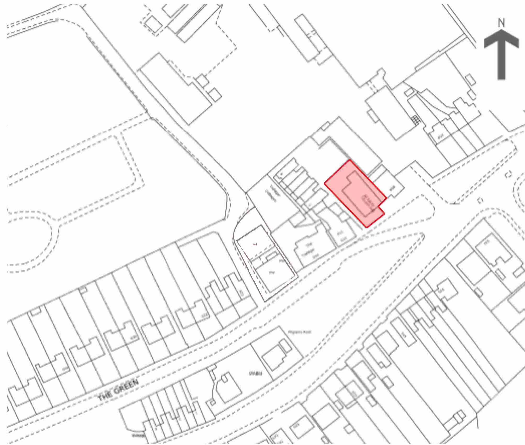
Location Map 1:1250