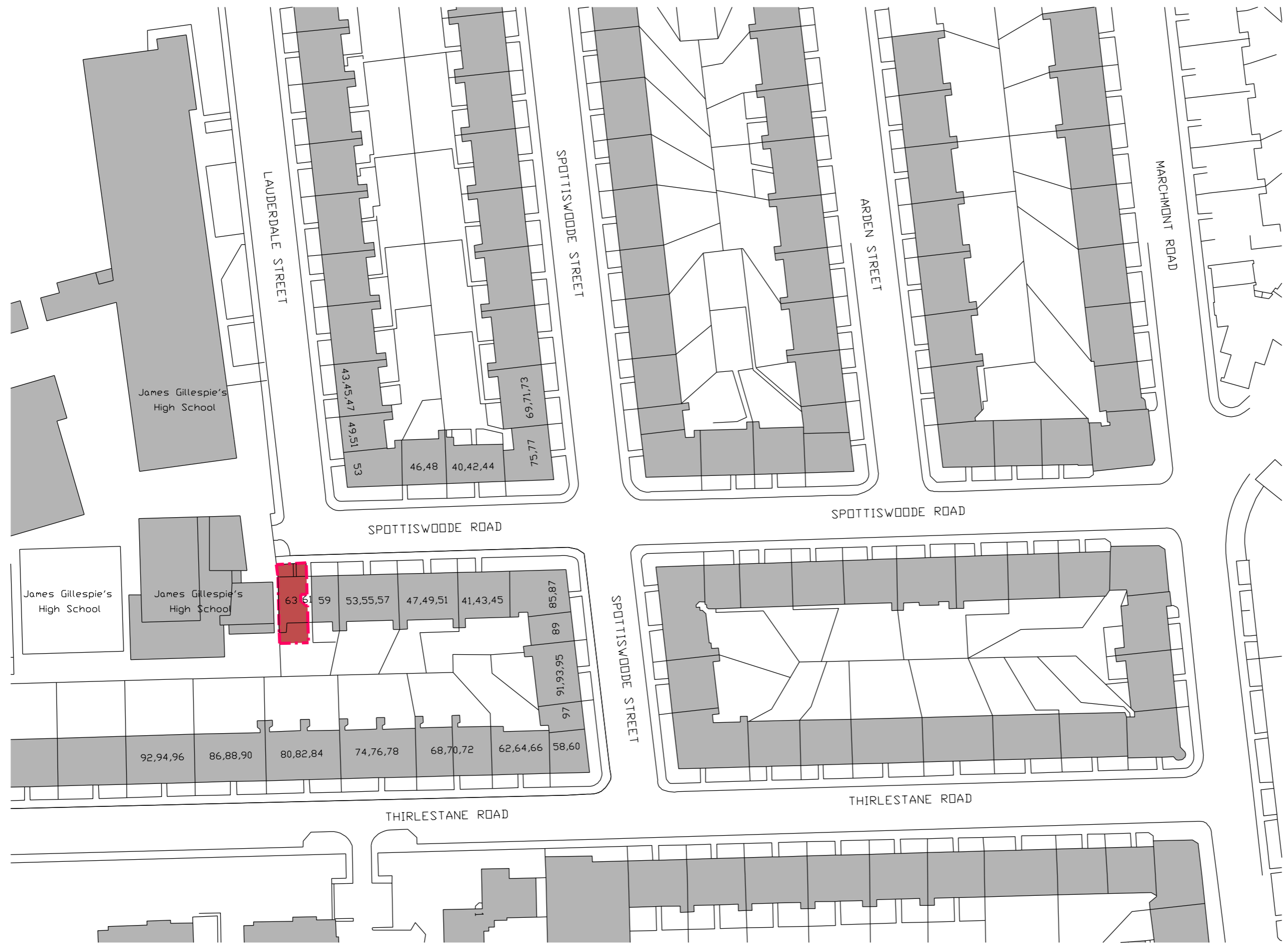
LOCATION PLAN SCALE 1:1250@A3

--- PROPERTY BOUNDARY ■ 63 SPOTISWOODE ROAD