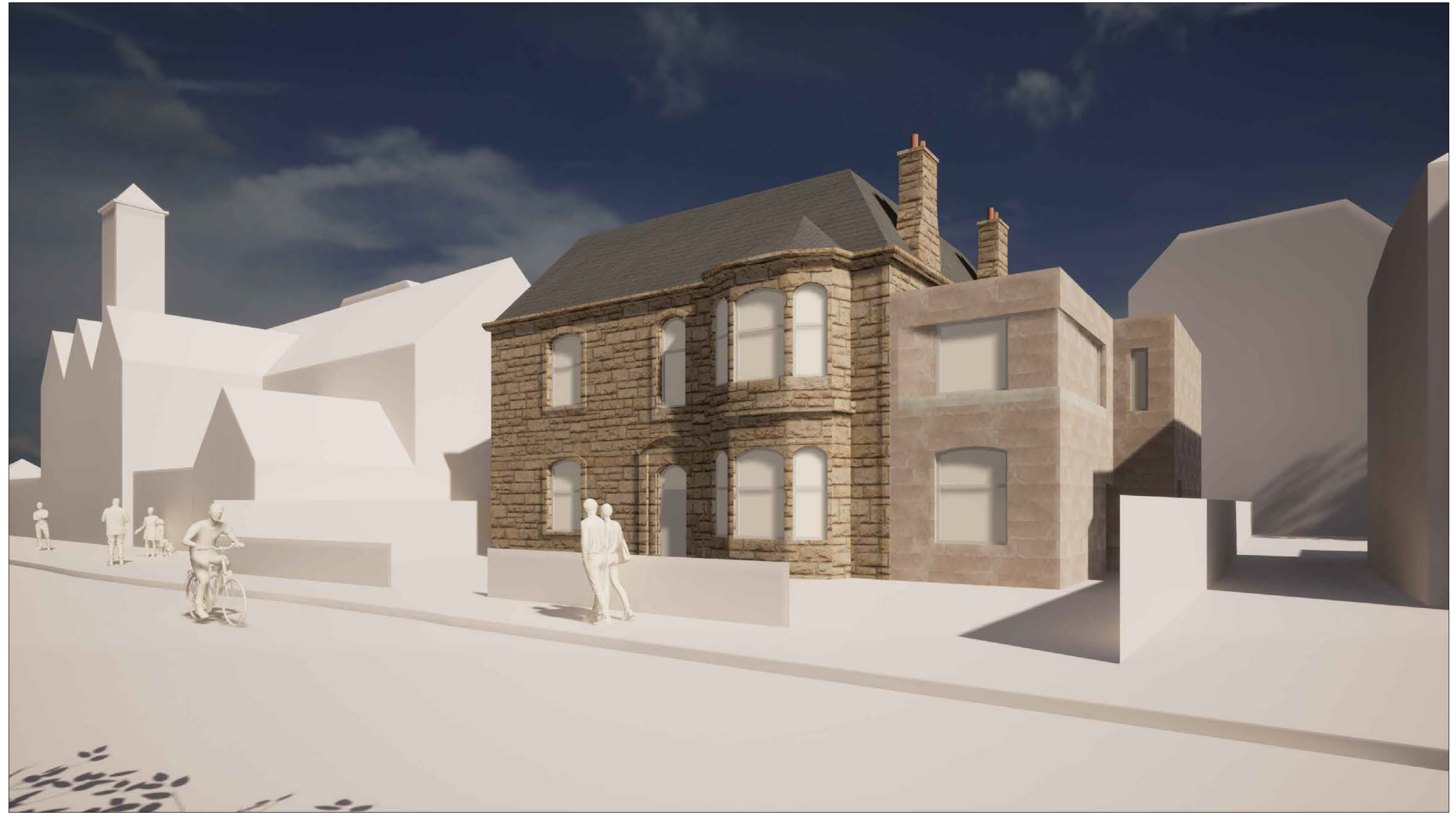
PROPOSED VISUALISATION - VIEW FROM CHAMBERLAIN ROAD