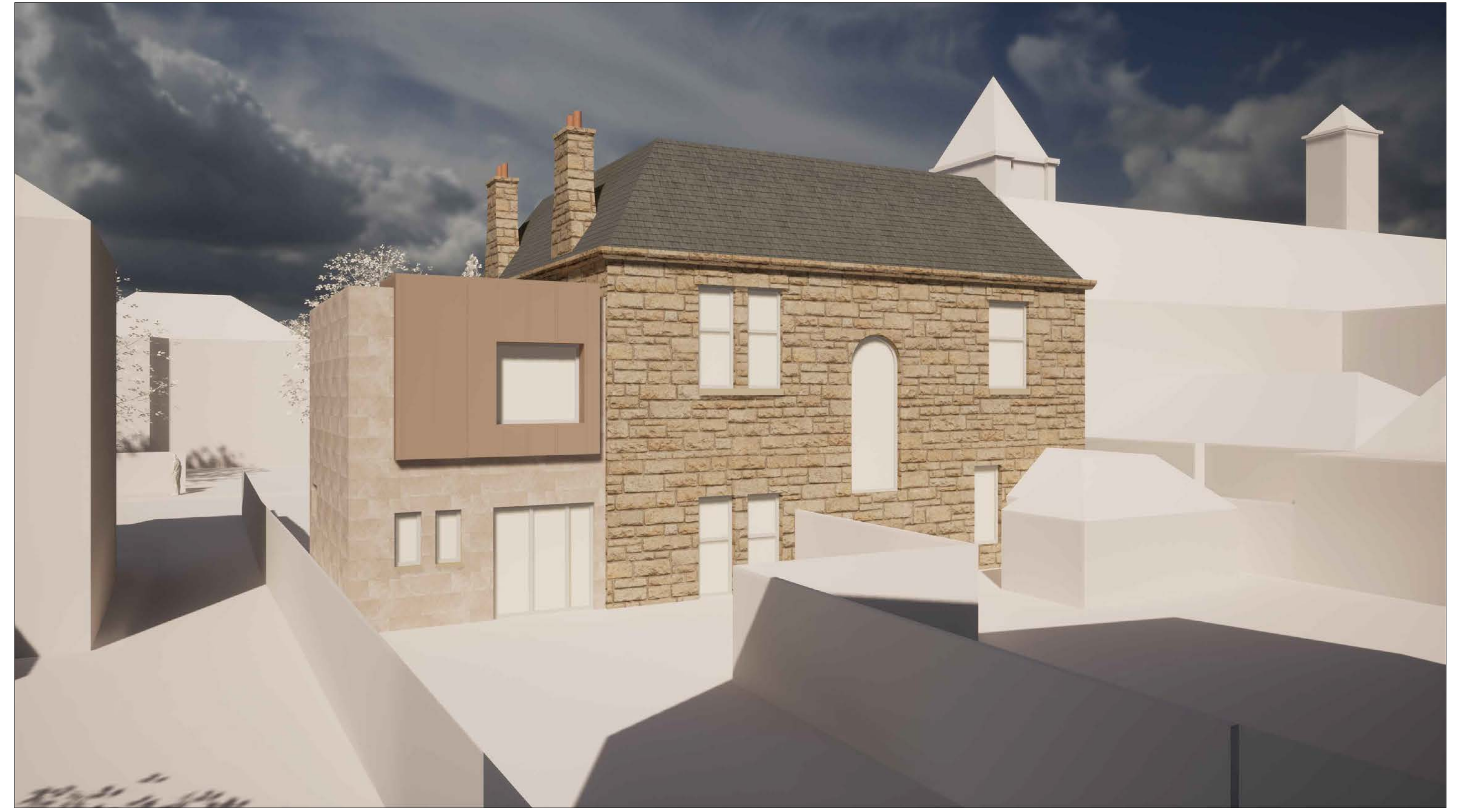
PROPOSED VISUALISATION - REAR ELEVATION VIEW