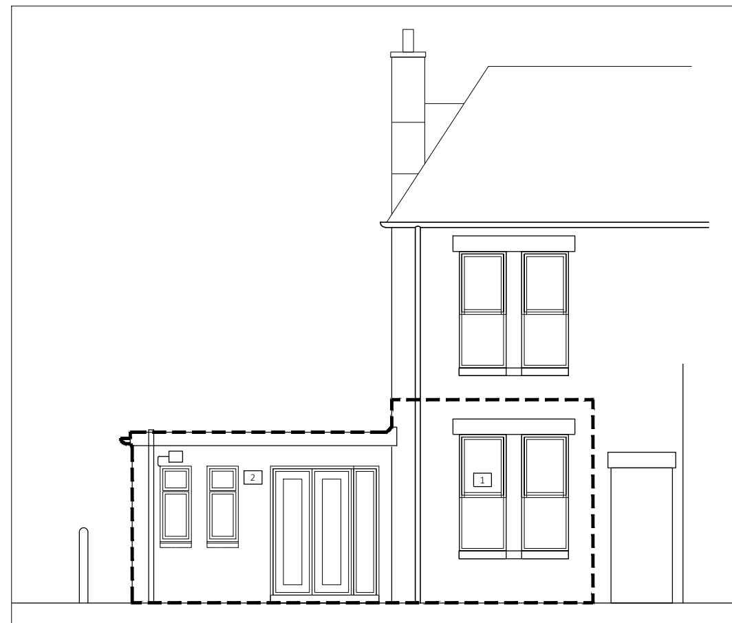
B- REAR ELEVATION - 1:100