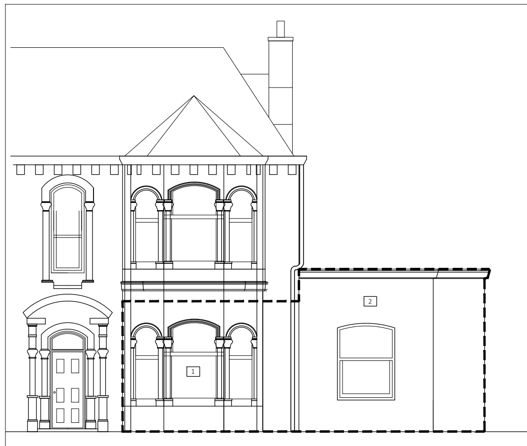
A - FRONT ELEVATION - 1:100