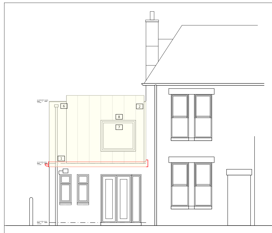
B- REAR ELEVATION - 1:100