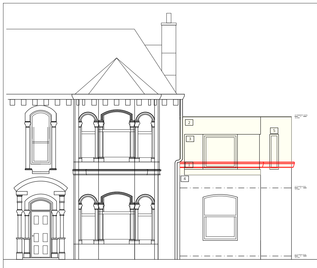
A - FRONT ELEVATION - 1:100