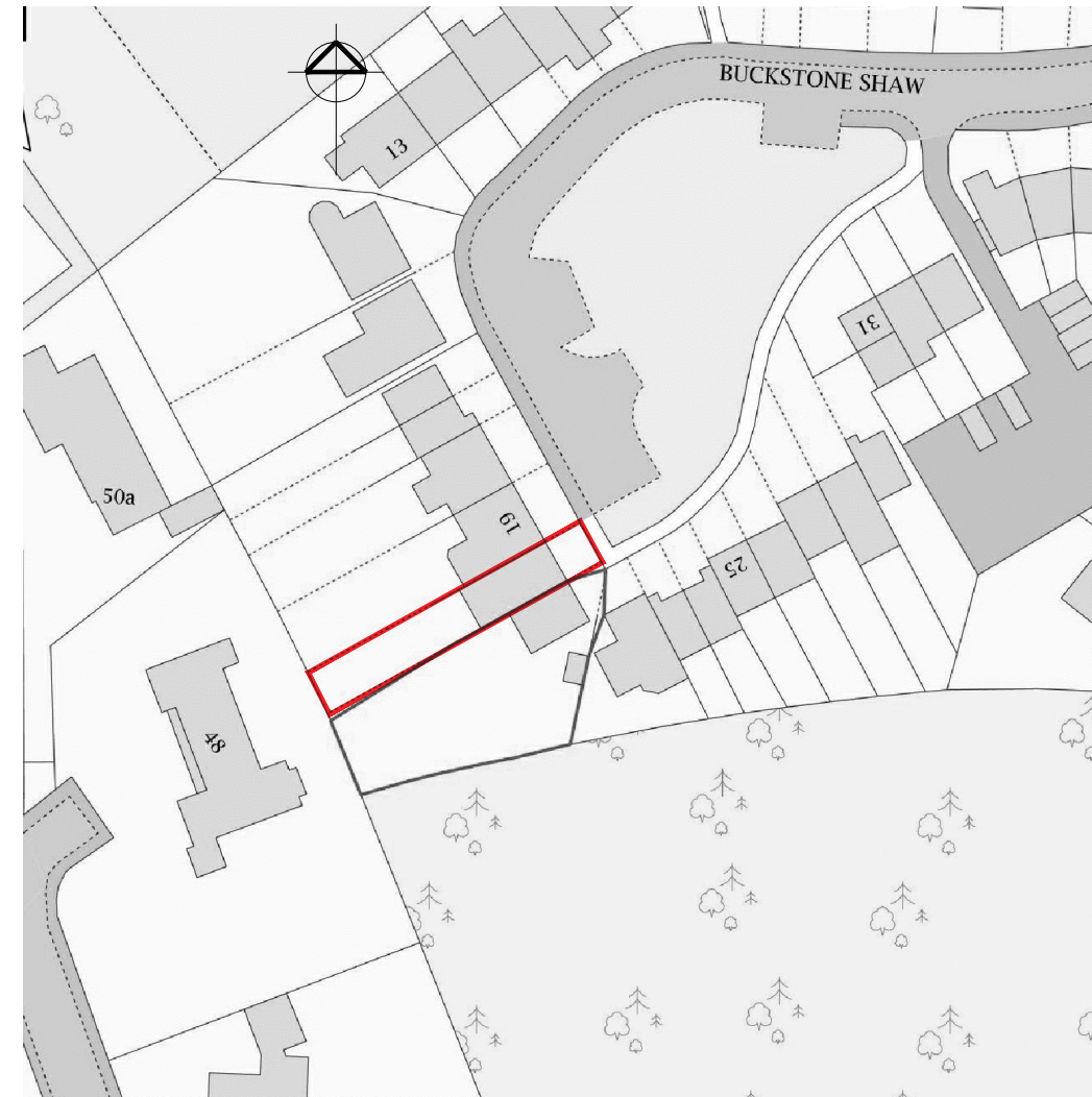
Location Plan 1:1000