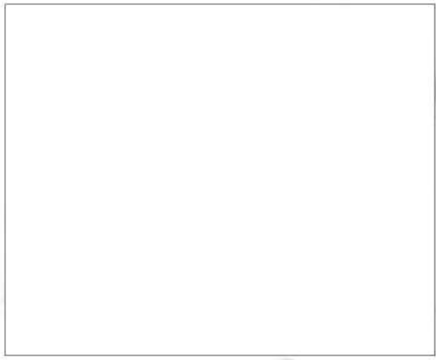
SITE PLAN [ SCALE 1:1250 ]

EXISTING VENTILATORS ARE 1.7M HIGH WITH OPENING INSIDE EXISTING SOLID BLOCK WALL TO BE REPLACED WITH PROPOSED CAVITY BLOCK WALLS WITH RENDER FINISH TO ENHANCE THE ENERGY PERFORMANCE OF PROPERTY