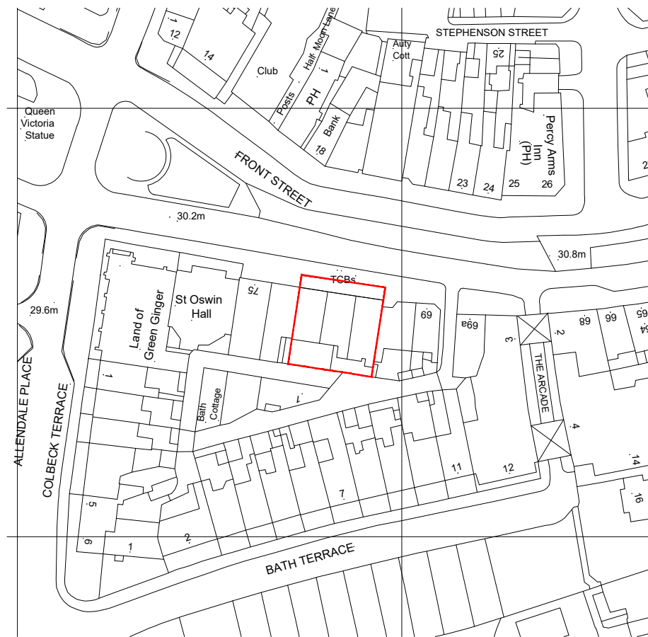
1 SITE LOCATION PLAN 1:1250