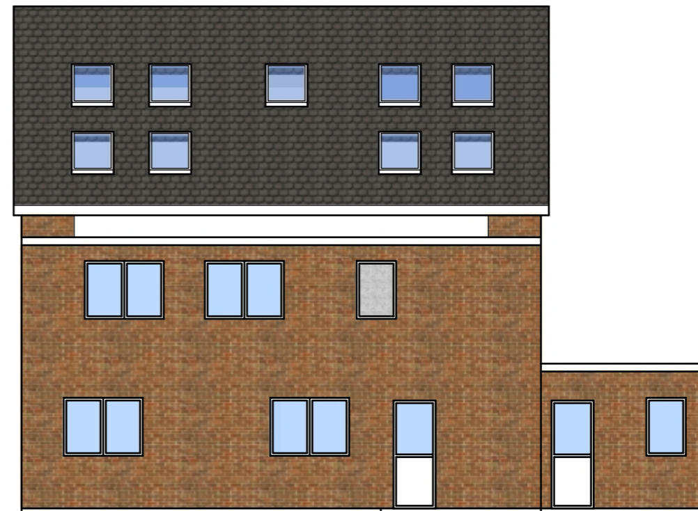
PROPOSED REAR ELEVATION SCALE 1:100 @ A3