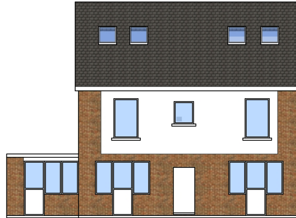
PROPOSED FRONT ELEVATION SCALE 1:100 @ A3